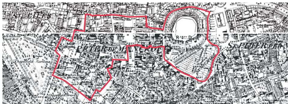
Extract from 1880 - 1886 OS map

1738 to form the cattle market which in turn was redeveloped with the construction of Castle Mall in 1993.