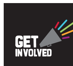
Colour version reversed