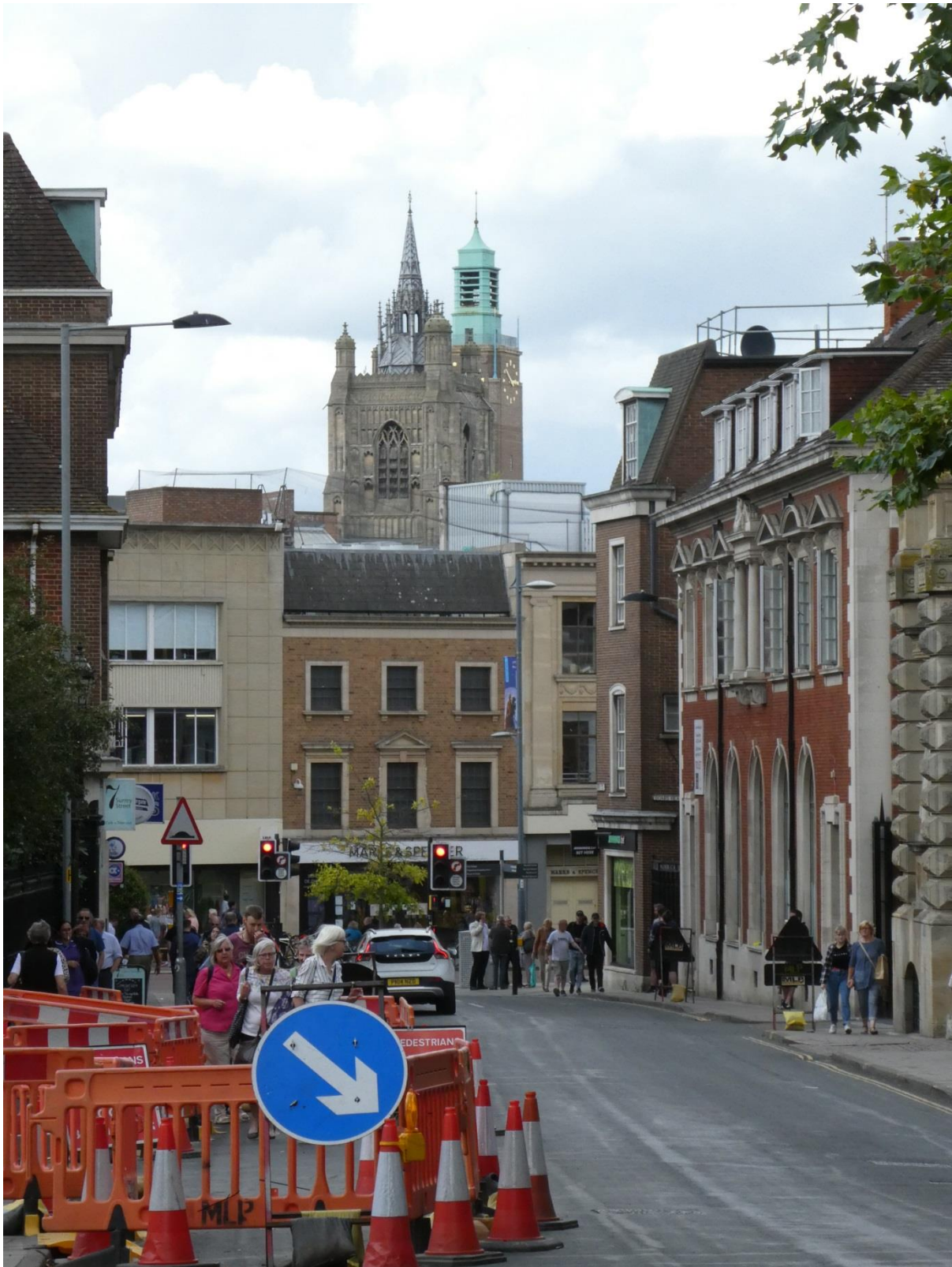
10 – The tower of St. Peter Mancroft and the clock tower of City Hall