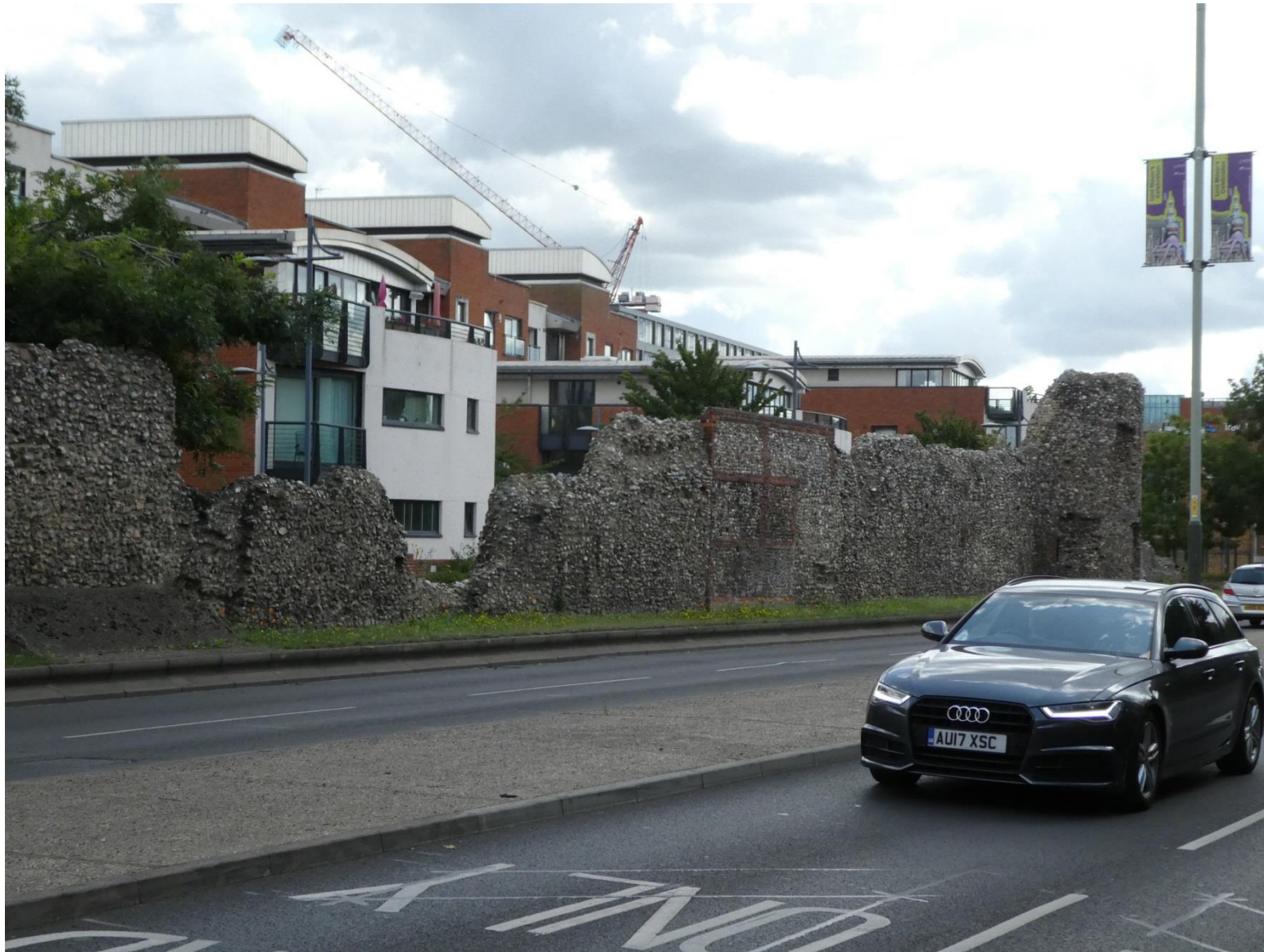
04 – The City Walls – on Chapel Field Road