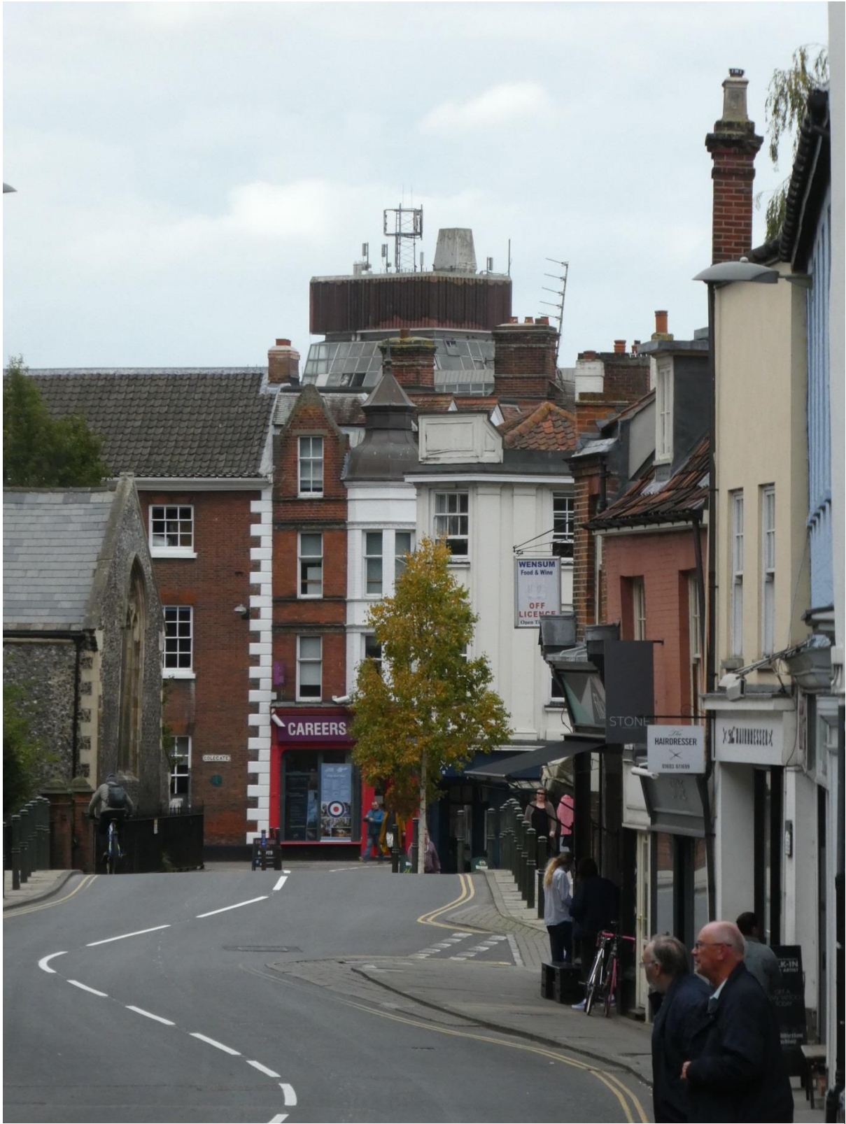
06 – Looking north across Fye Bridge