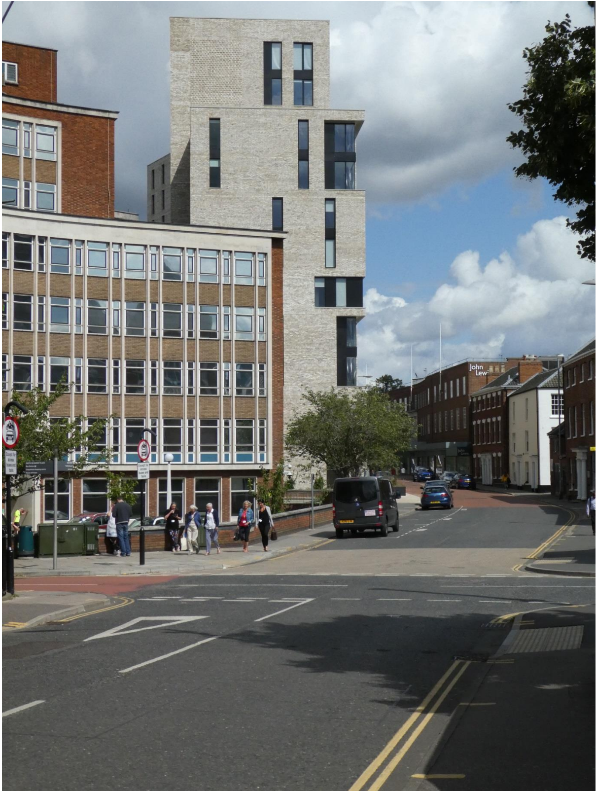
18 – A contrast of scale – the “Quad” (Pablo Fanque House) on All Saints Green