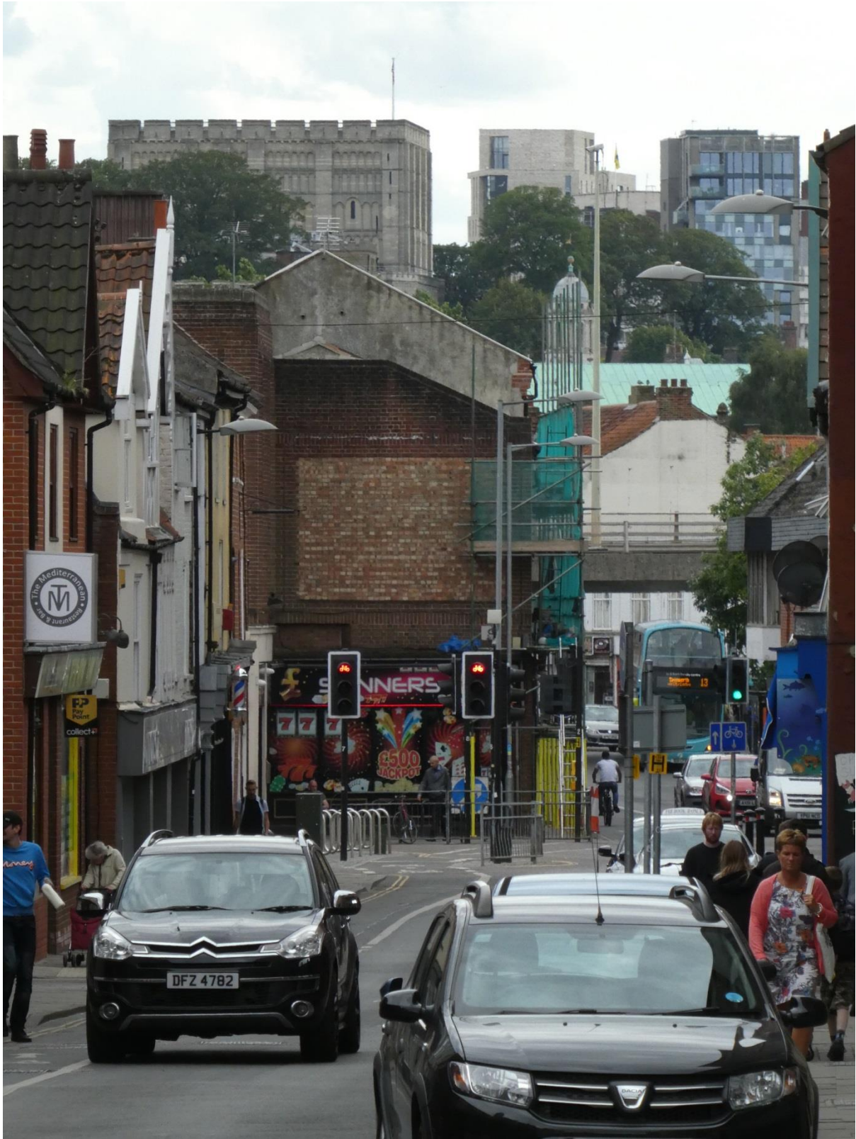
20 – Looking south from Magdalen Street to the castle