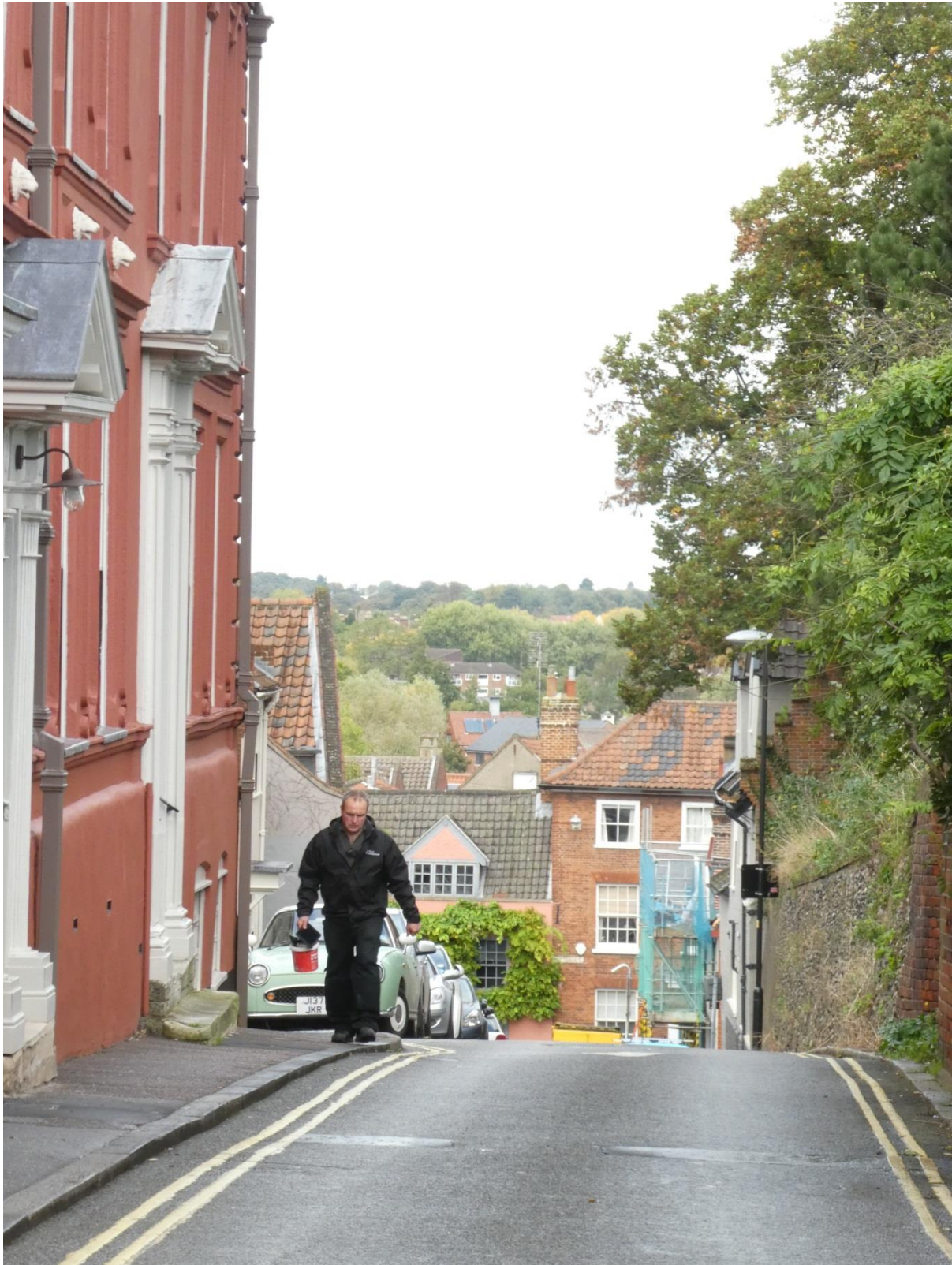
14 – Looking down Cow Hill and across to the wooded ridge north of the Wensum