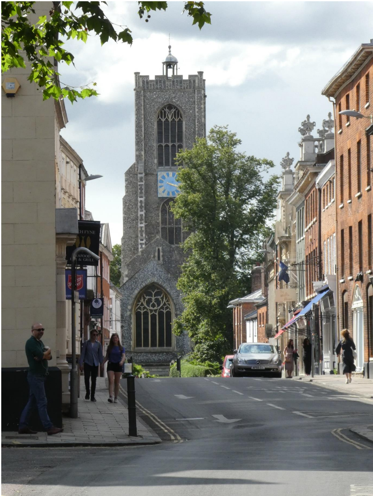
11 – Along St. Giles Street to St. Giles Church