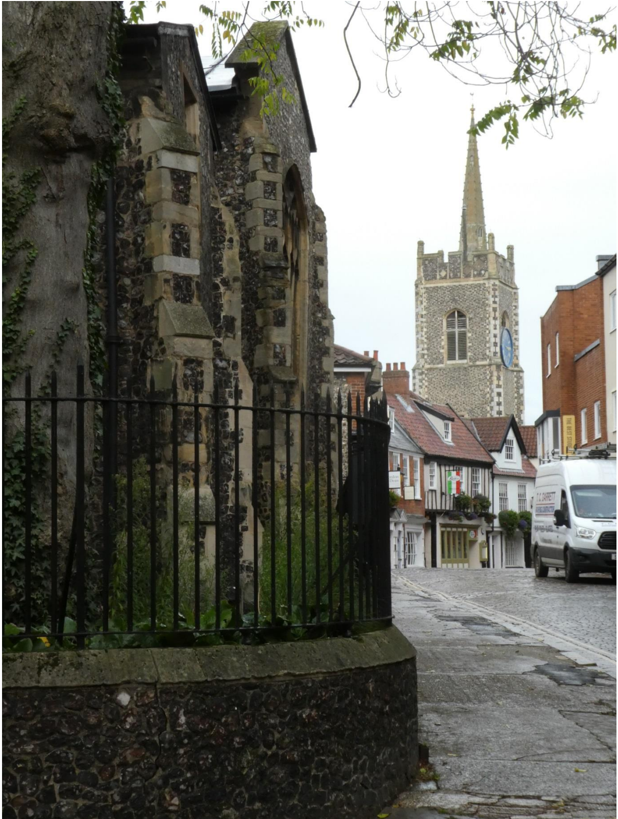
22 – St. Peter Hungate, St. George Tombland and the cathedral spire