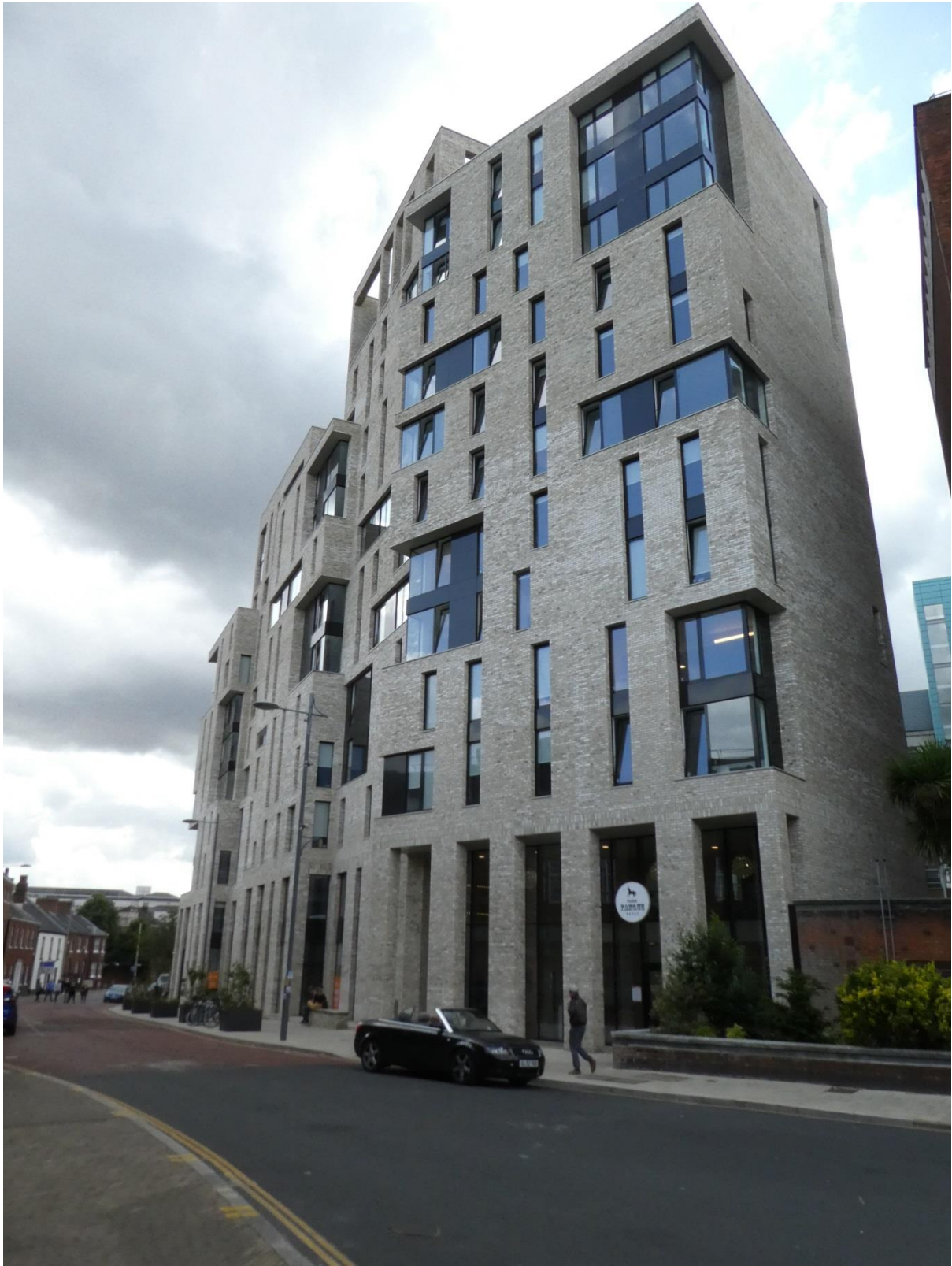
19 – The Quad (Pablo Fanque House) on All Saints Green