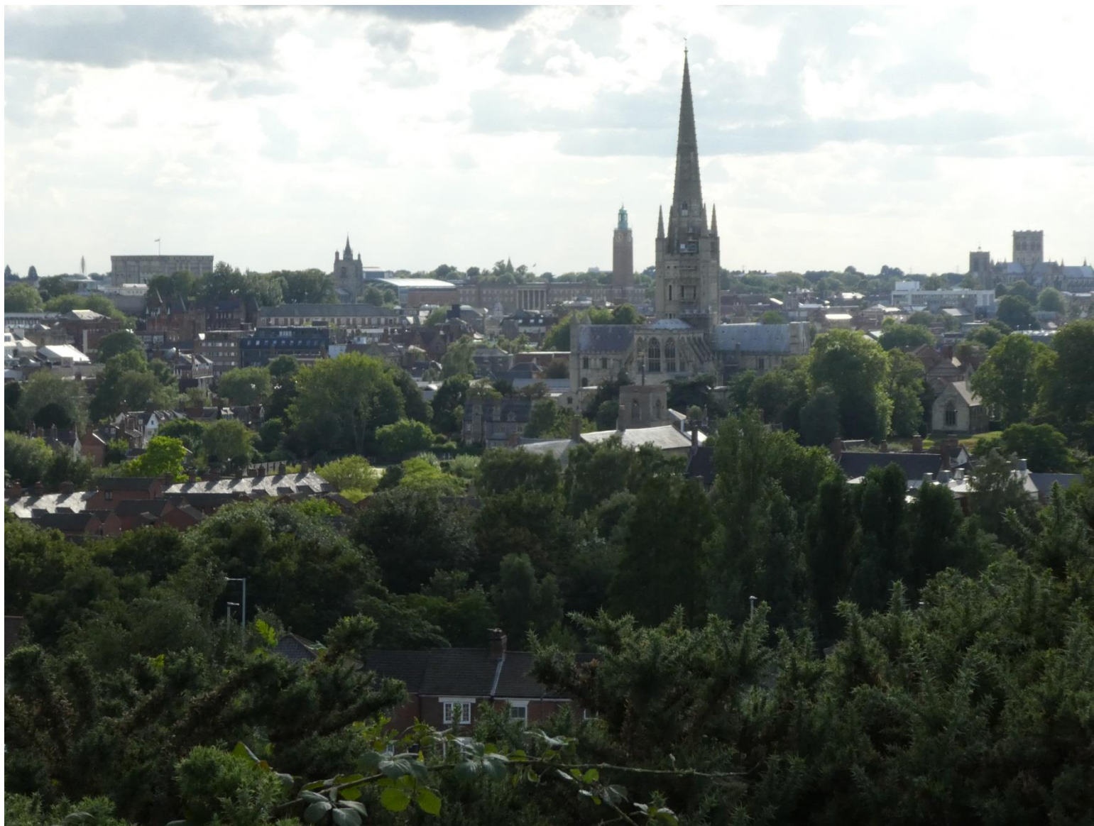
23 – Norwich from St. James' Hill