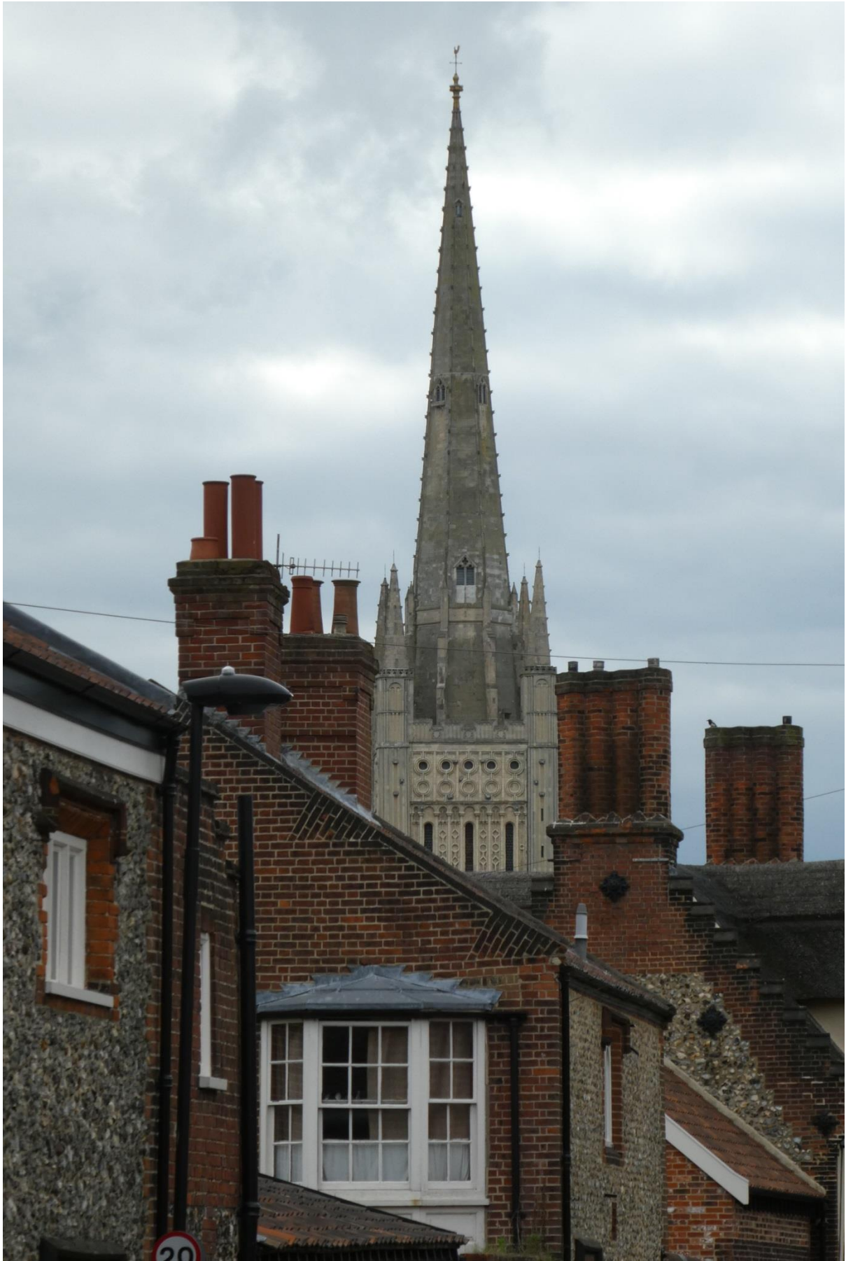
25 – The cathedral tower and spire from Bishopgate