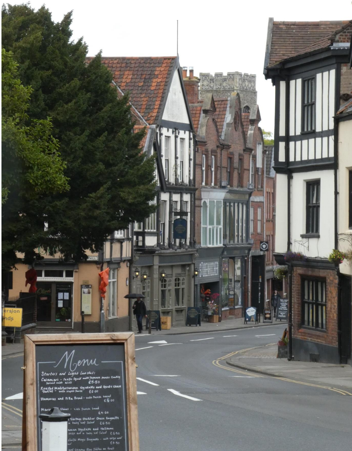
05 – Looking north along Wensum Street