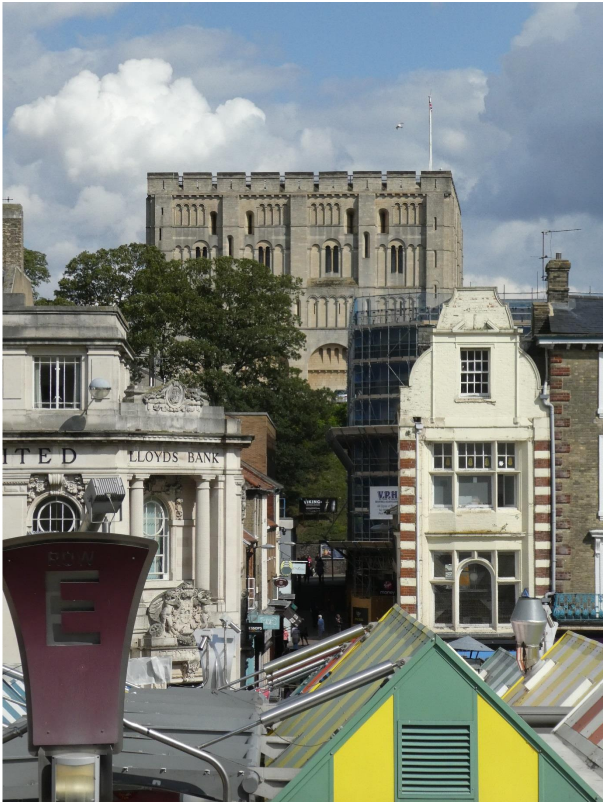
02 – Norwich Castle, seen from the Market Place