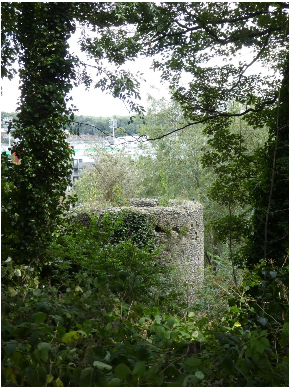
03 – The City Walls – a tower on Carrow Hill