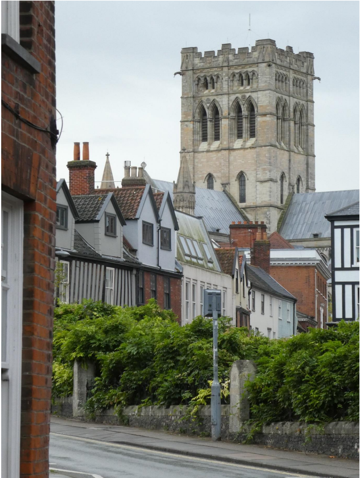
12 – The cathedral church of St. John the Baptist seen from St. Giles Street