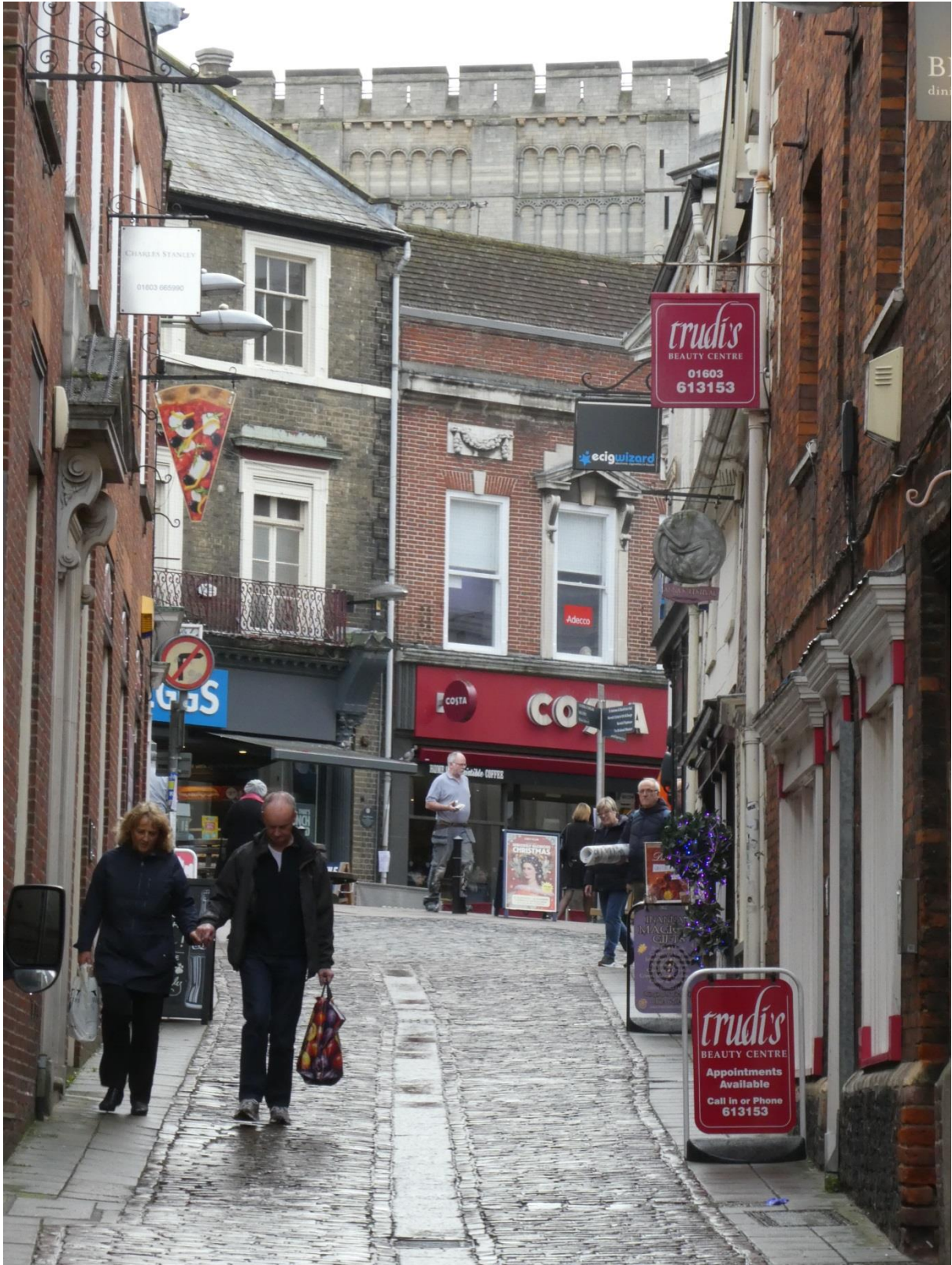
21 – A glimpse of Norwich Castle