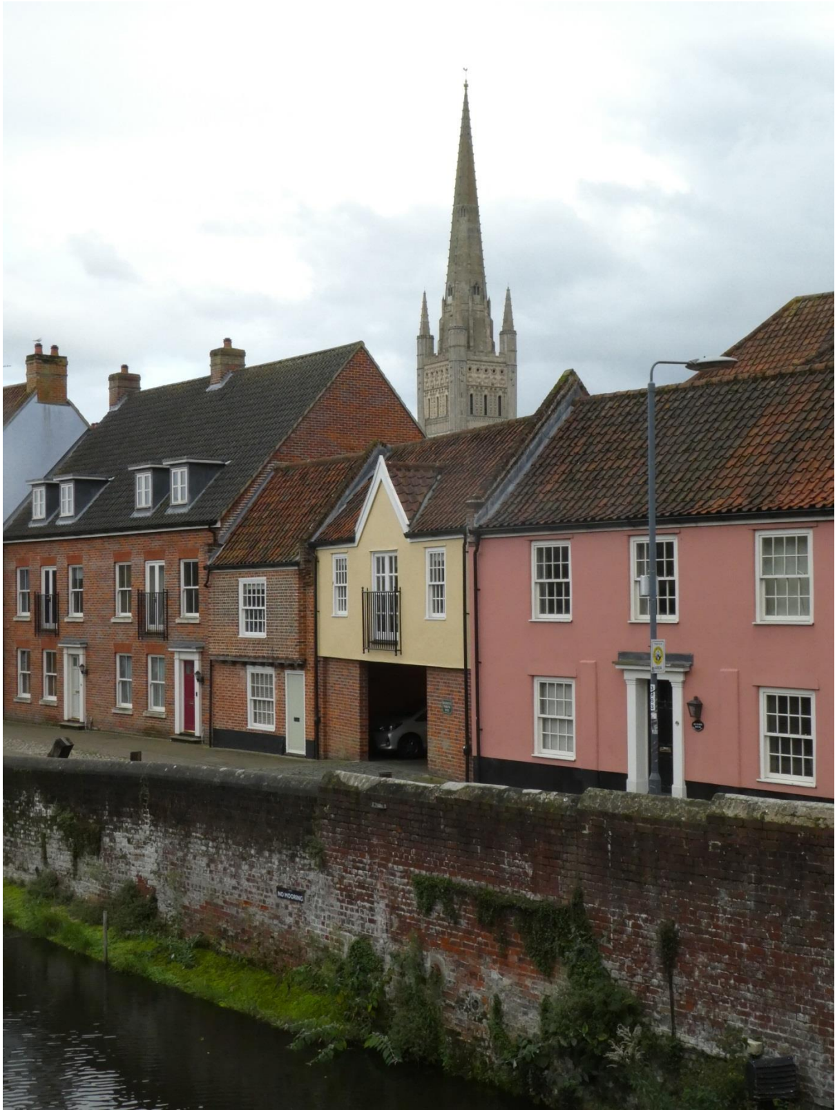
07 – Looking south-east from Fye Bridge