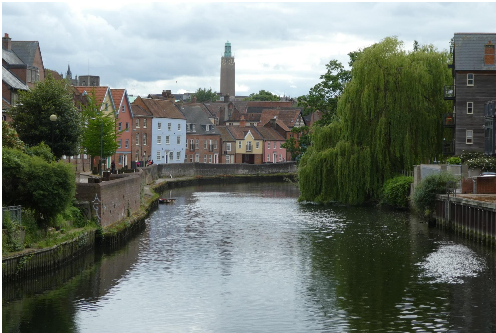
24 – From Whitefriars Bridge – the clock tower of City Hall and three church towers