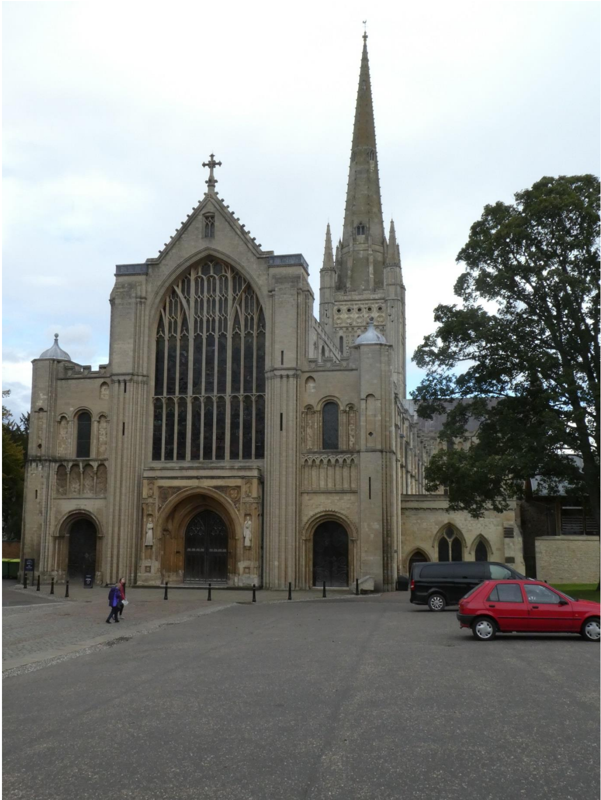
01 – The Cathedral of the Holy & Undivided Trinity