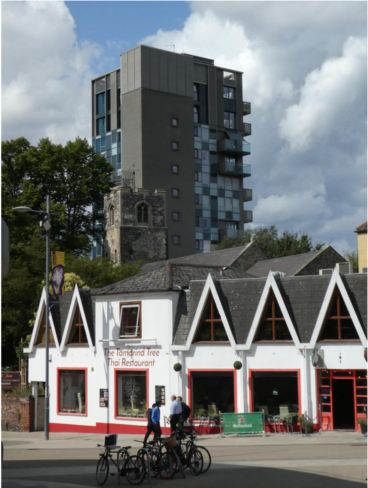
17 – All Saints Church and Westlegate Tower