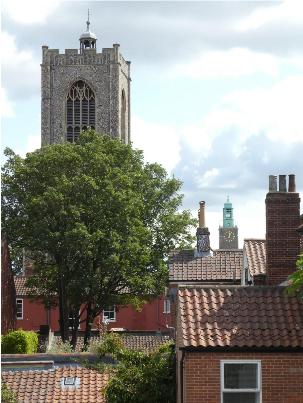
13 – The tower of St. Giles Church and the clock tower of City Hall seen from the footbridge over Grapes Hill