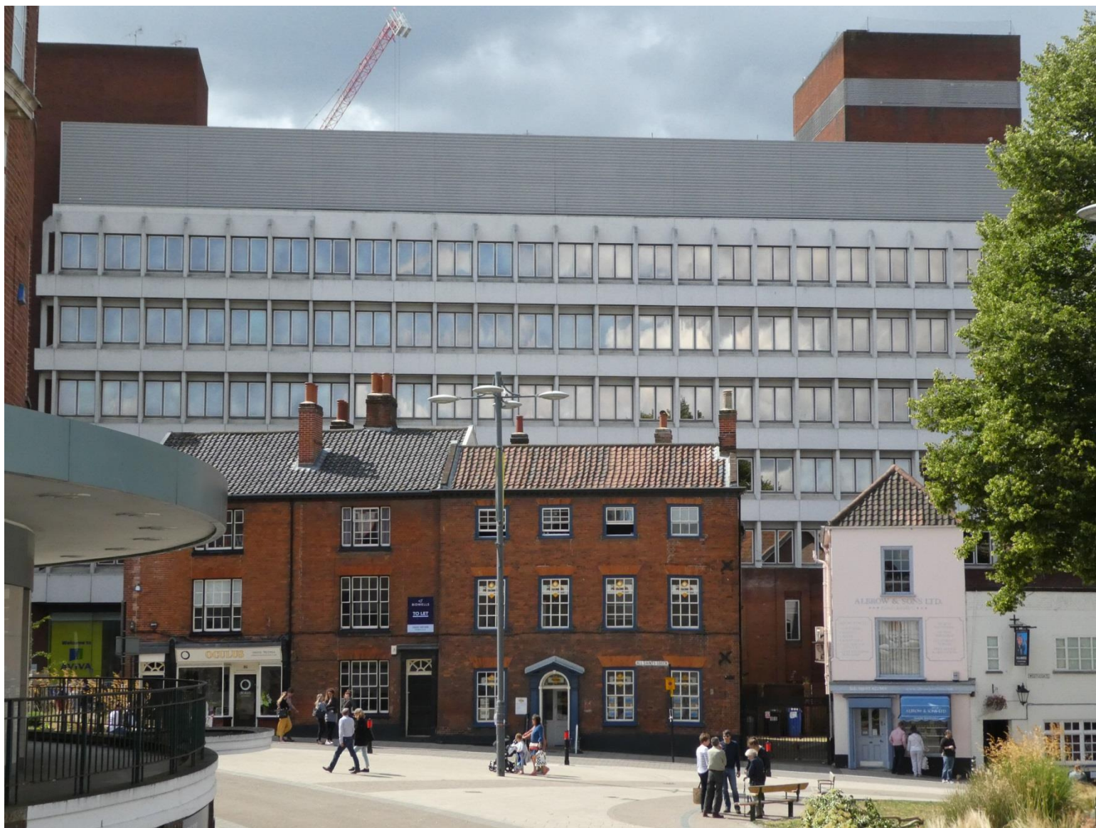
16 – On All Saints Green