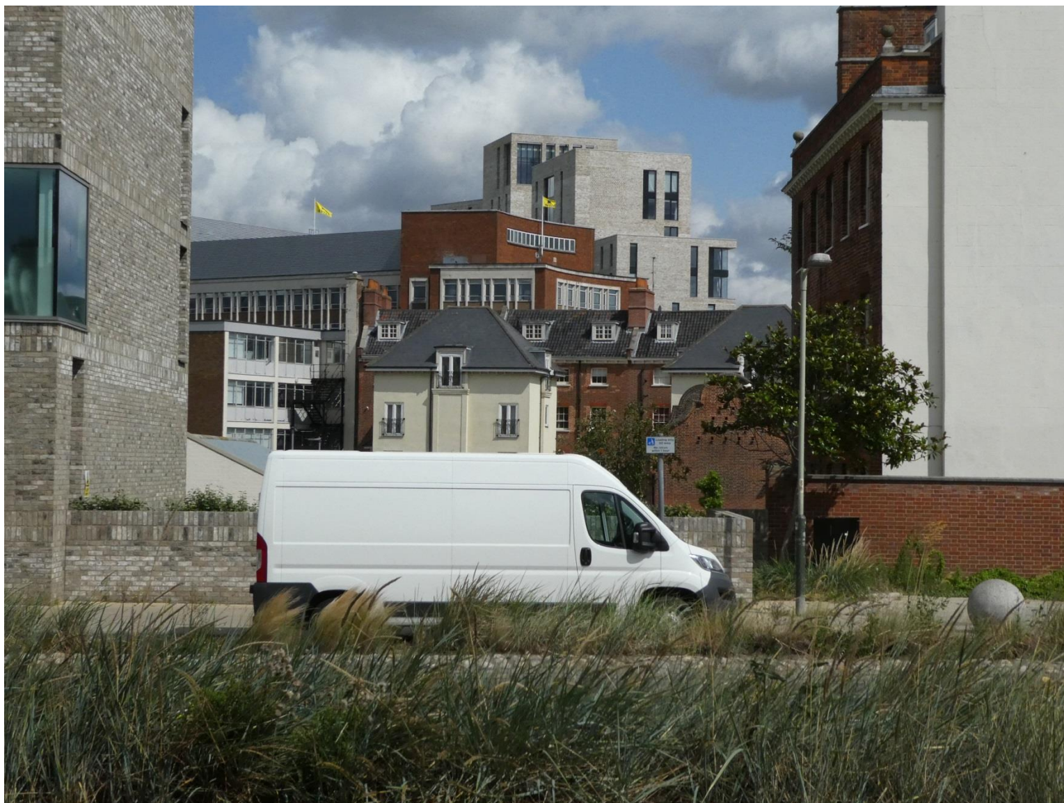
15 – A view from Queen's Road to modern development between Surrey Street and All Saints Green