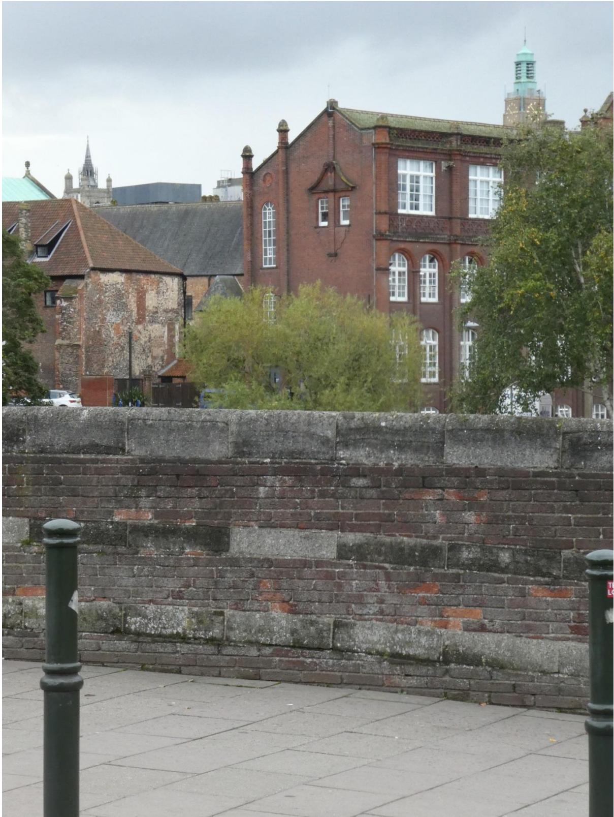
08 – Looking south-east from Fye Bridge – the clock tower of City Hall and the tower of St Peter Mancroft