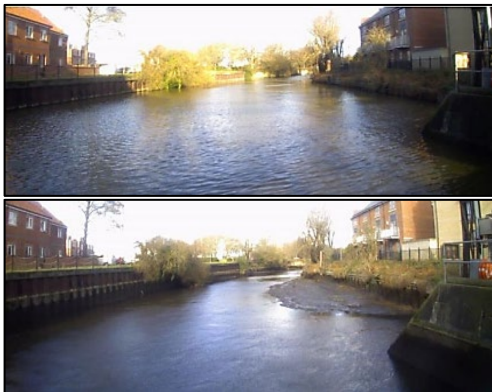
Figure 7: Photographs showing the effects of the New Mills draw down on water level before (top) and after with the exposed silt banks (bottom).