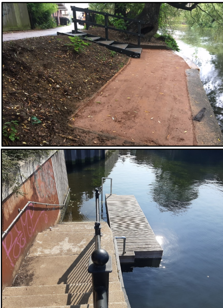
Figure 2: The completed canoe portages upstream (top) and downstream (bottom) of New Mills.

installation. The alterations to the installation have now been completed in full. Rangers will monitor the usage of the platforms but early indications are positive.