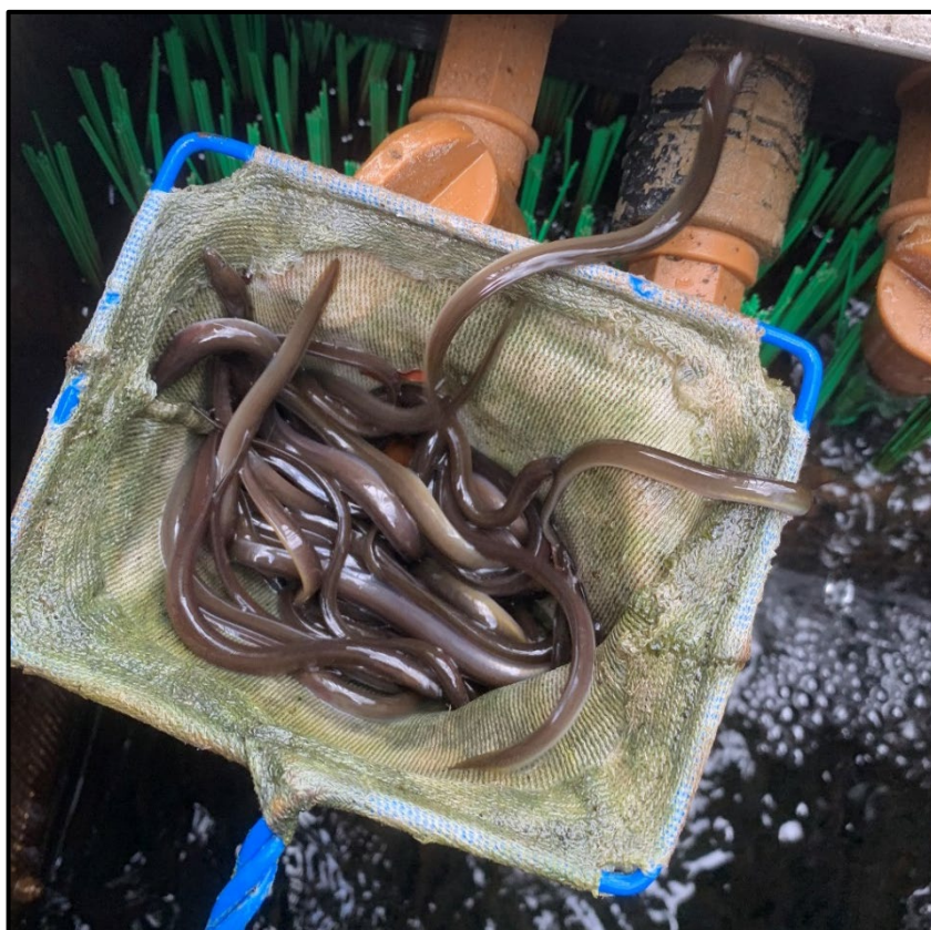
Figure 4: Photograph taken of eels during counting.