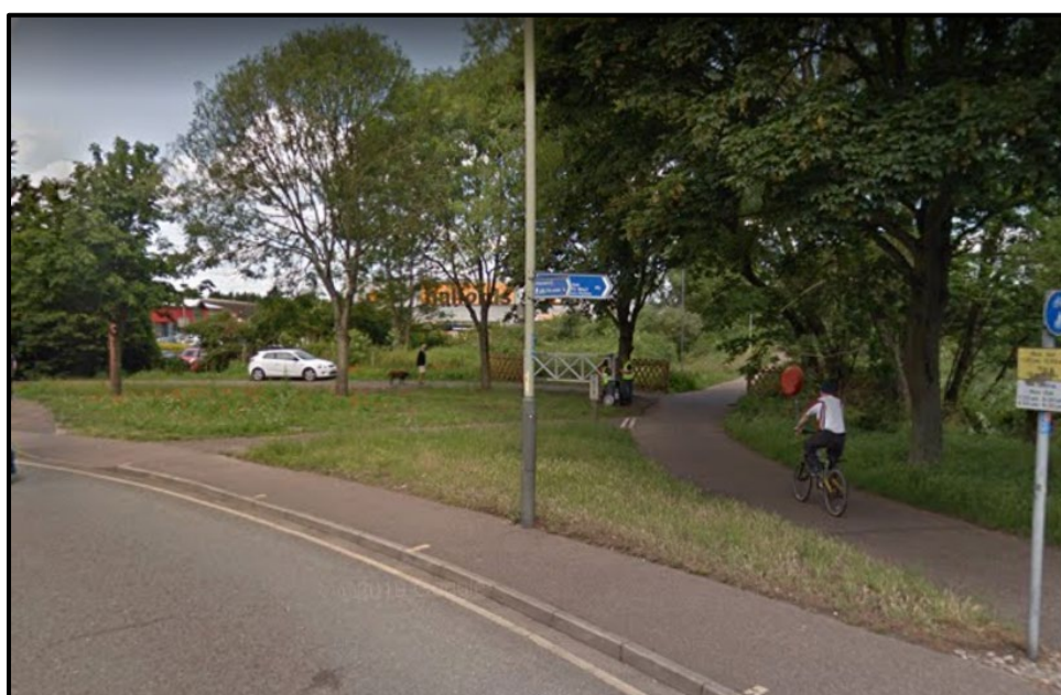
Figure 1: The completed project A3 Barn Road Gateway improvements.