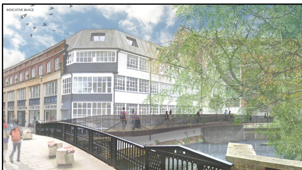
Figure 6: Indicative image of the proposed Missing Link project between Duke Street and St George’s Street bridges.