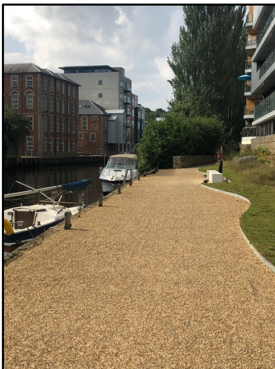
Figure 5: Moorings installed as part of the NR1 housing development opposite Carrow Works.