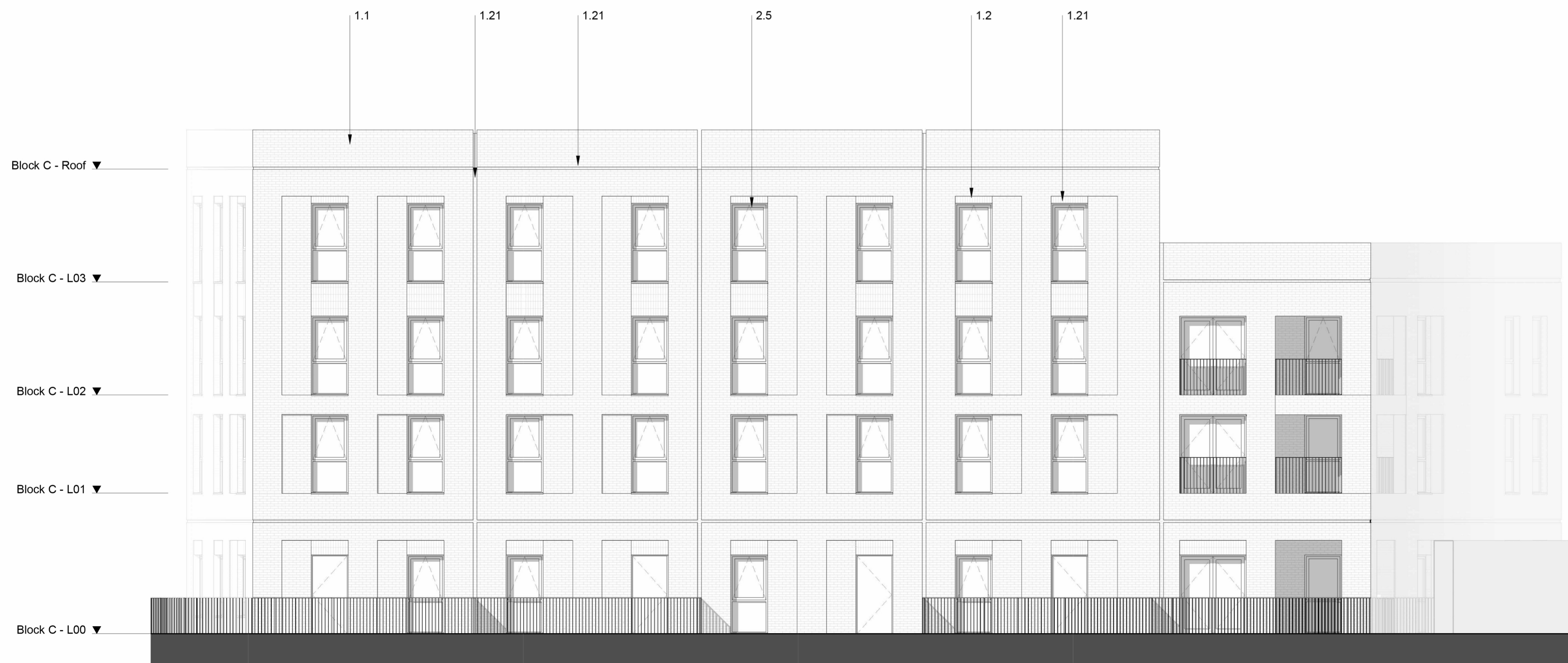
2 C - 05 - East Elevation Scale 1 : 100