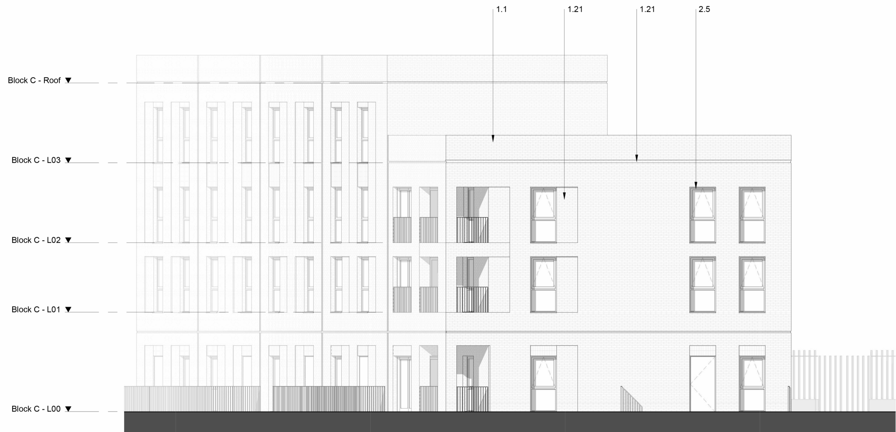
1 C - 05 - North Elevation Scale 1 : 100