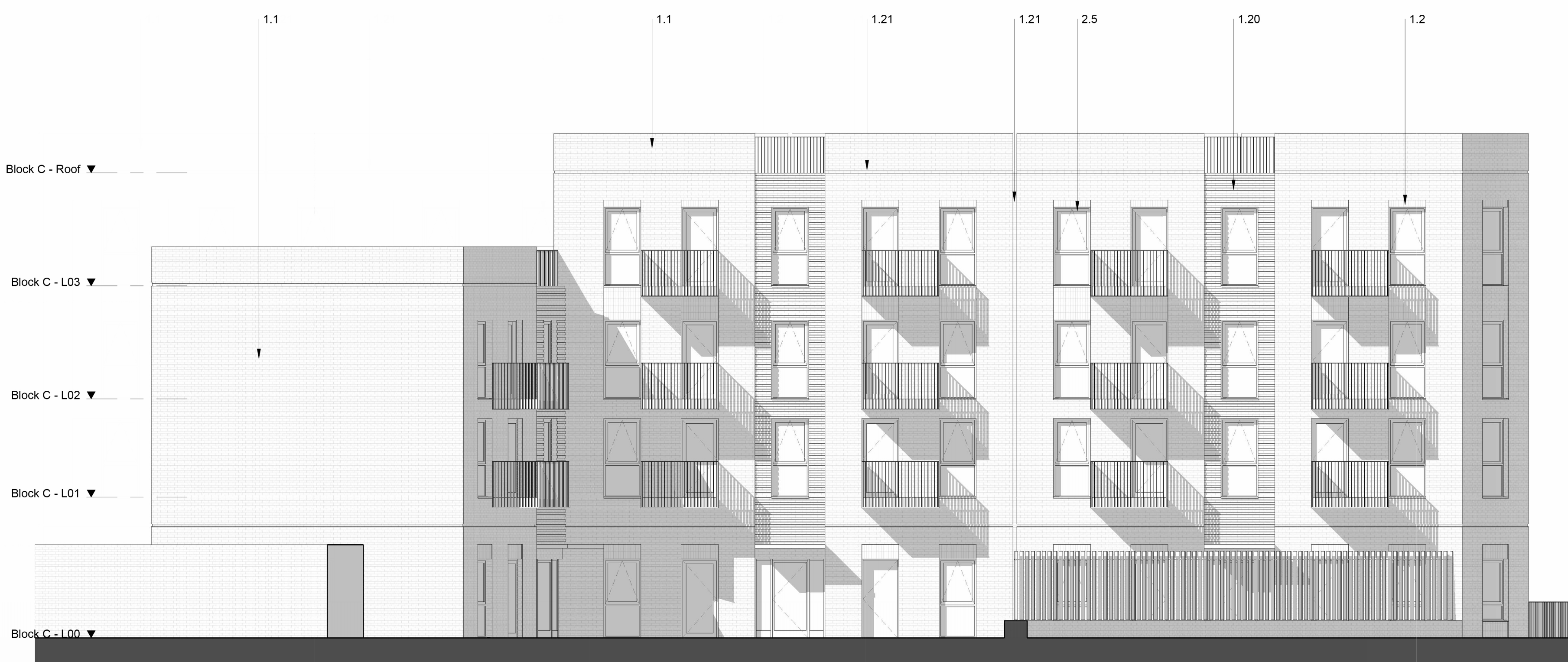
2 C - 05 - West Elevation Scale 1 : 100