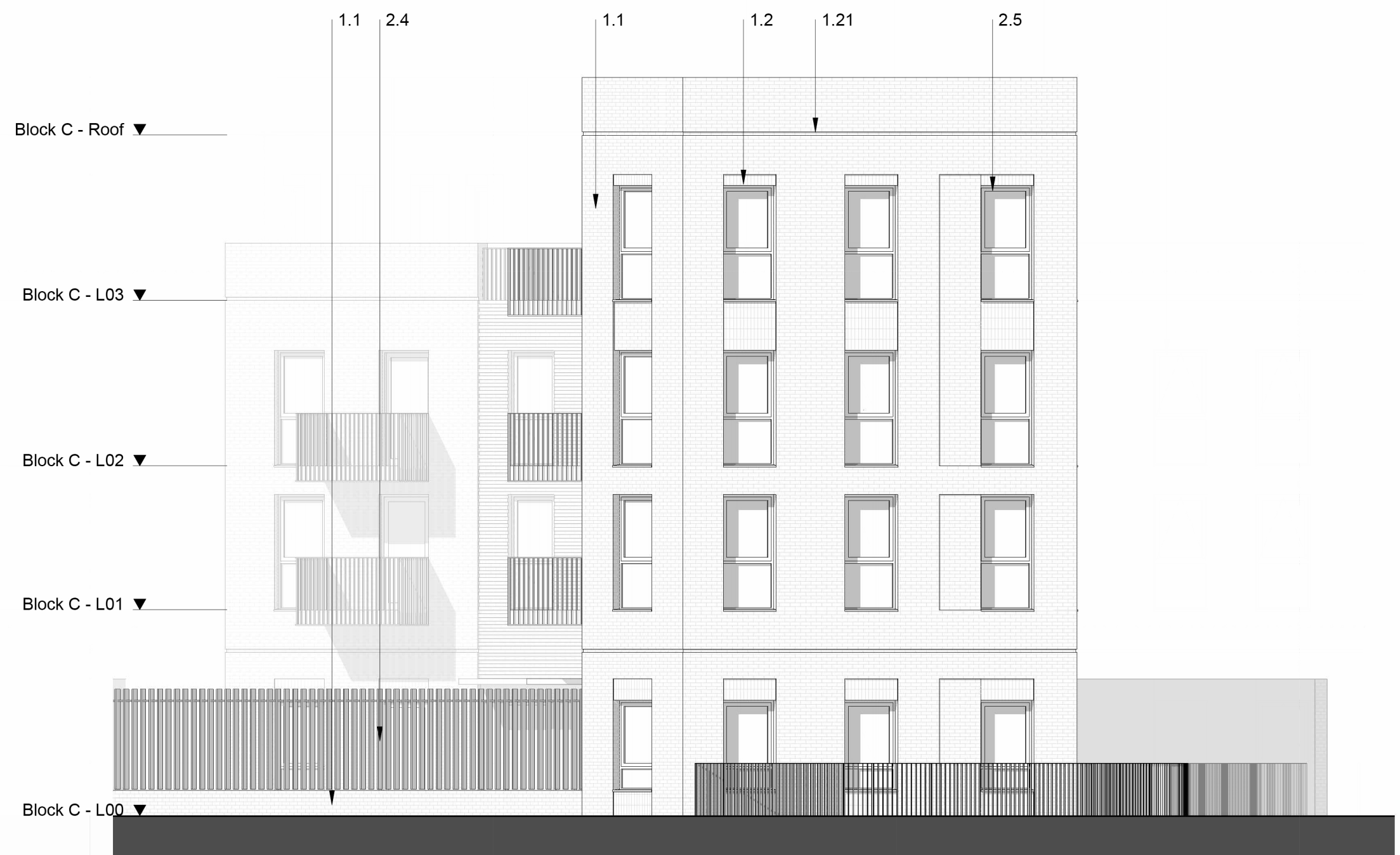
1 C - 05 - South Elevation Scale 1 : 100