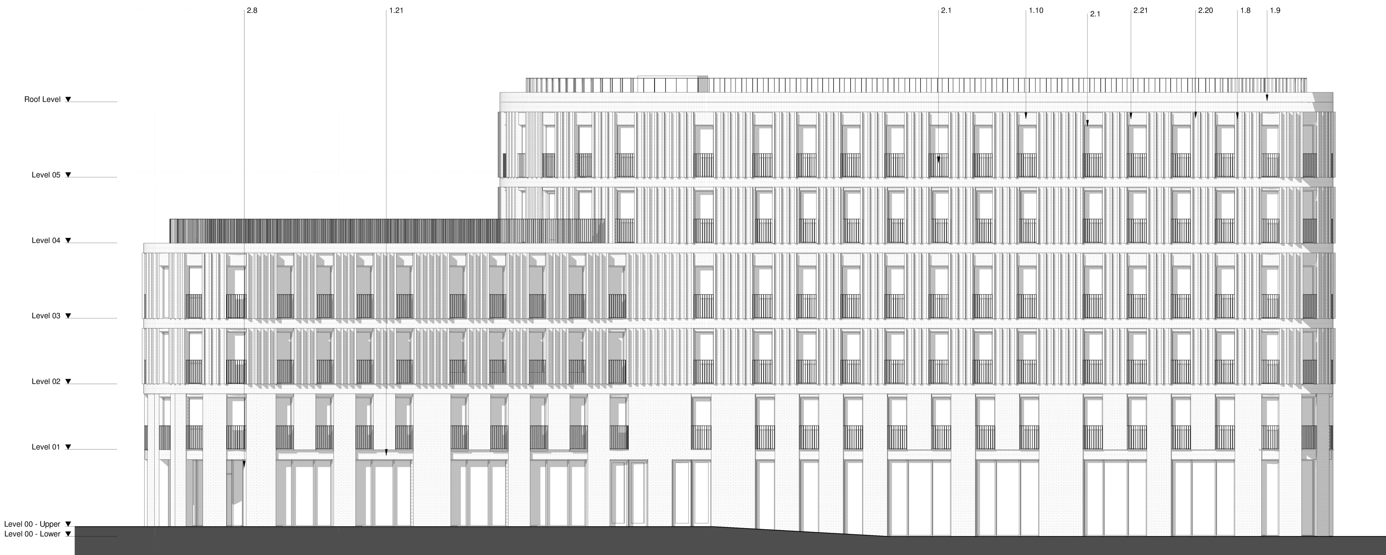
2 D - 05 - West Elevation Scale 1 : 100

Contractors and consultants are not to scale dimensions from this drawing