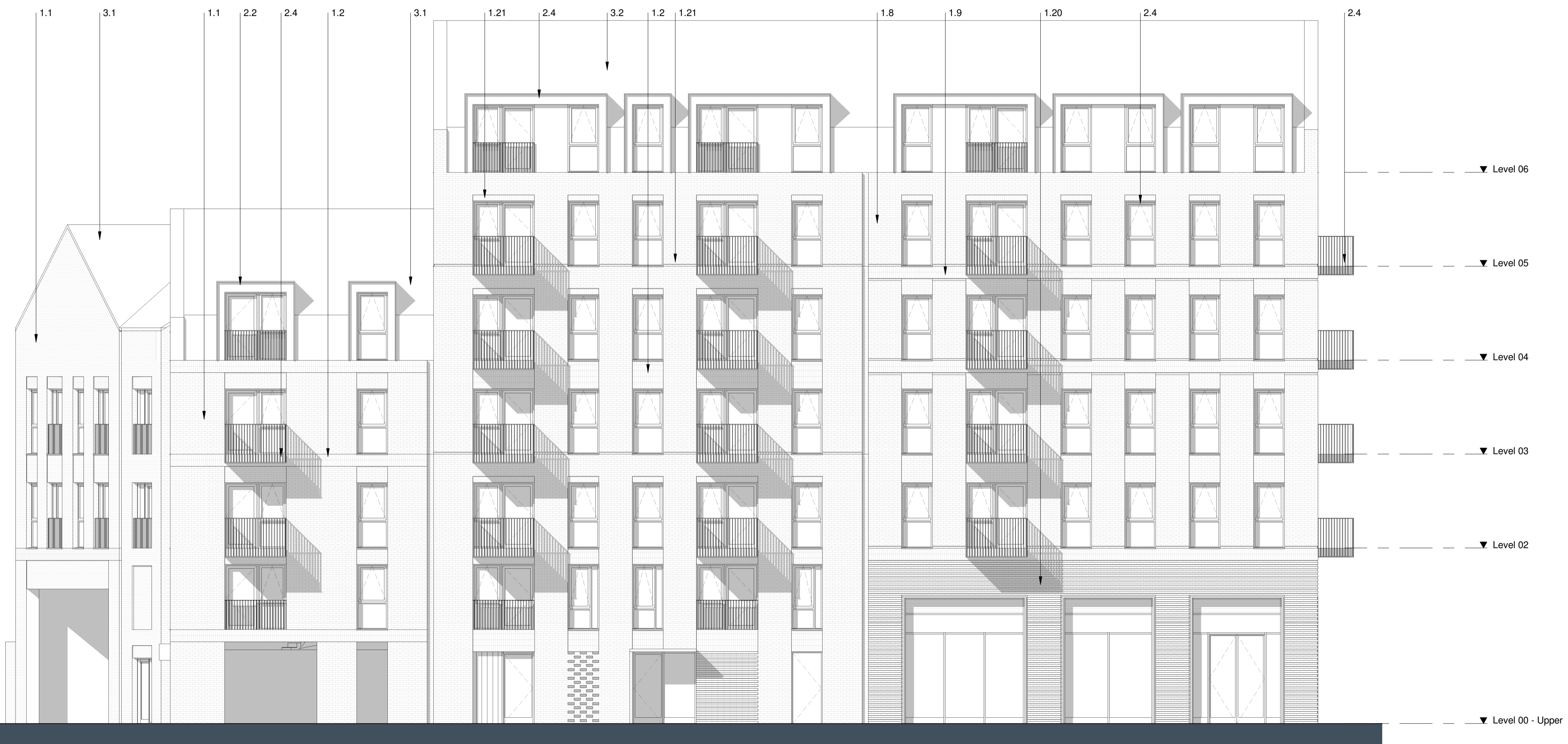
2 M - 05 - West Elevation Scale 1 : 100

Contractors and consultants are not to scale dimensions from this drawing Reproduced by permission of Ordnance Survey on behalf of HMSO © CROWN COPYRIGHT and database right 2008 All rights reserved Ordnance Survey Licence number AL 1000 22432 Broadway Malyan Limited The survey information shown on this drawing is based on a topographical survey prepared by a third party and Broadway Malyan Limited accept no responsibility for the accuracy or completeness of the survey. Drawings to be read in conjunction with the associated Design & Access Statement, associated consultant design team documents & reports and landscape information Landscape shown is for illustrative purposes only. For detailed landscape information, please refer to the landscape information & documents.