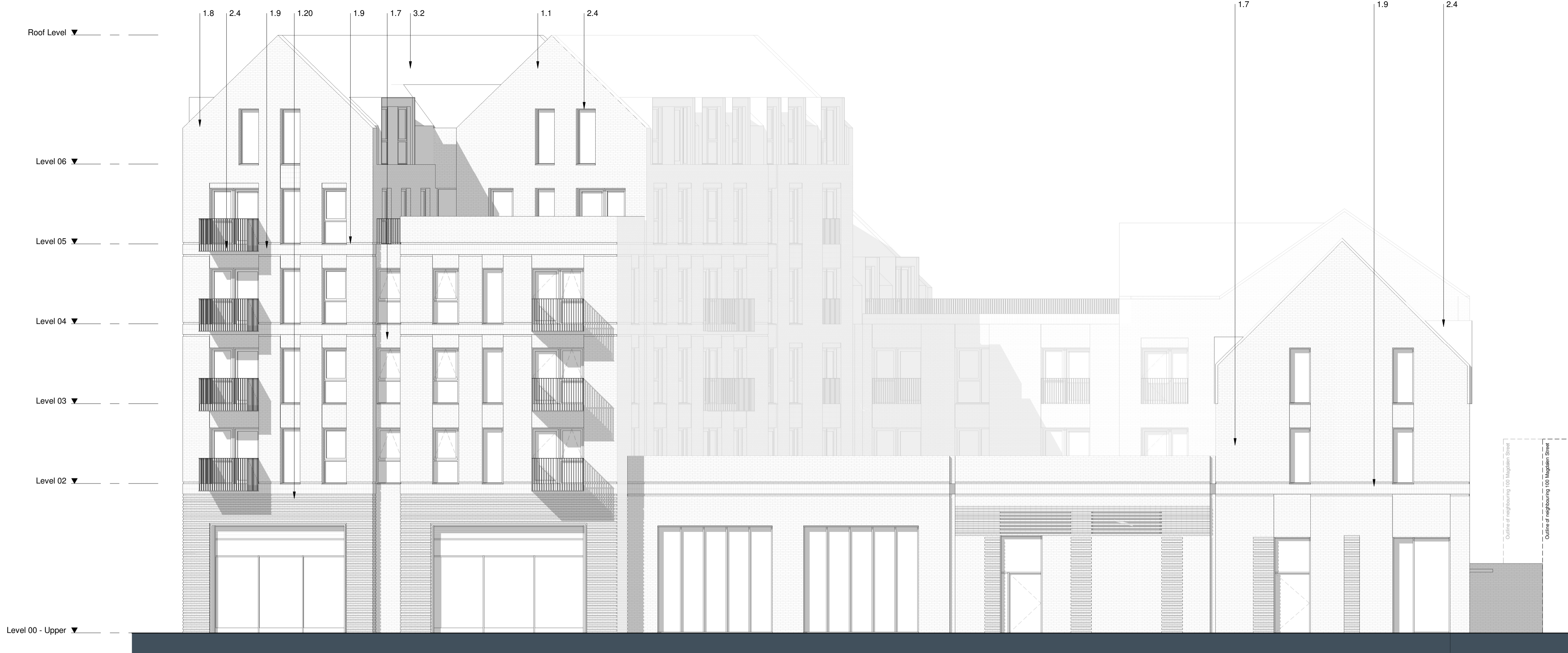
1 M - 05 - South Elevation Scale 1 : 100