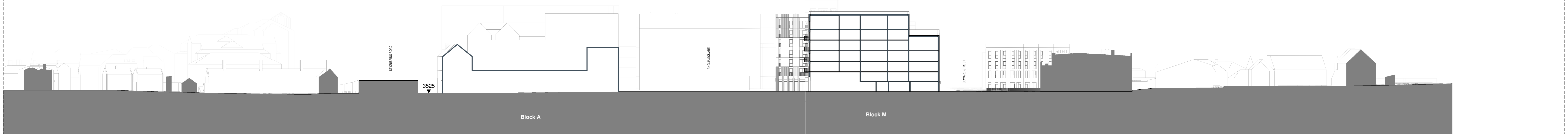
3 Site Section 06 Scale 1 : 500