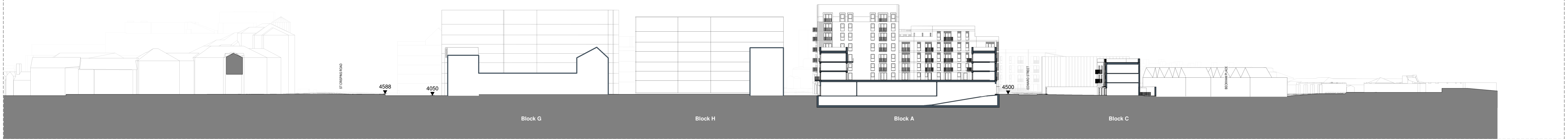
2 Site Section 05 Scale 1 : 500