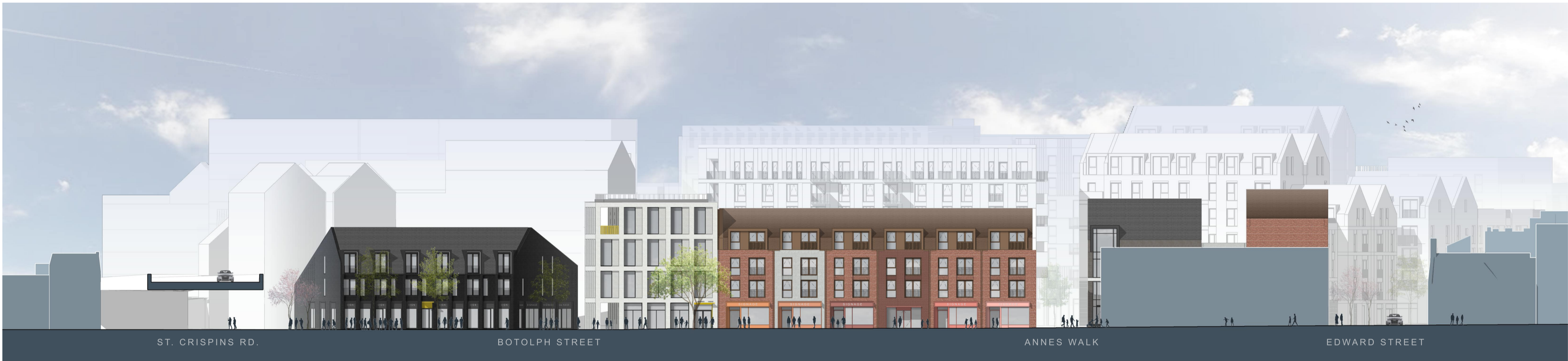
1 Magdalen Street Elevation Scale 1:200