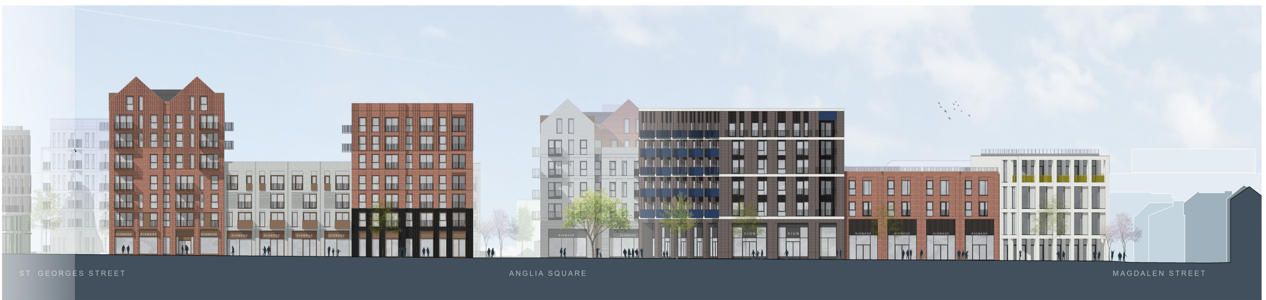
3 Botolph Street - Part 2 Scale 1: 200