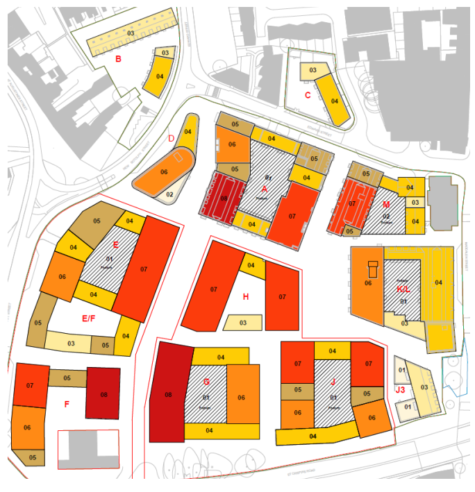
Figure 1: Masterplan of the proposed development

The figure below provides an overview of the masterplan for the site, with the darker blocks being the taller blocks in the development. A larger plan is provided in section 5.