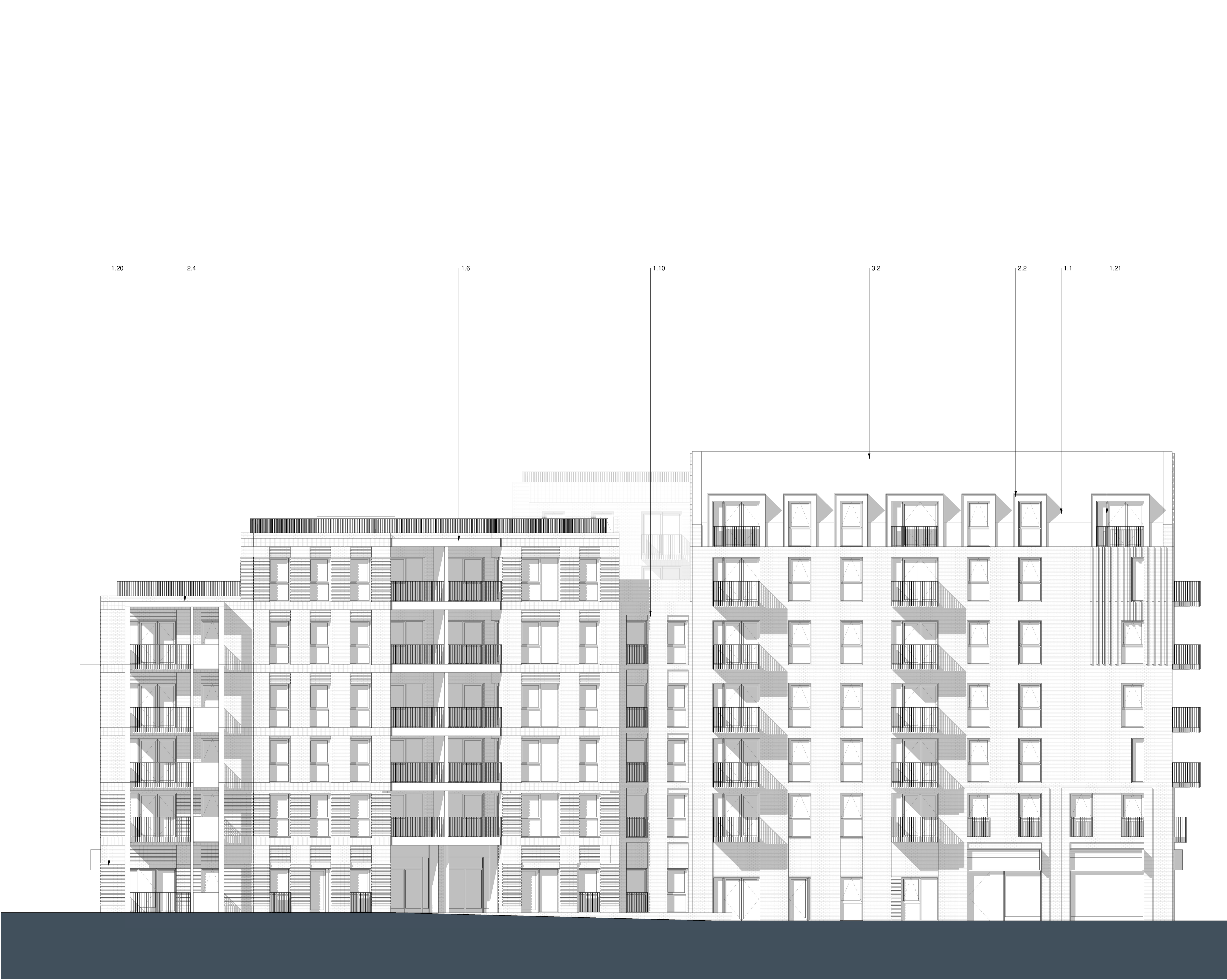
1 A - 05 - West Elevation Scale 1 : 100

Contractors and consultants are not to scale dimensions from this drawing Reproduced by permission of Ordnance Survey on behalf of HMSO © CROWN COPYRIGHT and database right 2008 All rights reserved Ordnance Survey Licence number AL 1000 22432 Broadway Malyan Limited The survey information shown on this drawing is based on a topographical survey prepared by a third party and Broadway Malyan Limited accept no responsibility for the accuracy or completeness of the survey. Drawings to be read in conjunction with the associated Design & Access Statement, associated consultant desin team documents & reports and landscape information Landscape shown is for illustrative purposes only. For detailed landscape information, please refer to the landscape information & documents. 0m 5m 10m