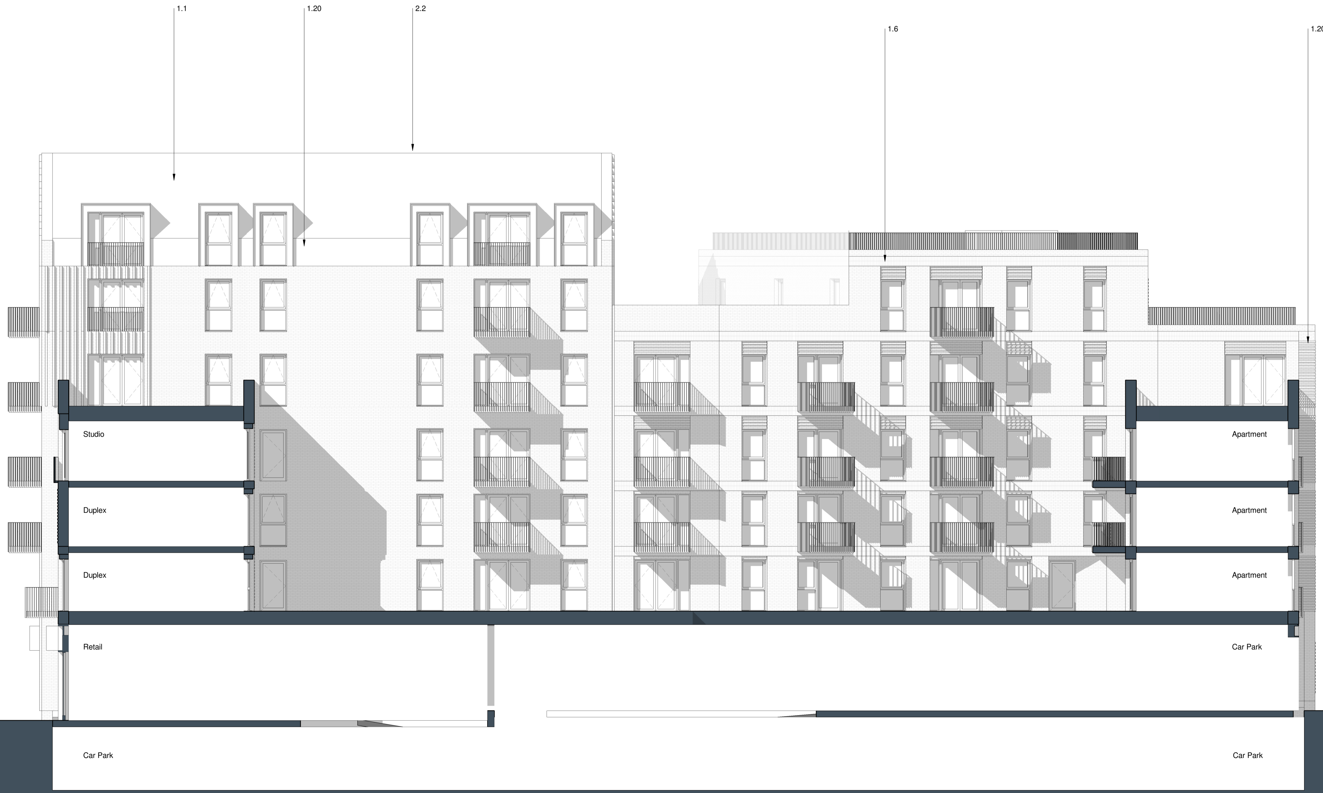
1 A1 - 05 - East Elevation Internal Scale 1 : 100

Original size 100mm @ A1 Copyright Broadway Malyan Limited