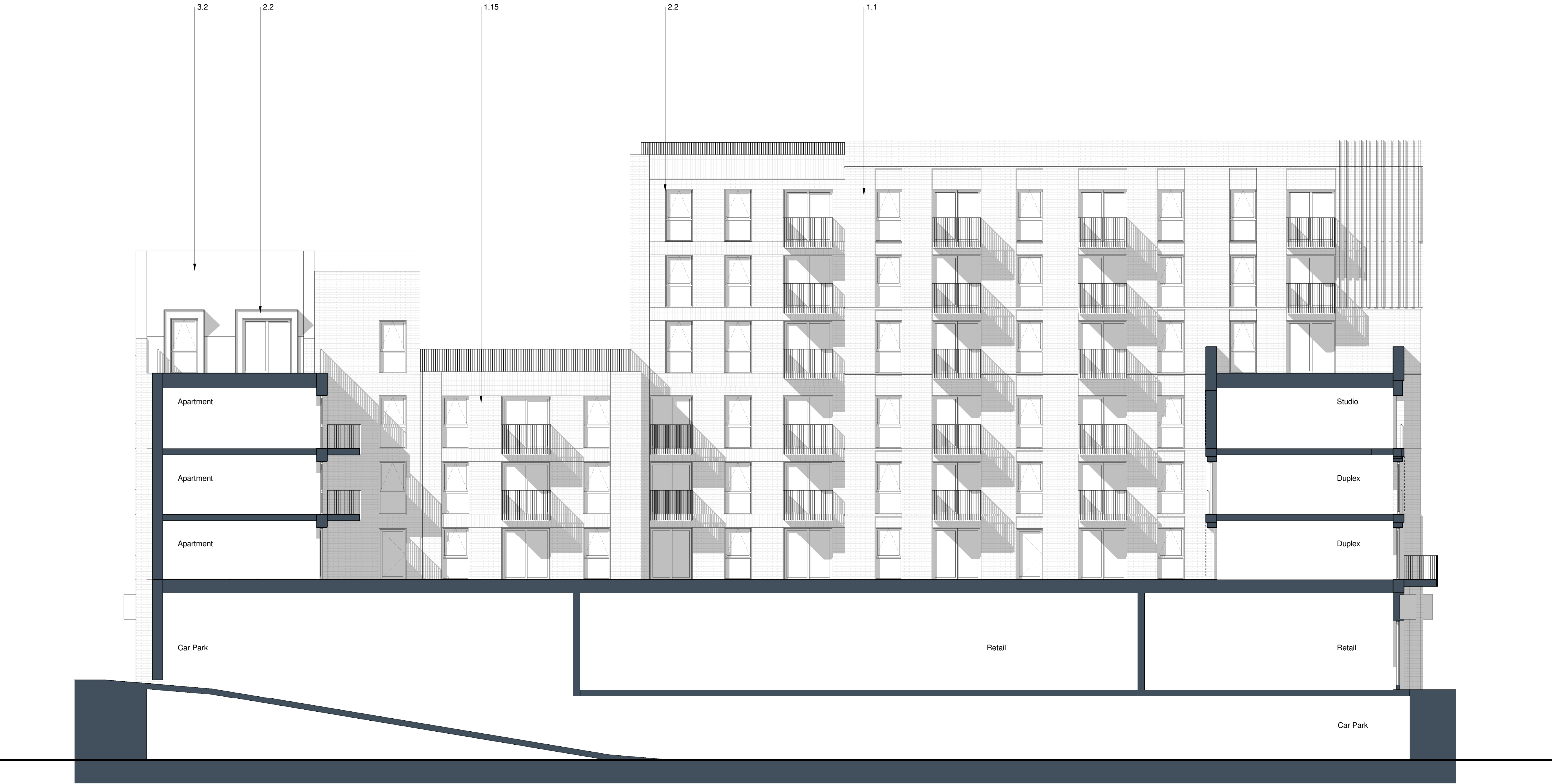
1 A2 - 05 - West Elevation Internal Scale 1 : 100