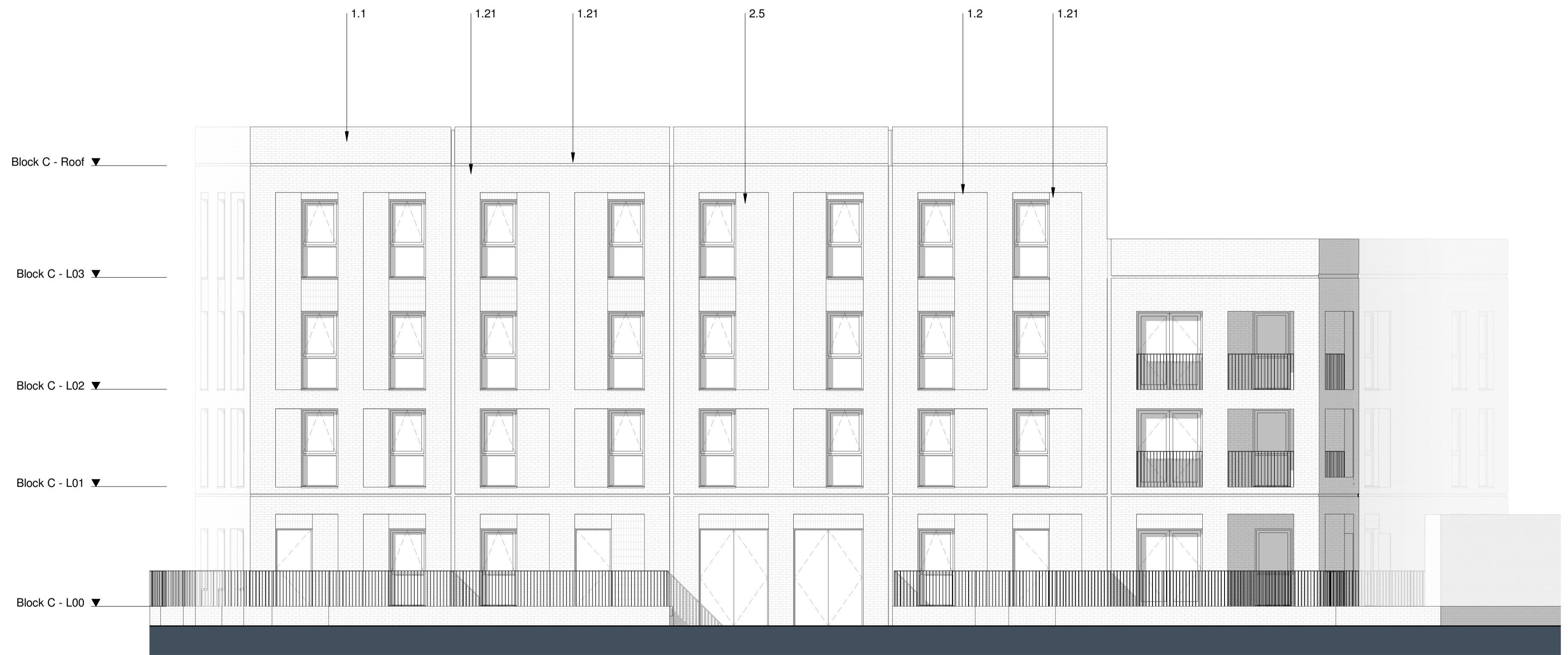
2 C - 05 - East Elevation Scale 1 : 100