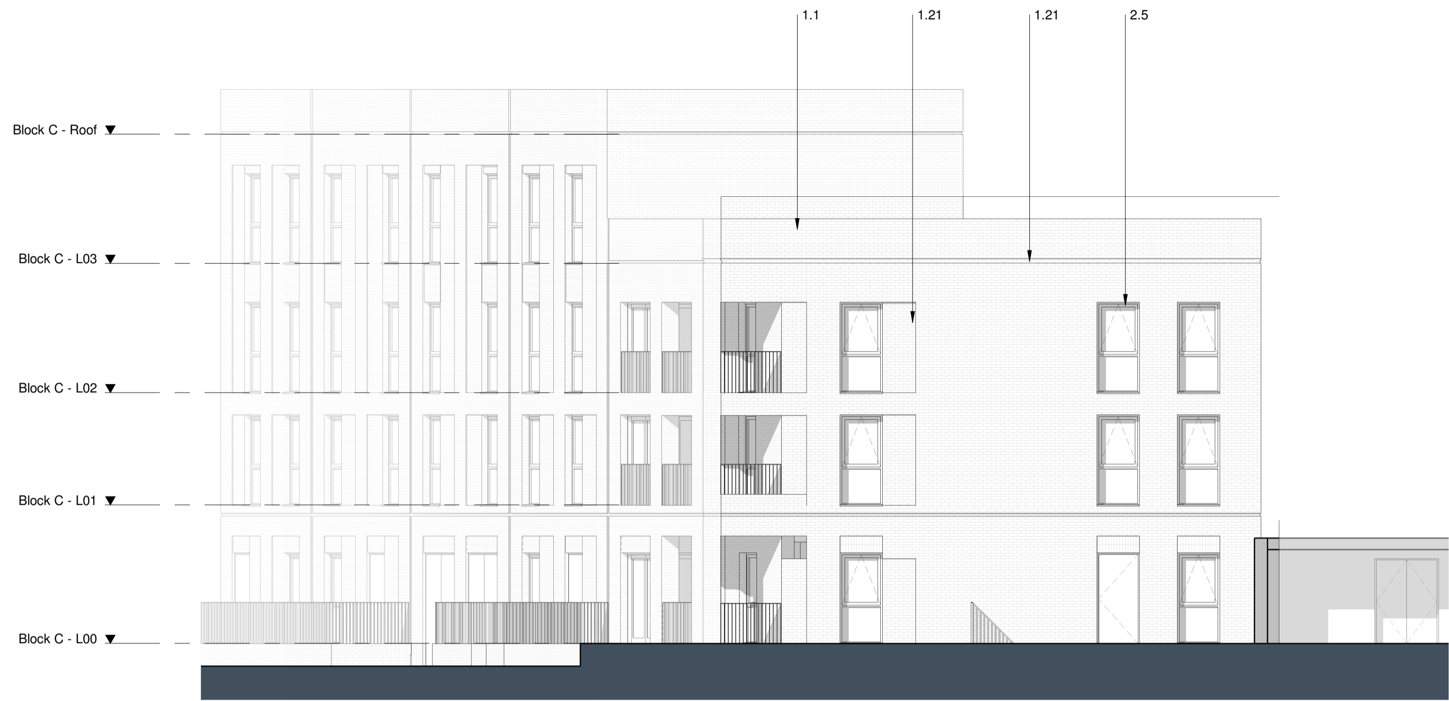
1 C - 05 - North Elevation Scale 1 : 100