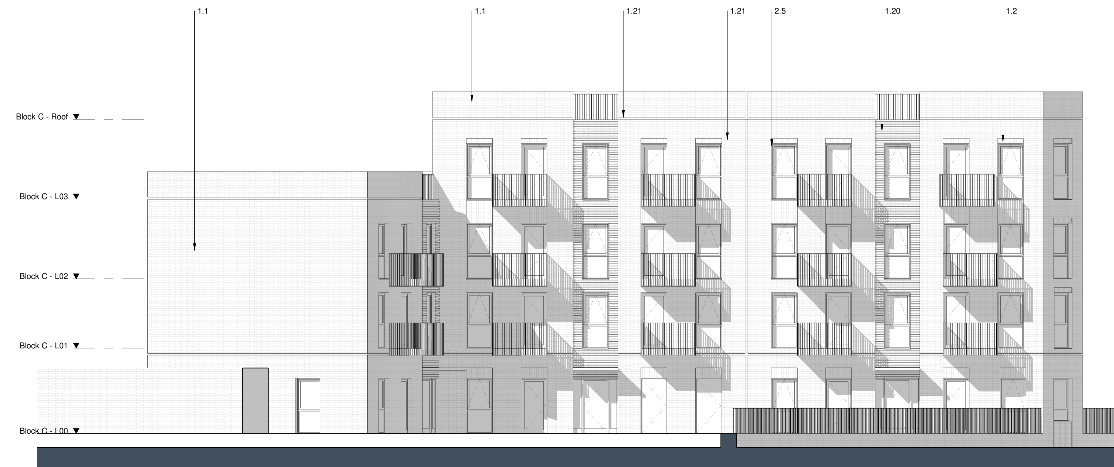
2 C - 05 - West Elevation Scale 1 : 100