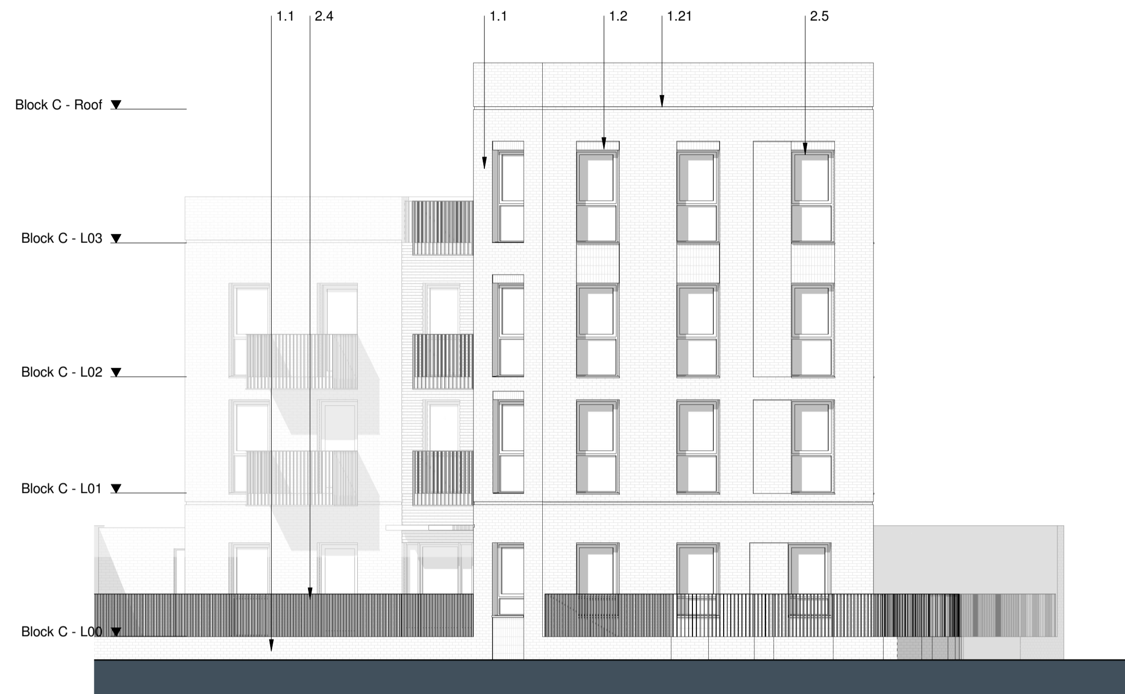
1 C - 05 - South Elevation Scale 1 : 100