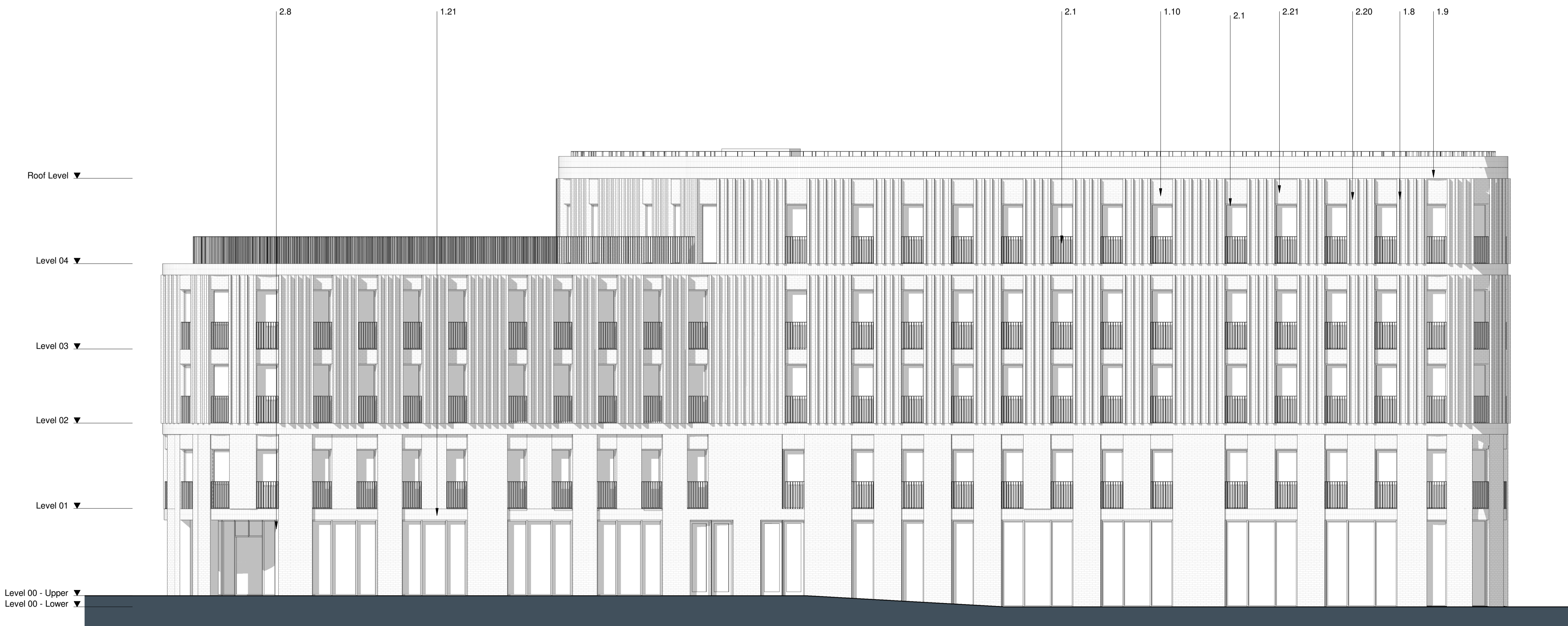
2 D - 05 - West Elevation Scale 1 : 100

Contractors and consultants are not to scale dimensions from this drawing