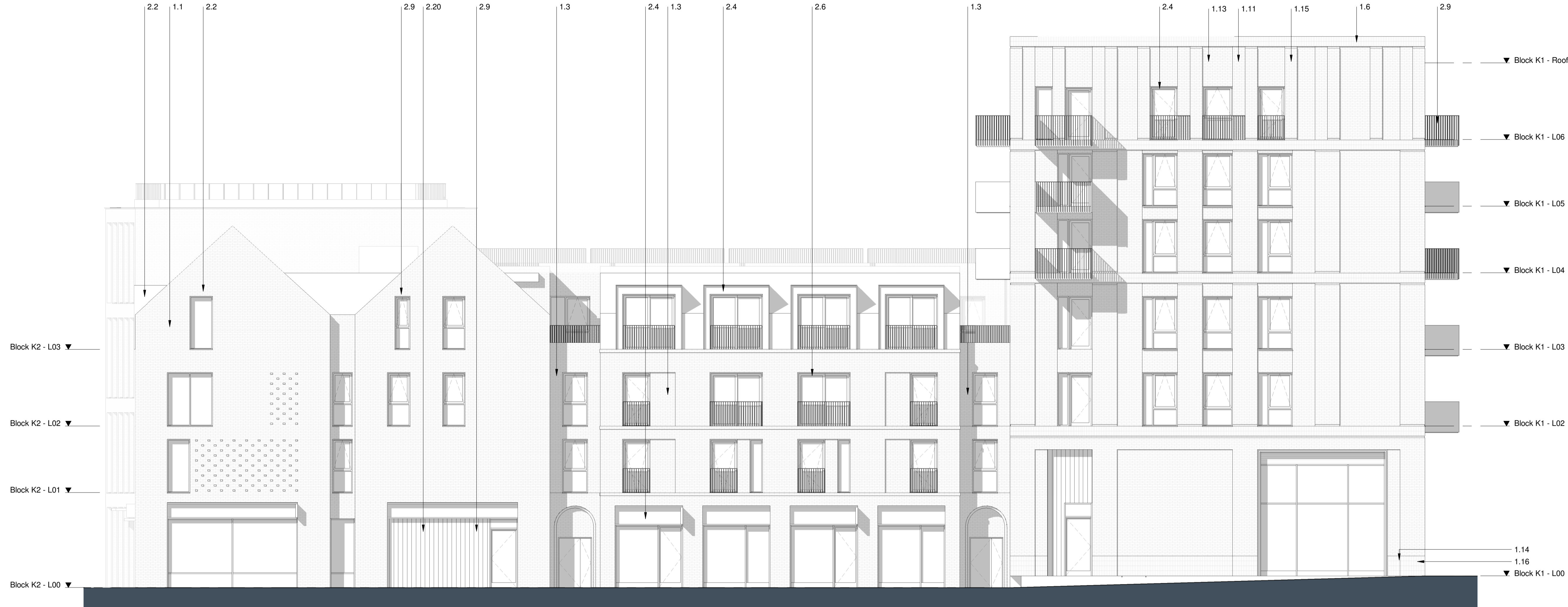
1 K - 05 - North Elevation Scale 1 : 100