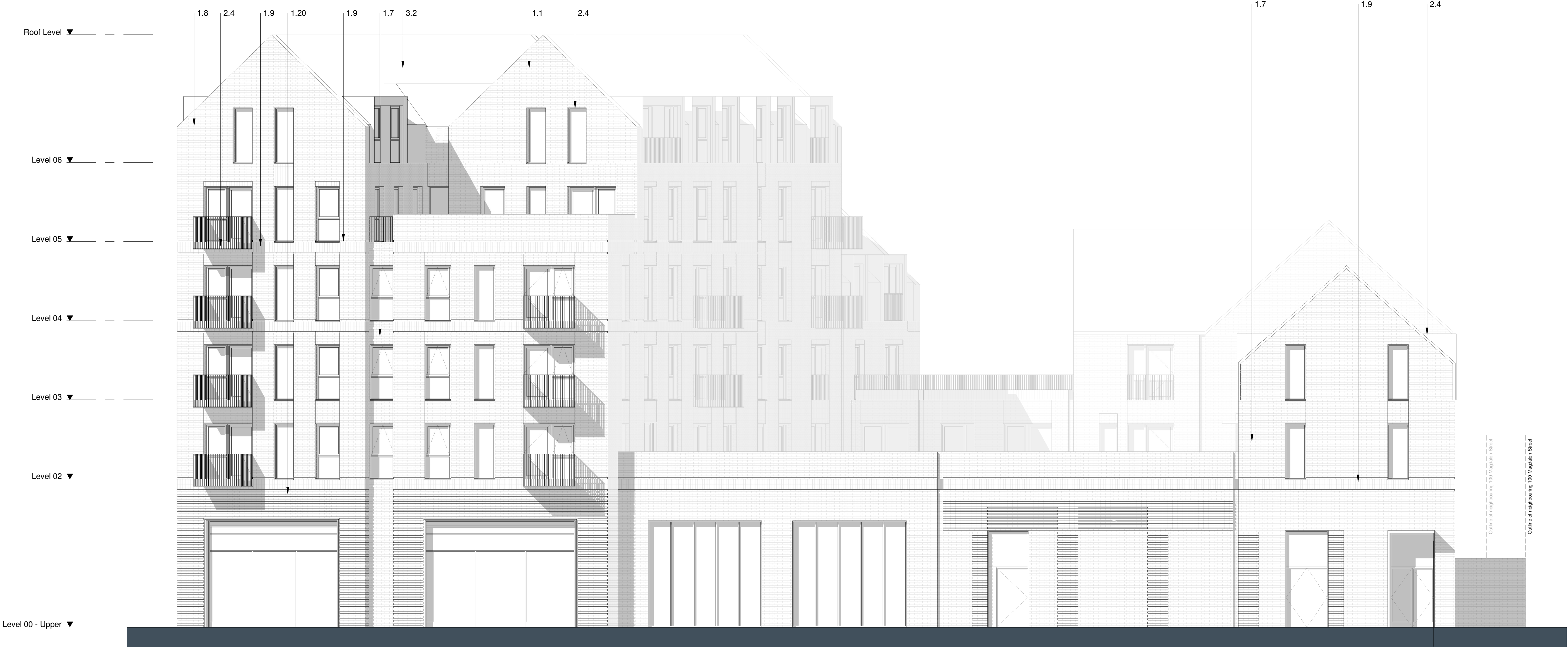
1 M - 05 - South Elevation Scale 1 : 100