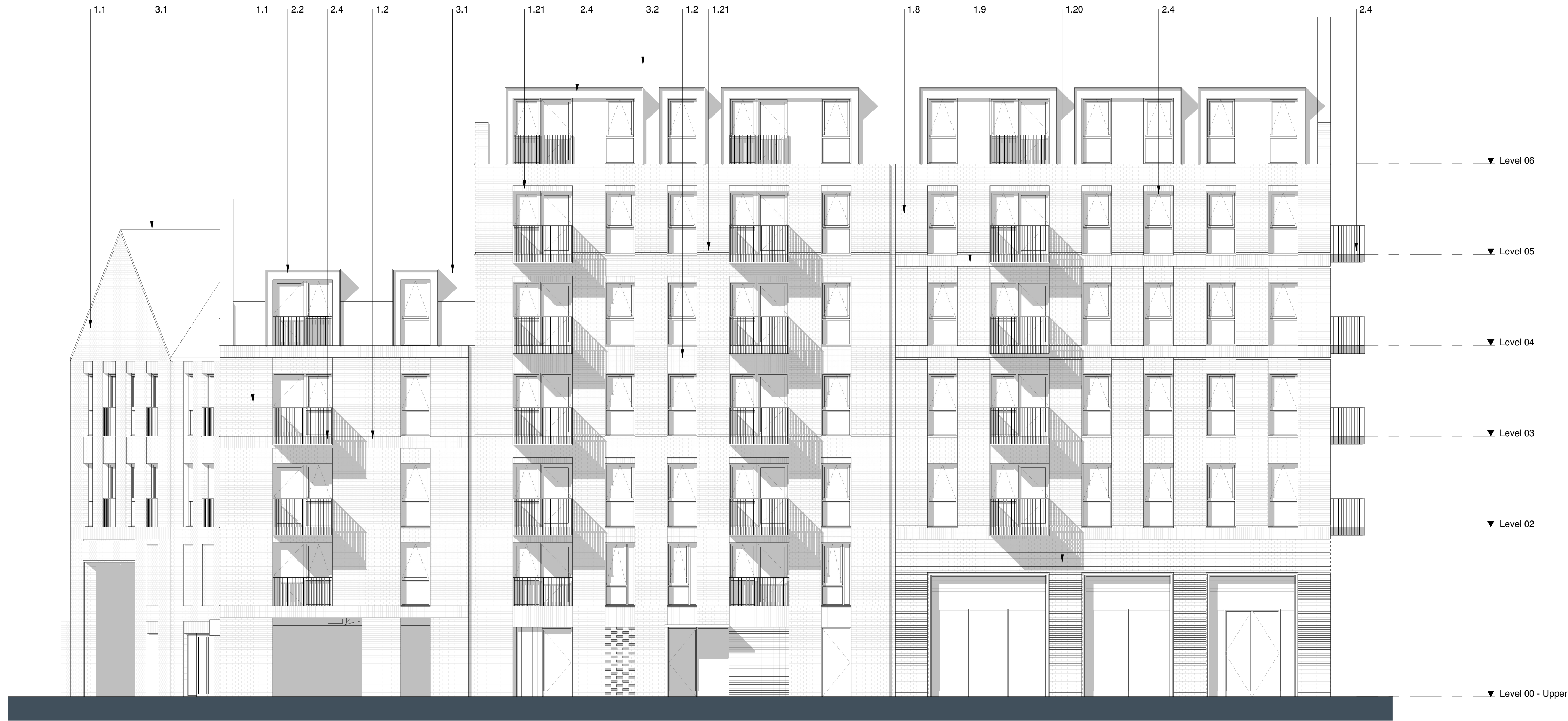
2 M - 05 - West Elevation Scale 1 : 100