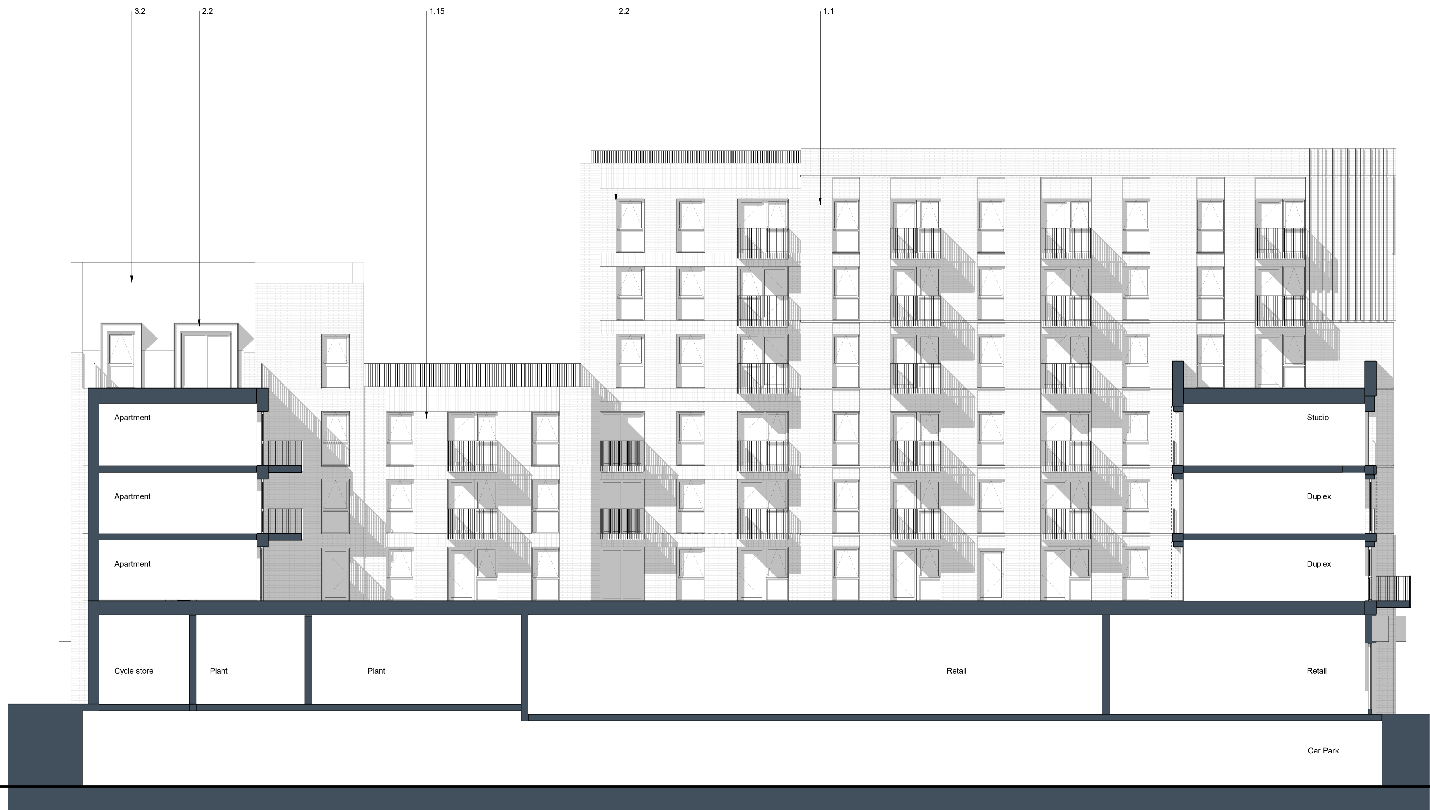
1 A2 - 05 - West Elevation Internal Scale 1 : 100

Original size 100mm @ A1 Copyright Broadway Malyan Limited