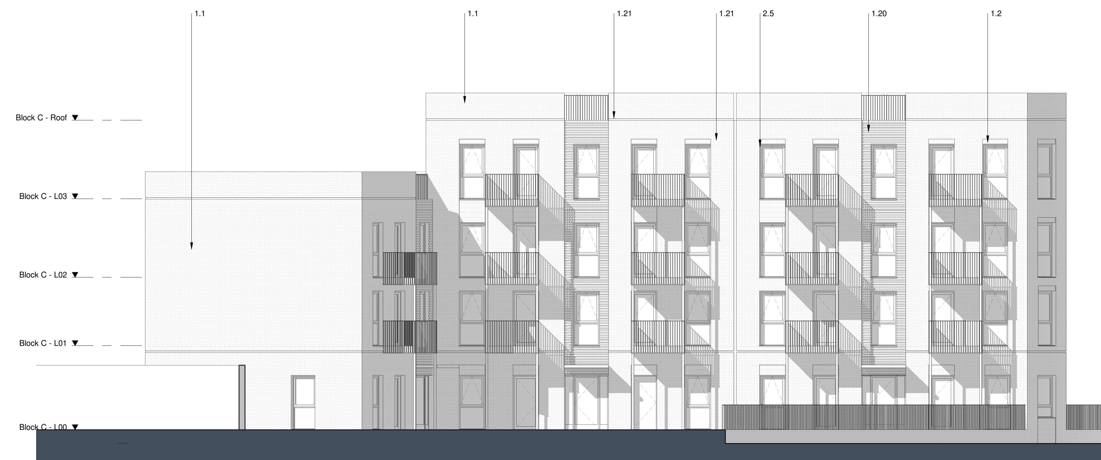
2 C - 05 - West Elevation Scale 1 : 100

Status For Planning Scale 1:100@A1 Drawn By OR Date 20.01.23 Job Number 35301 Drawing Number ZC-XX-DR-A-05-0301 Revision D0-4