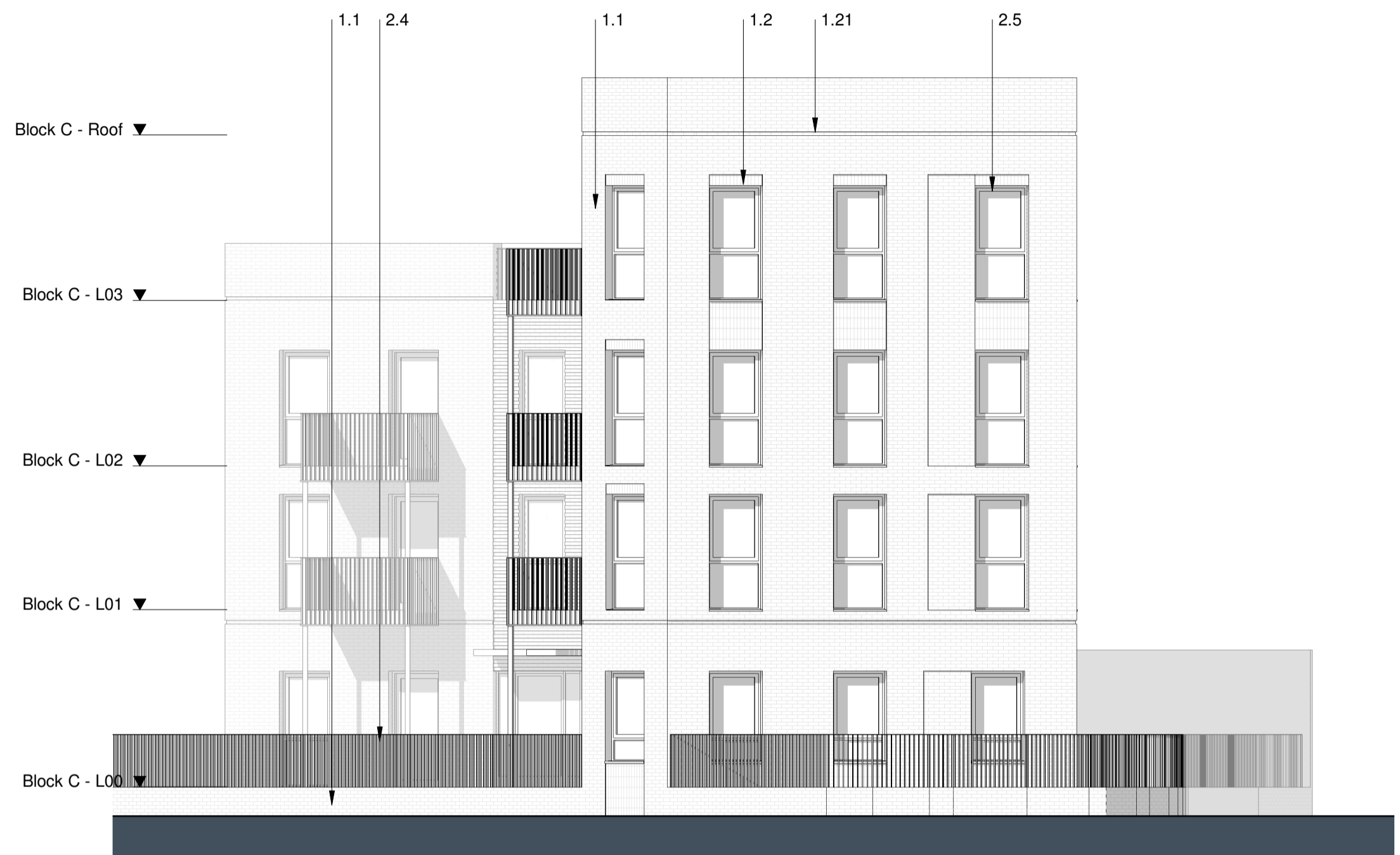
1 C - 05 - South Elevation Scale 1 : 100