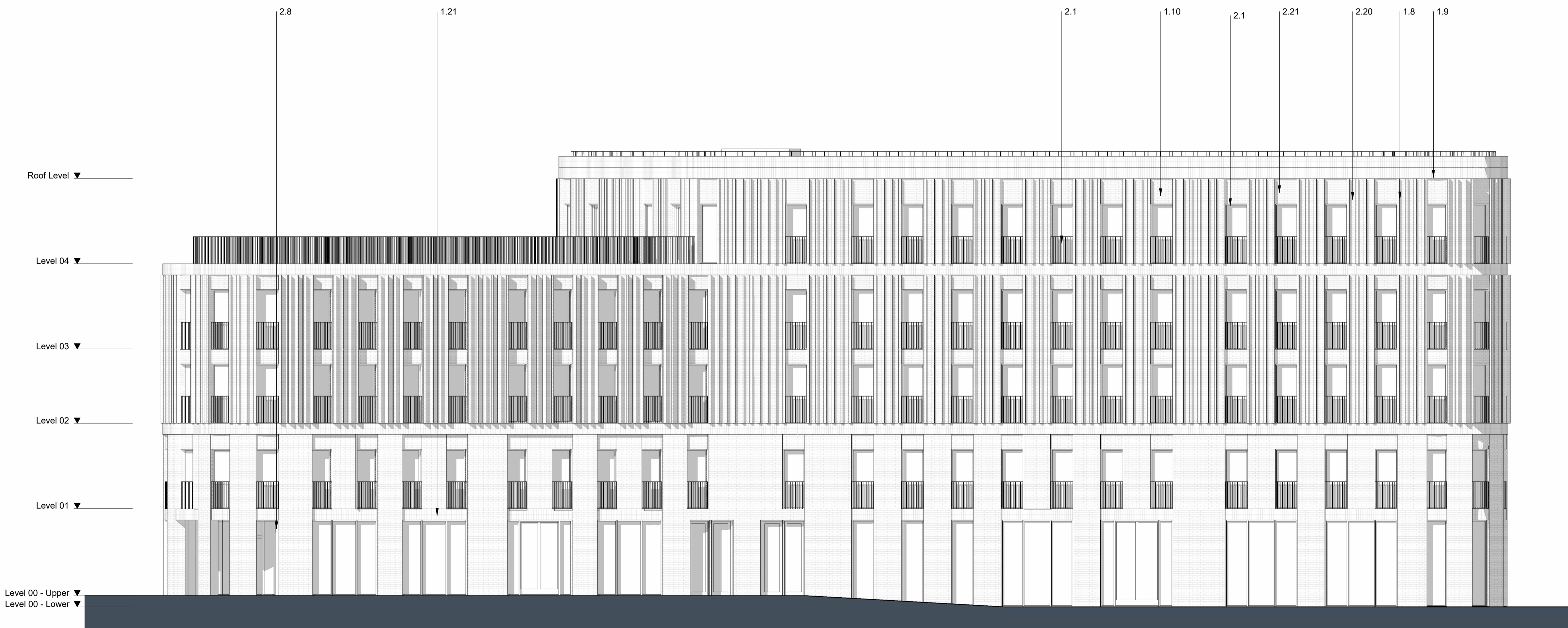
2 D - 05 - West Elevation Scale 1 : 100

Contractors and consultants are not to scale dimensions from this drawing