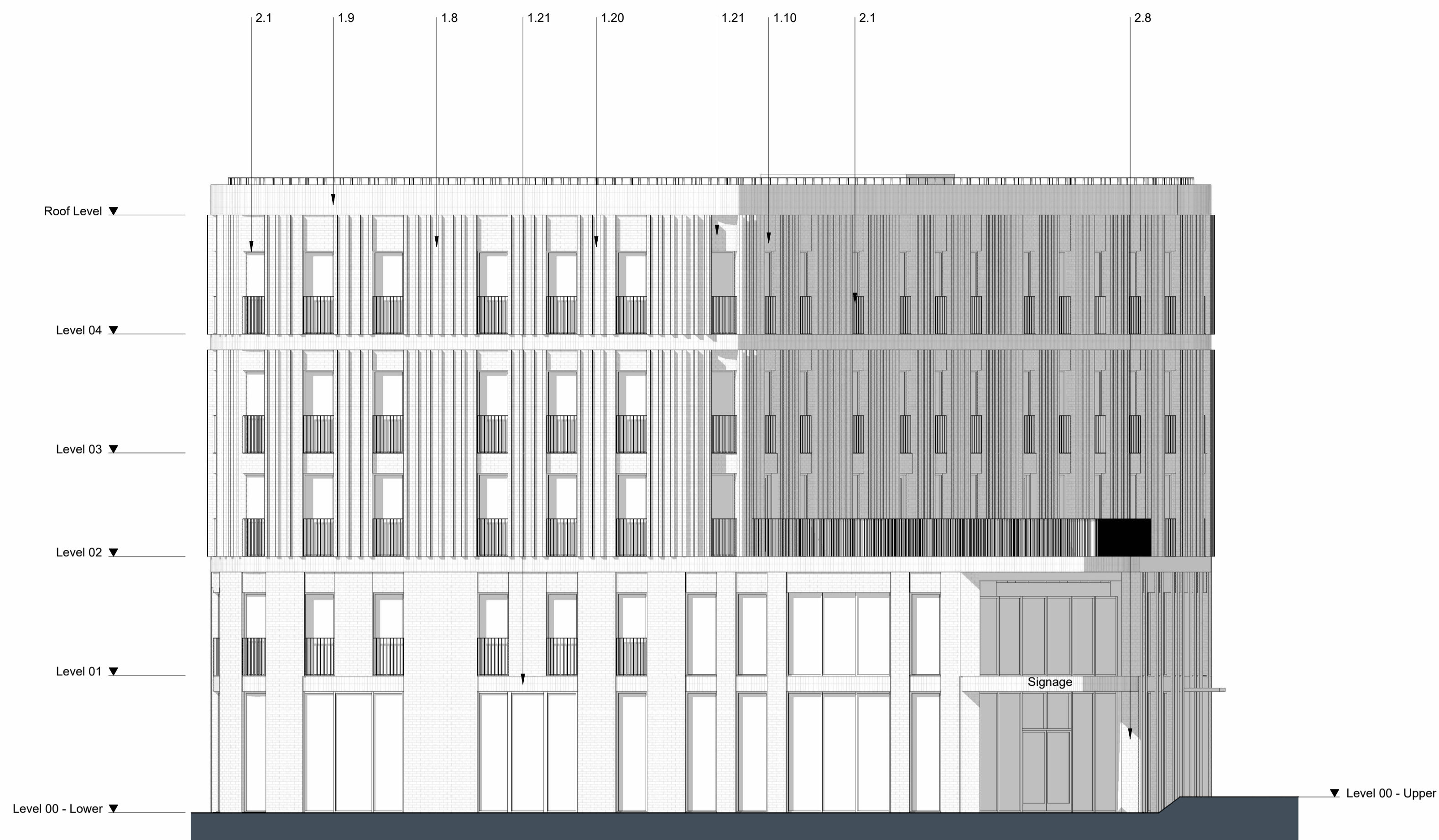
1 D - 05 - South Elevation Scale 1 : 100