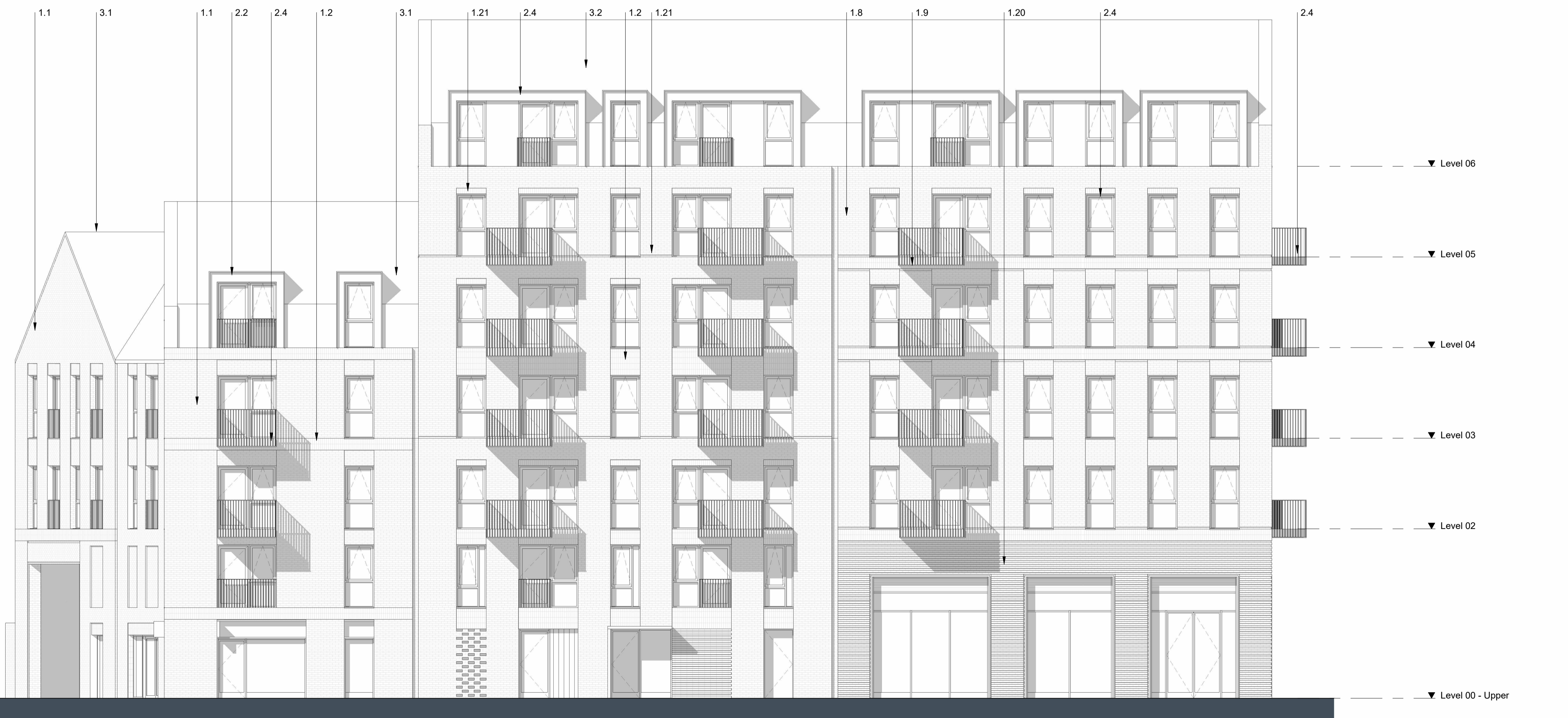
2 M - 05 - West Elevation Scale 1 : 100

Contractors and consultants are not to scale dimensions from this drawing Reproduced by permission of Ordnance Survey on behalf of HMSO © CROWN COPYRIGHT and database right 2008 All rights reserved Ordnance Survey Licence number AL 1000 22432 Broadway Malyan Limited The survey information shown on this drawing is based on a topographical survey prepared by a third party and Broadway Malyan Limited accept no responsibility for the accuracy or completeness of the survey. Drawings to be read in conjunction with the associated Design & Access Statement, associated consultant design team documents & reports and landscape information Landscape shown is for illustrative purposes only. For detailed landscape information, please refer to the landscape information & documents.