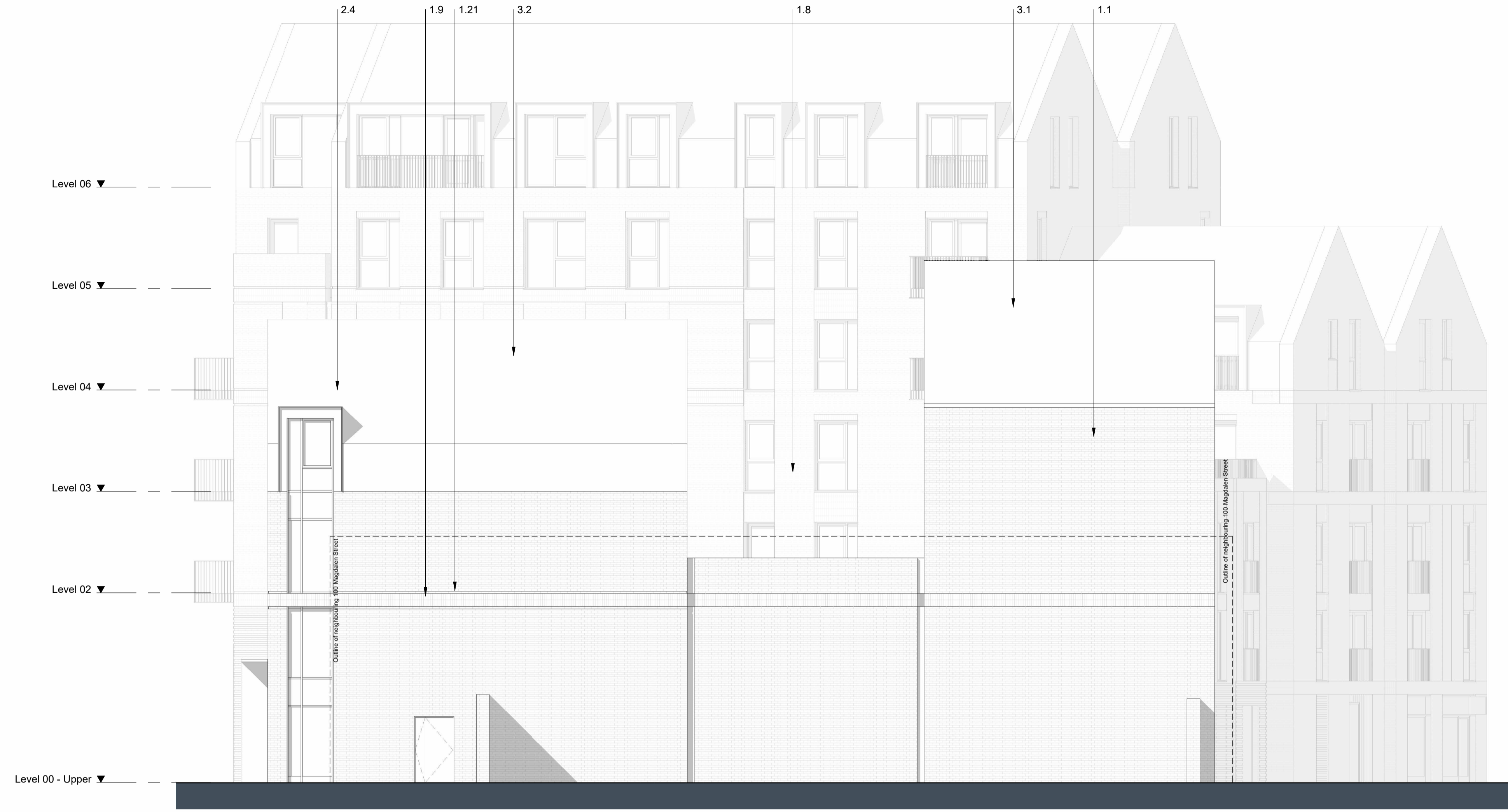
1 M - 05 - East Elevation Scale 1 : 100