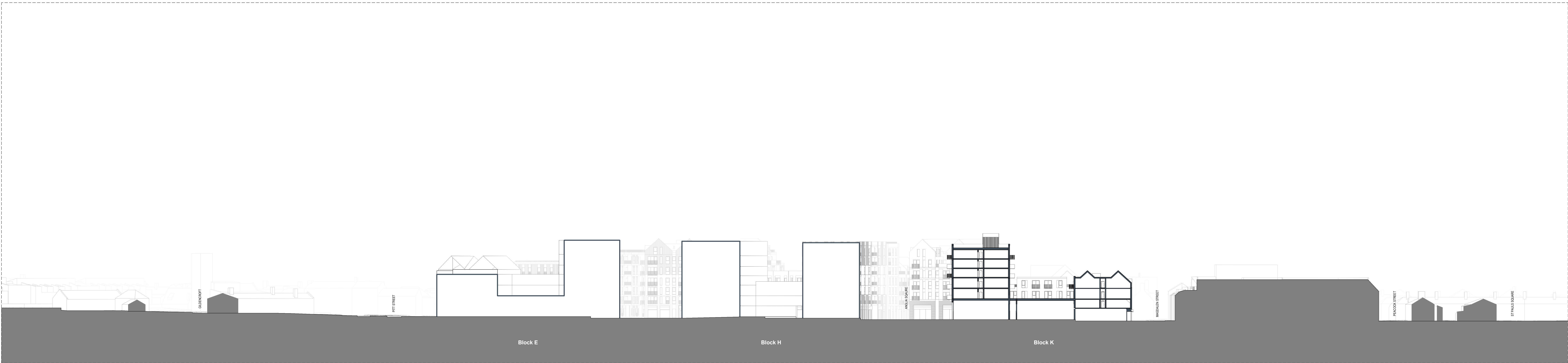
2 Site Section 02 Scale 1:500