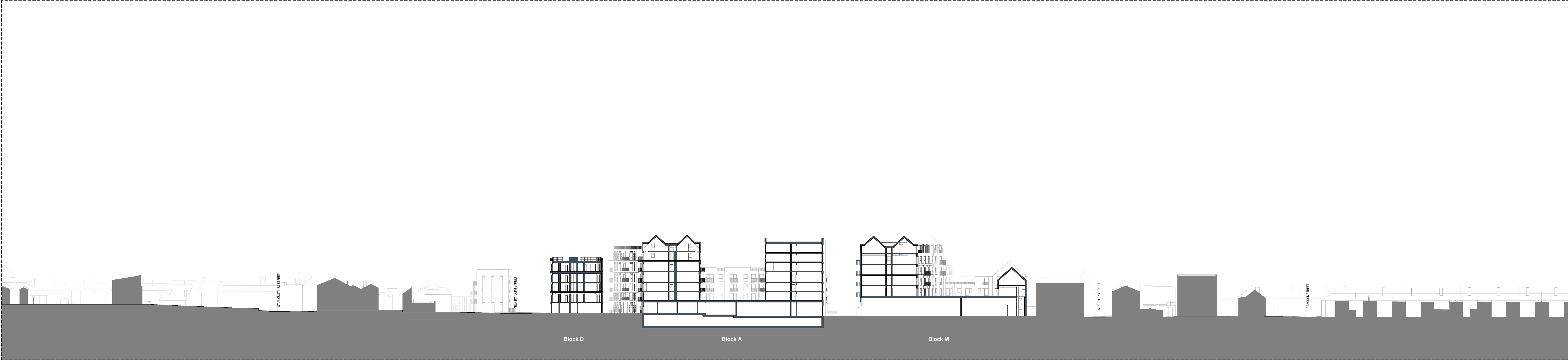
1 Site Section 01 Scale 1:500