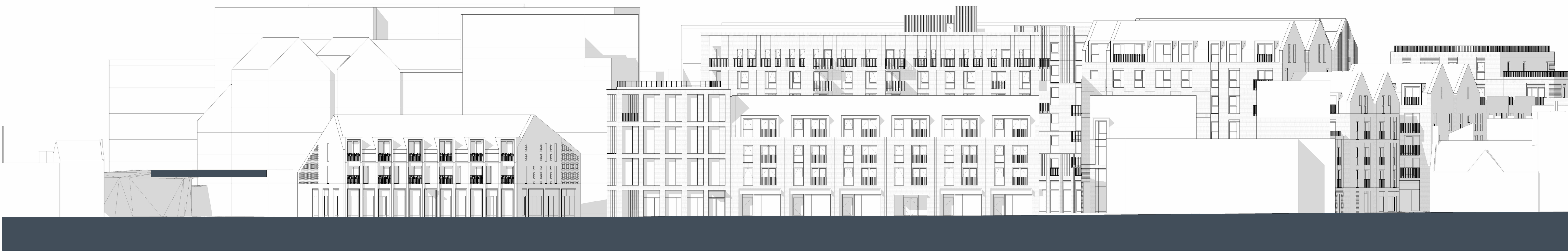
1 Magdalen Street Elevation Scale 1 : 200