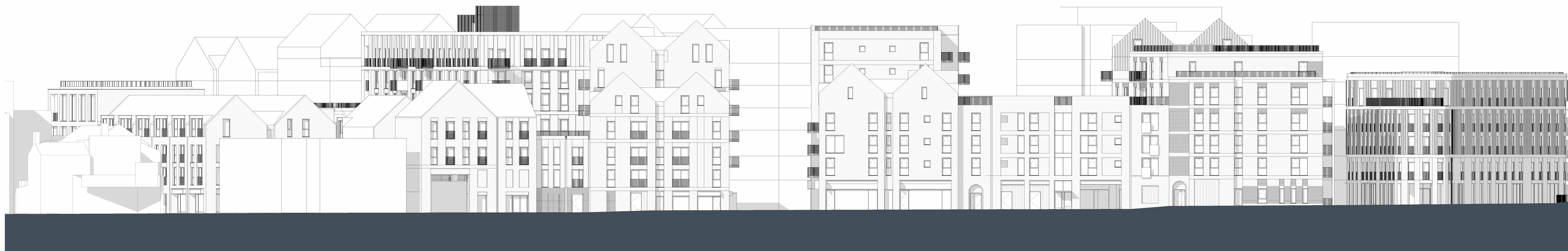
2 Edward Street Elevation Scale 1 : 200