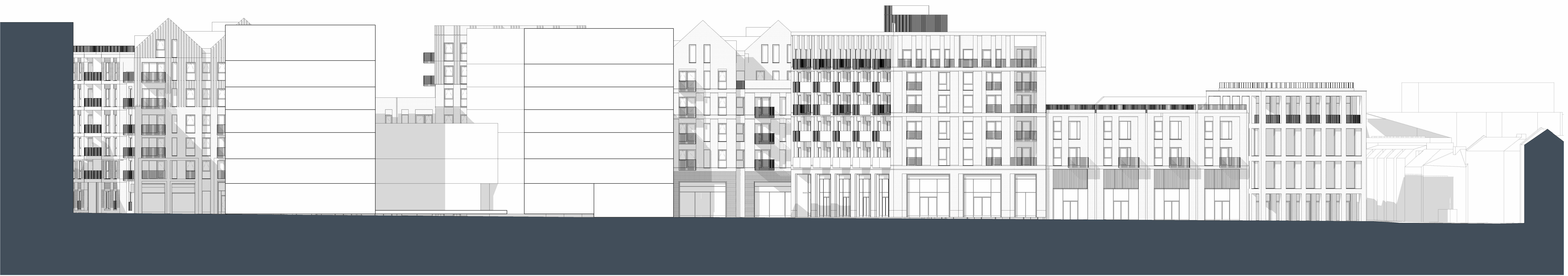
3 Anglia Square - Part 2 Scale 1: 200