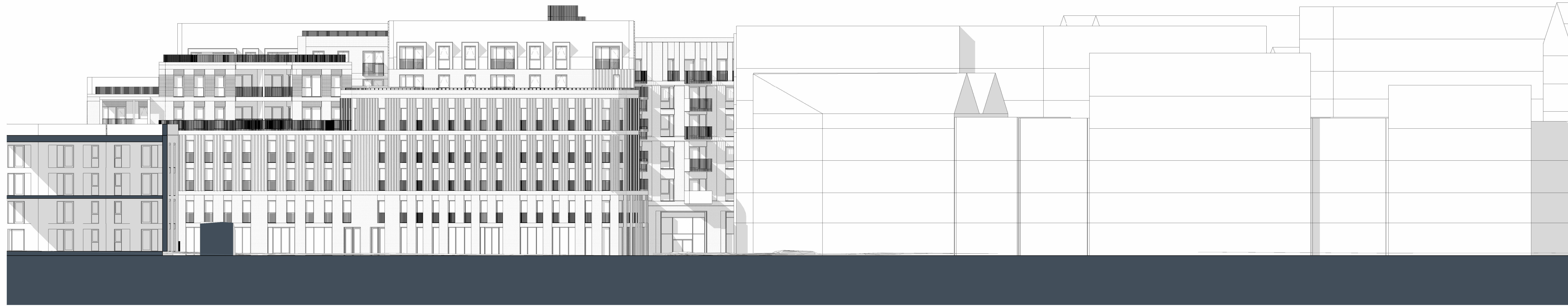
2 Pitt Street Elevation - Part 1 Scale 1:200