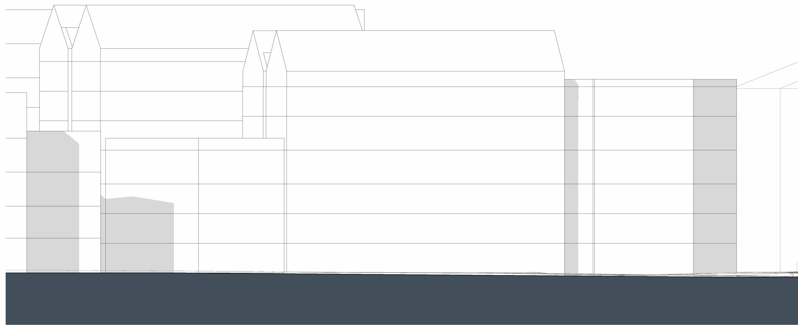
3 Pitt Street Elevation - Part 2 Scale 1:200