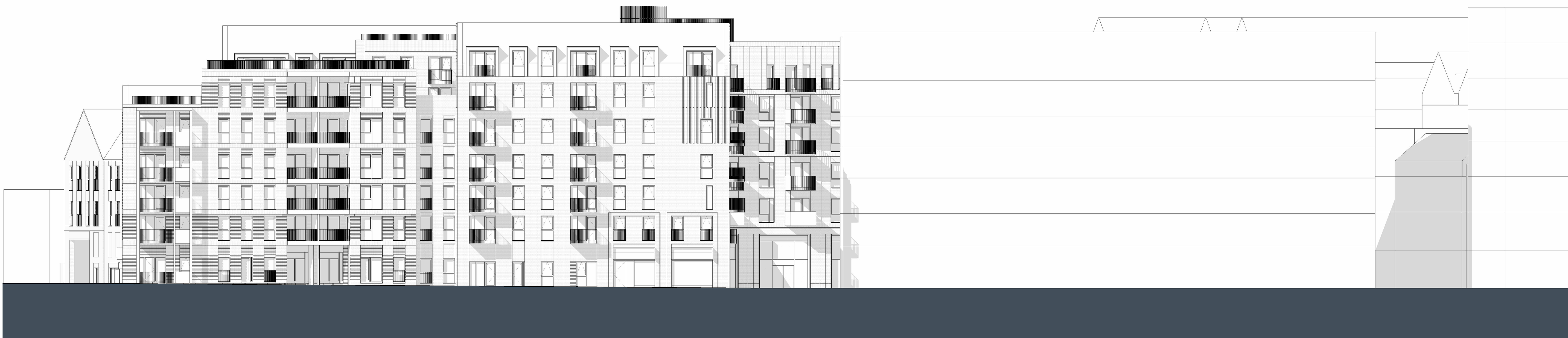
1 St Georges West - Part 1 Scale 1 : 200