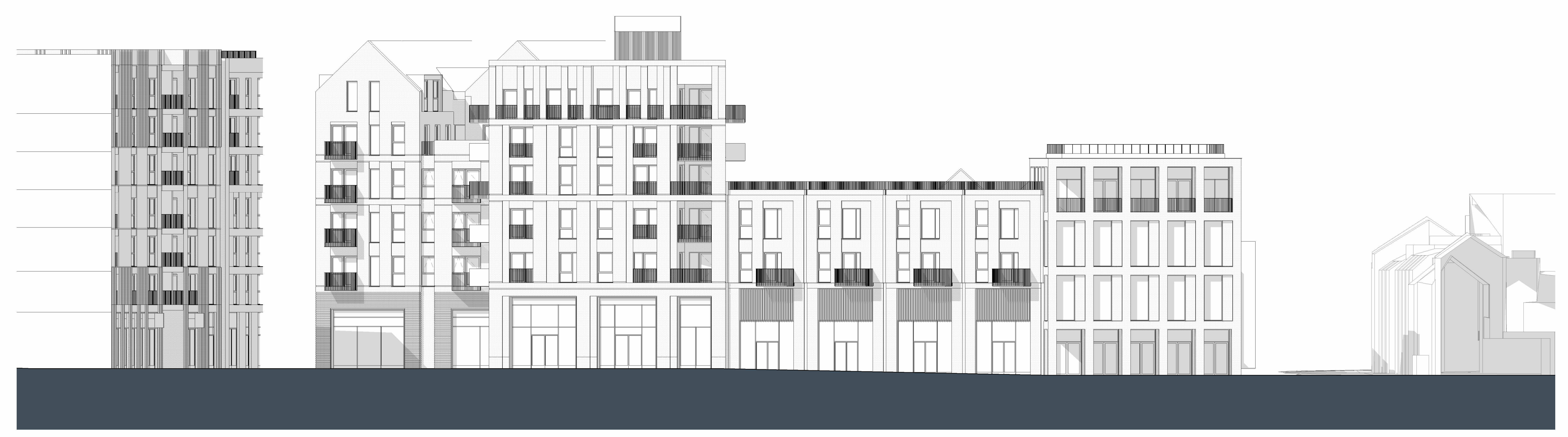
2 Sovereign Tooley - Part 2 Scale 1 : 200