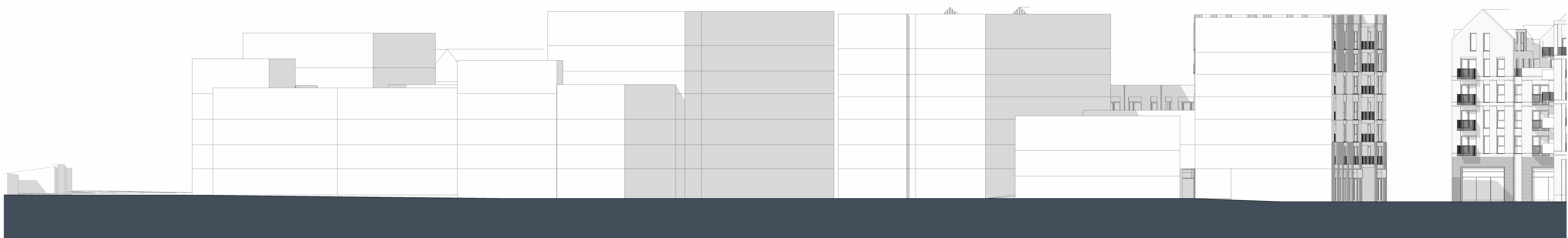
1 Sovereign Tooley - Part 1 Scale 1 : 200