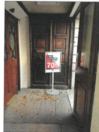
PHOTO OF PLANTER NIGHT TIME STORAGE

GENERAL NOTES ALL DIMENSIONS TO BE CHECKED ON SITE PRIOR TO COMMENCEMENT OF WORKS - PLEASE REPORT ERRORS OR OMISSIONS TO THE ARCHITECT. THIS DRAWING HAS BEEN PRODUCED FOR THE PURPOSES OF PLANNING AND BUILDING REGULATIONS APPROVALS ONLY AND IS NOT INTENDED TO BE A FULL WORKING DRAWING. THIS DRAWING IS TO BE READ IN CONJUNCTION WITH ANY WRITTEN SPECIFICATIONS, SCHEDULES OF WORK AND STRUCTURAL ENGINEERS DETAILS AS APPROPRIATE. THIS DRAWING IS THE COPYRIGHT OF PUMP HOUSE DESIGNS AND ANY FURTHER REPRODUCTION OF THE PLAN IS NOT PERMITTED WITHOUT OBTAINING PRIOR CONSENT.