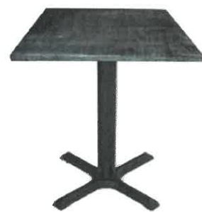
PROPOSED EXTERNAL TABLE FOLD AWAY TABLE BASES