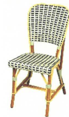
PROPOSED EXTERNAL SEAT MAISON DRUCKER CHAIR

WE MAKE IT HAPPEN Design & Build Ltd Chameleon House, Drury Lane Porewood Ind Est, St Leonards on Sea East Sussex, TN38 9BA T: +44 (0)1424 422666 F: +44 (0)1424 717667 E: info@wmh.co.uk