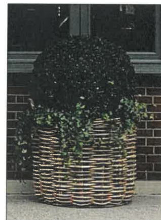
PROPOSED EXTERNAL PLANTER LOCATED EITHER SIDE OF ENTRANCE DOORS