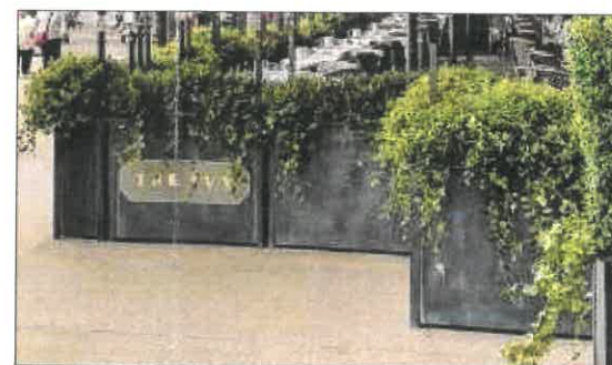
PROPOSED EXTERNAL PLANTER LOCATED AROUND EXTERNAL SEATING AREA

PumpHouse DESIGNS Architectural Consultants Pump House Yard The Green Sedlescombe East Sussex TN33 0QA T: 01424 871120 F: 01424 870198 info@pumphousedesigns.co.uk www.pumphousedesigns.co.uk