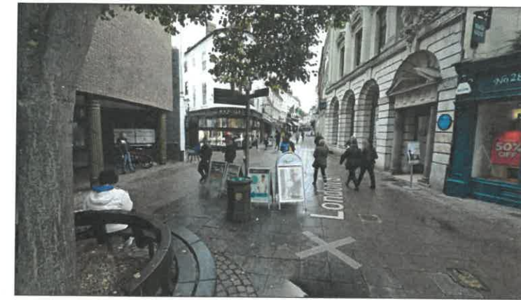
PHOTO OF EXISTING EXTERNAL FRONT ELEVATION