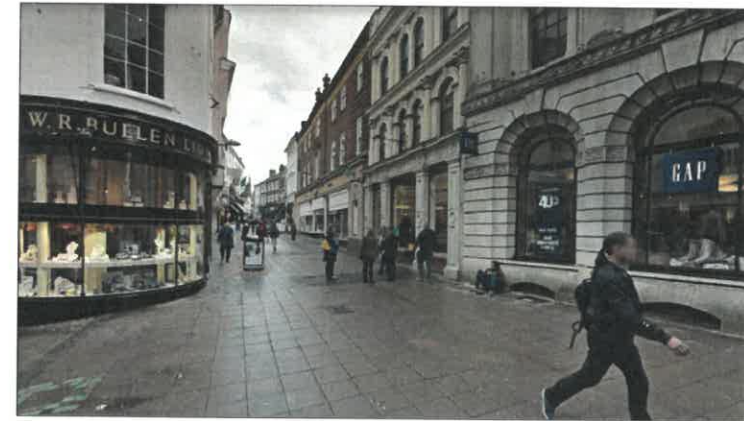
PHOTO OF EXISTING EXTERNAL FRONT ELEVATION