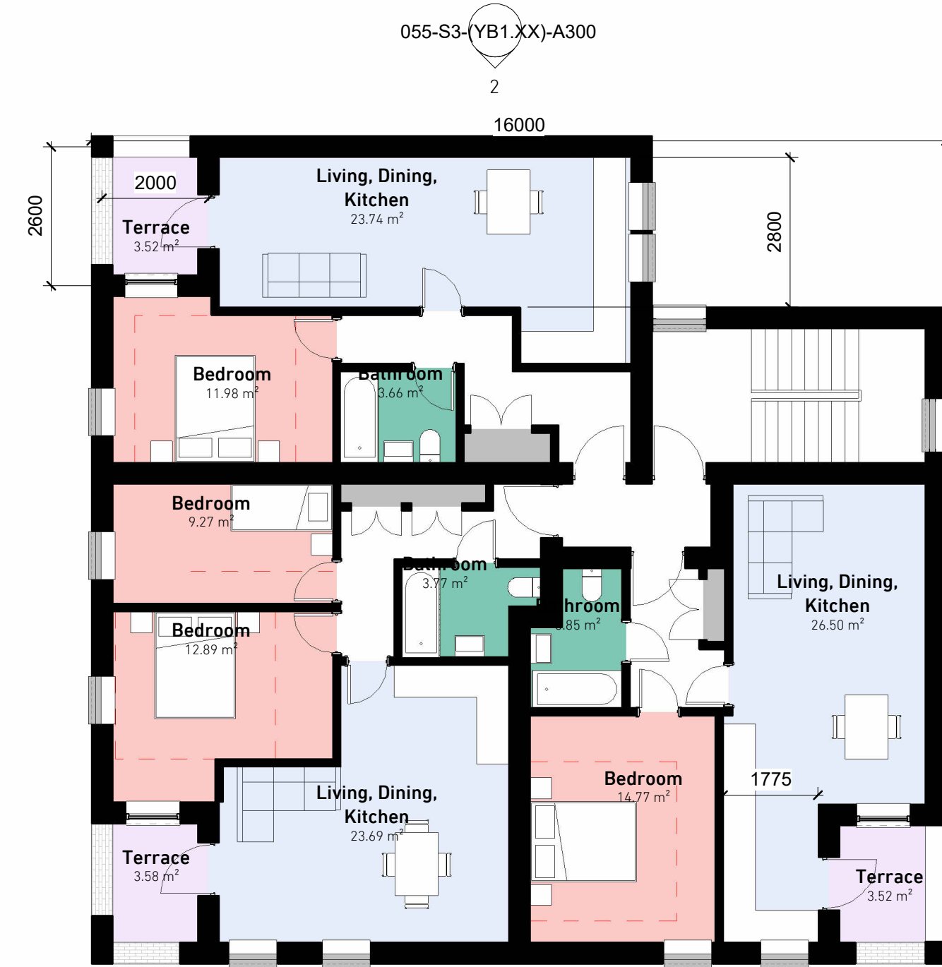
2 01/Flr 1 : 100