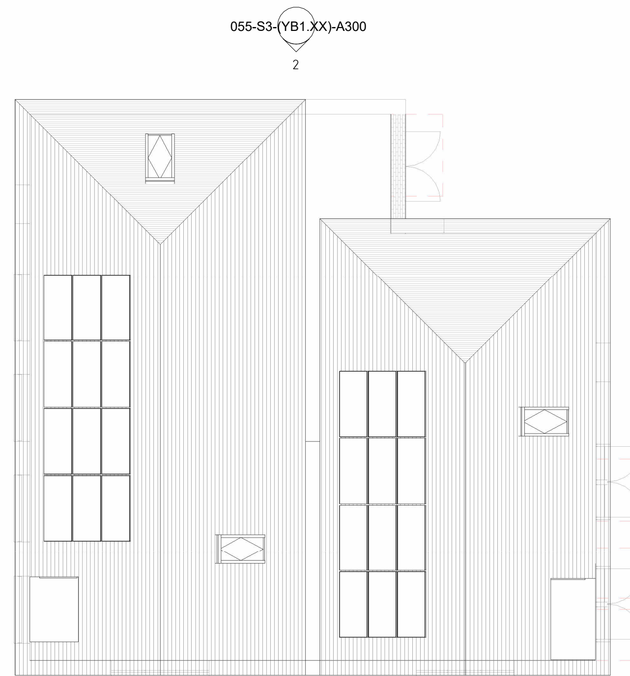
3 02/Flr 1 : 100