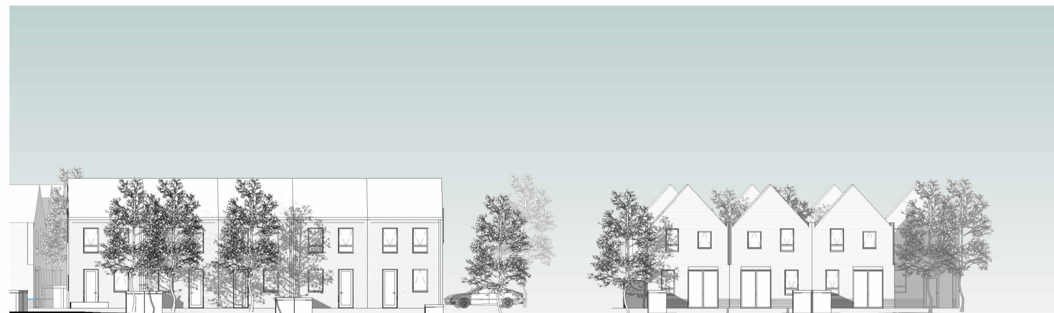
(4) View through marsh - north facing