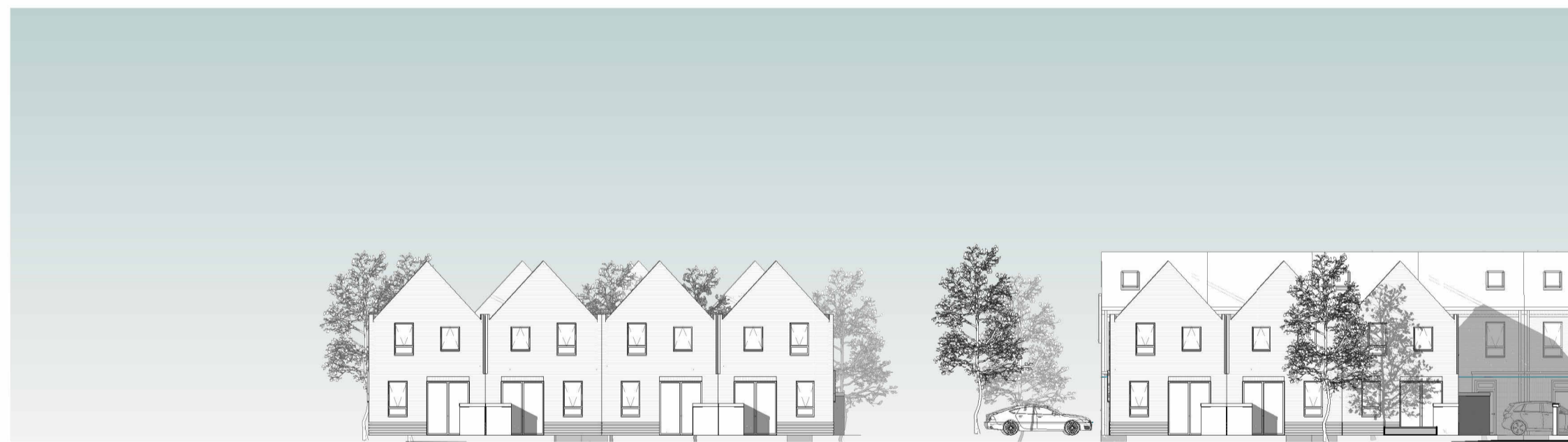
(3) View through marsh - south facing