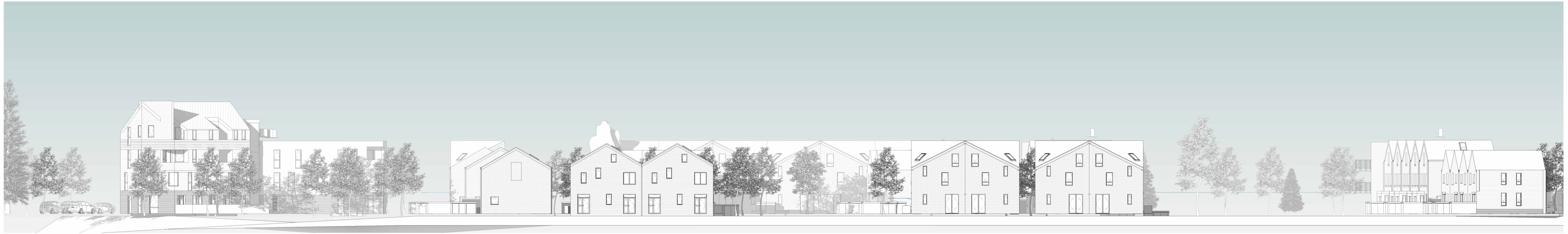
(1) West Elevation 1 (through marsh)