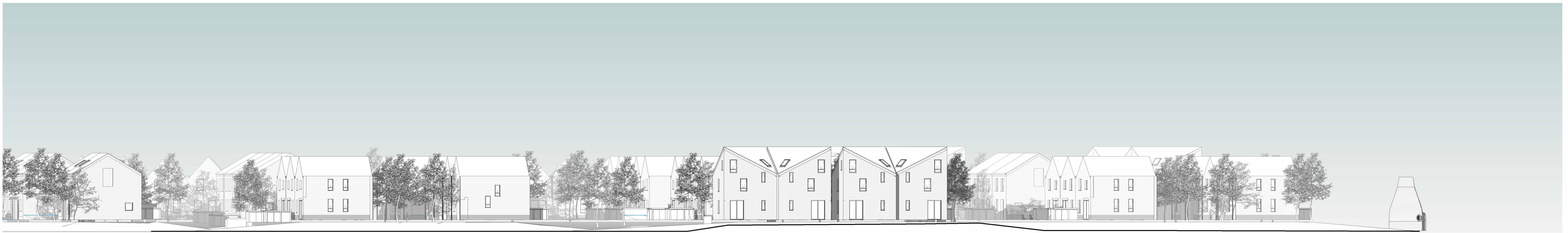
(2) West Elevation 2 (through marsh)