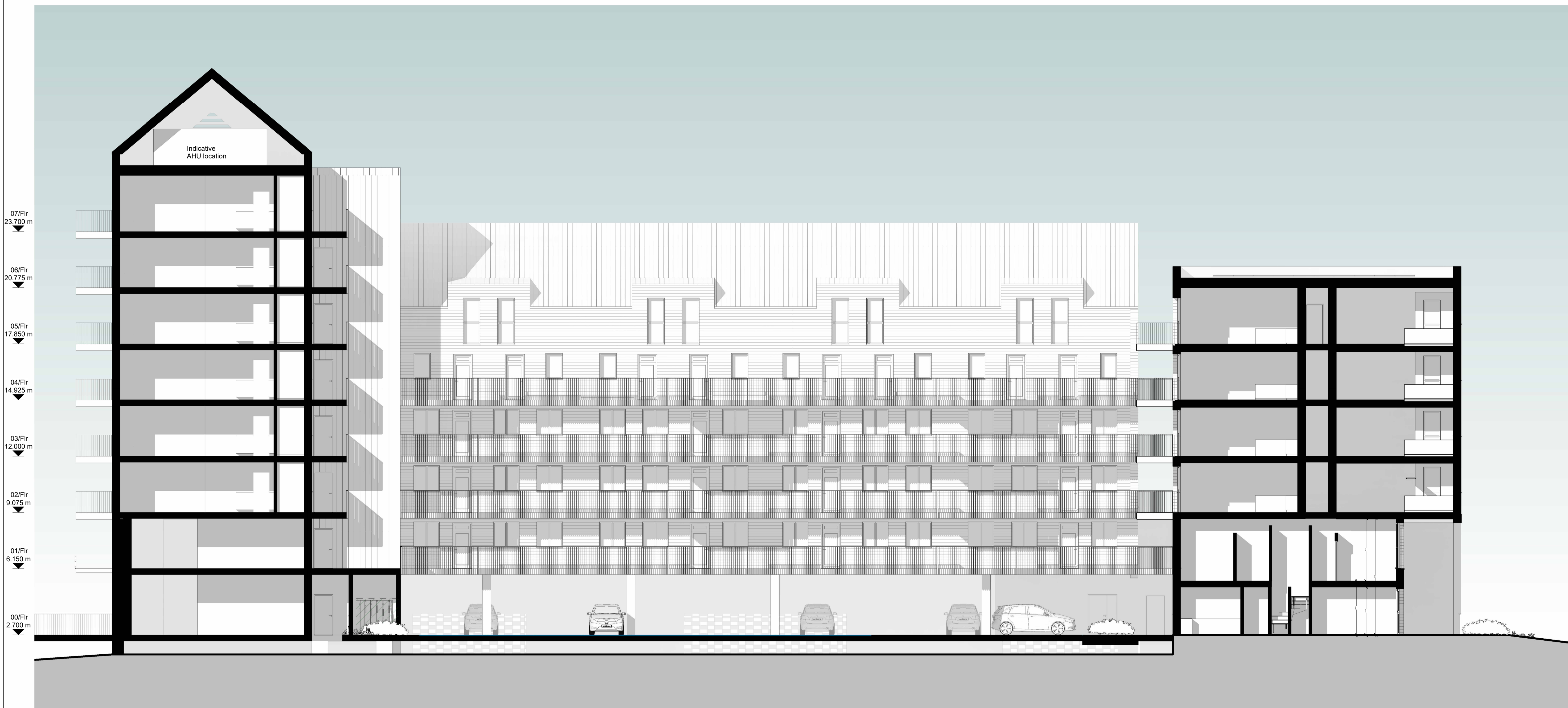
1 Section 3 1 : 100