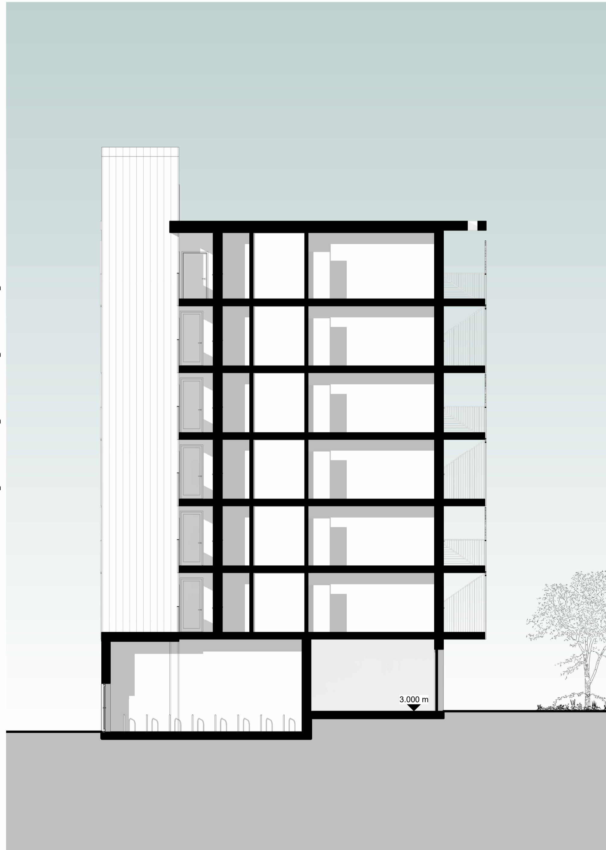
1 Section 1 1 : 100