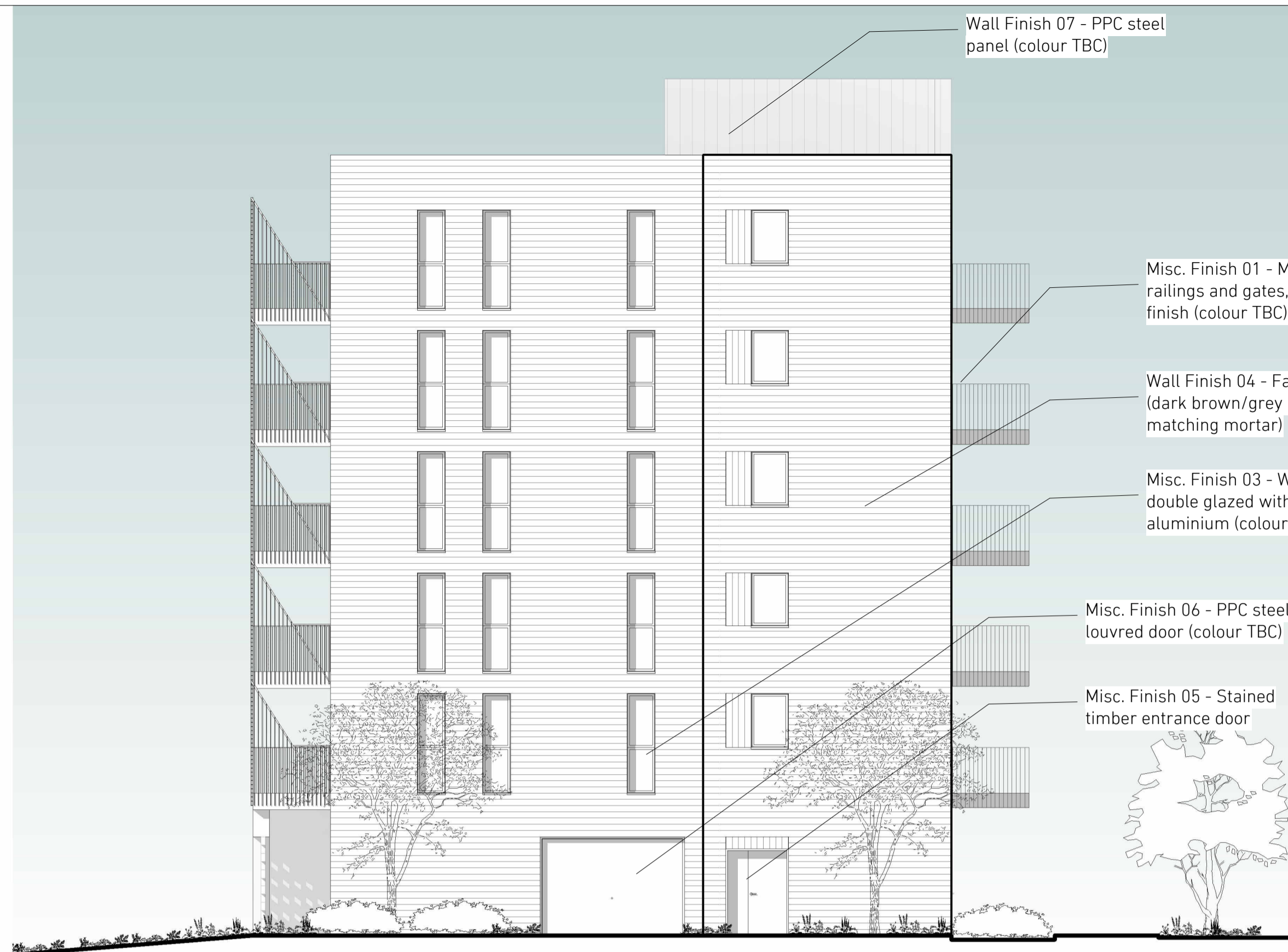
1 South Elevation 1 : 100