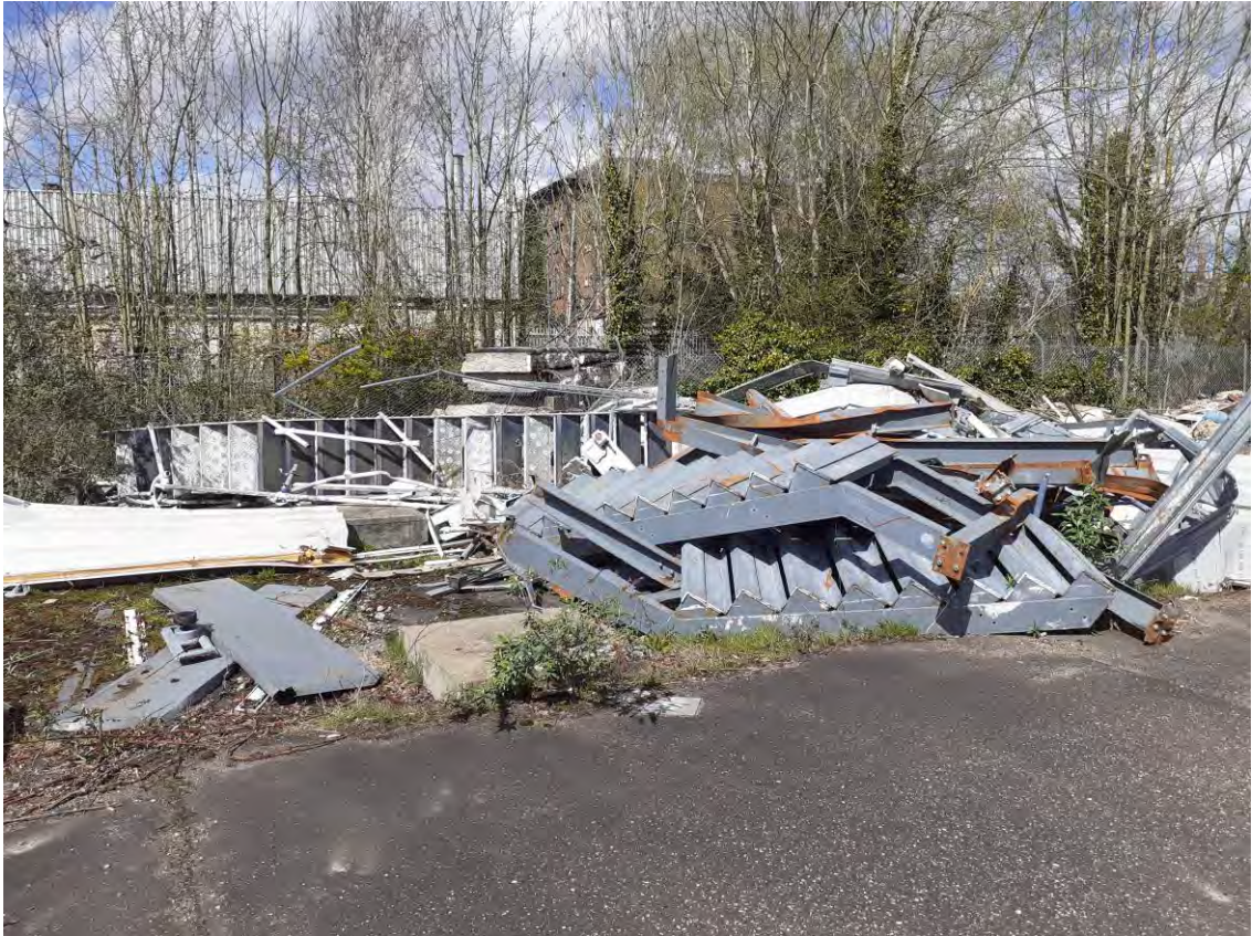
Photograph 22: Scrap metal close to the western boundary.