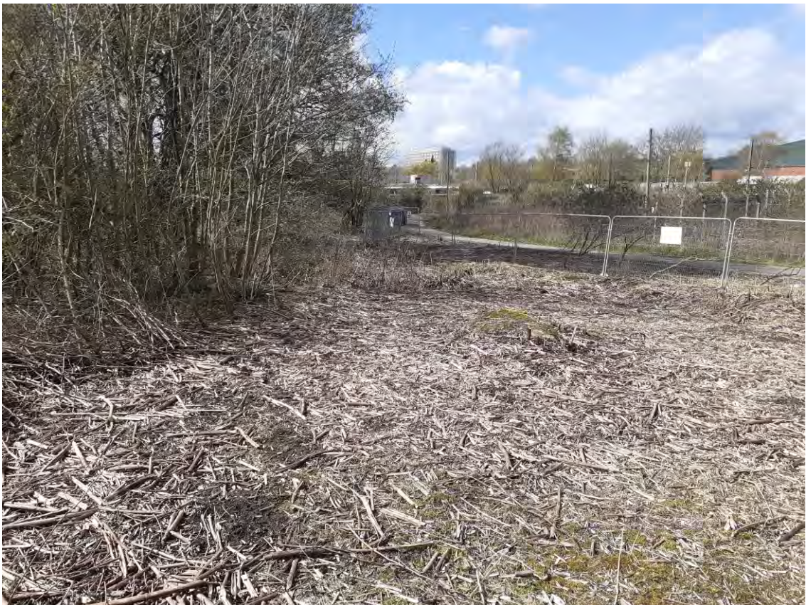
Photograph 8 : Treated area of Japanese Knotweed.