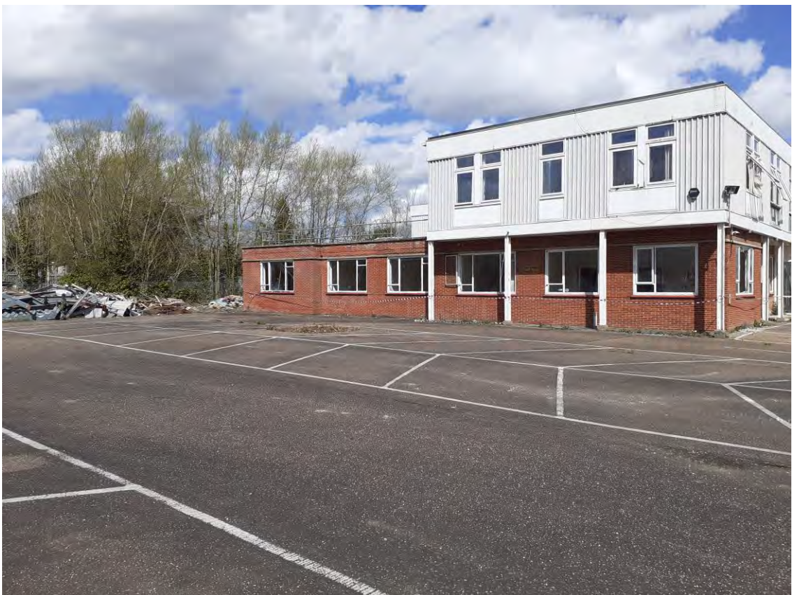
Photograph 23: Office building