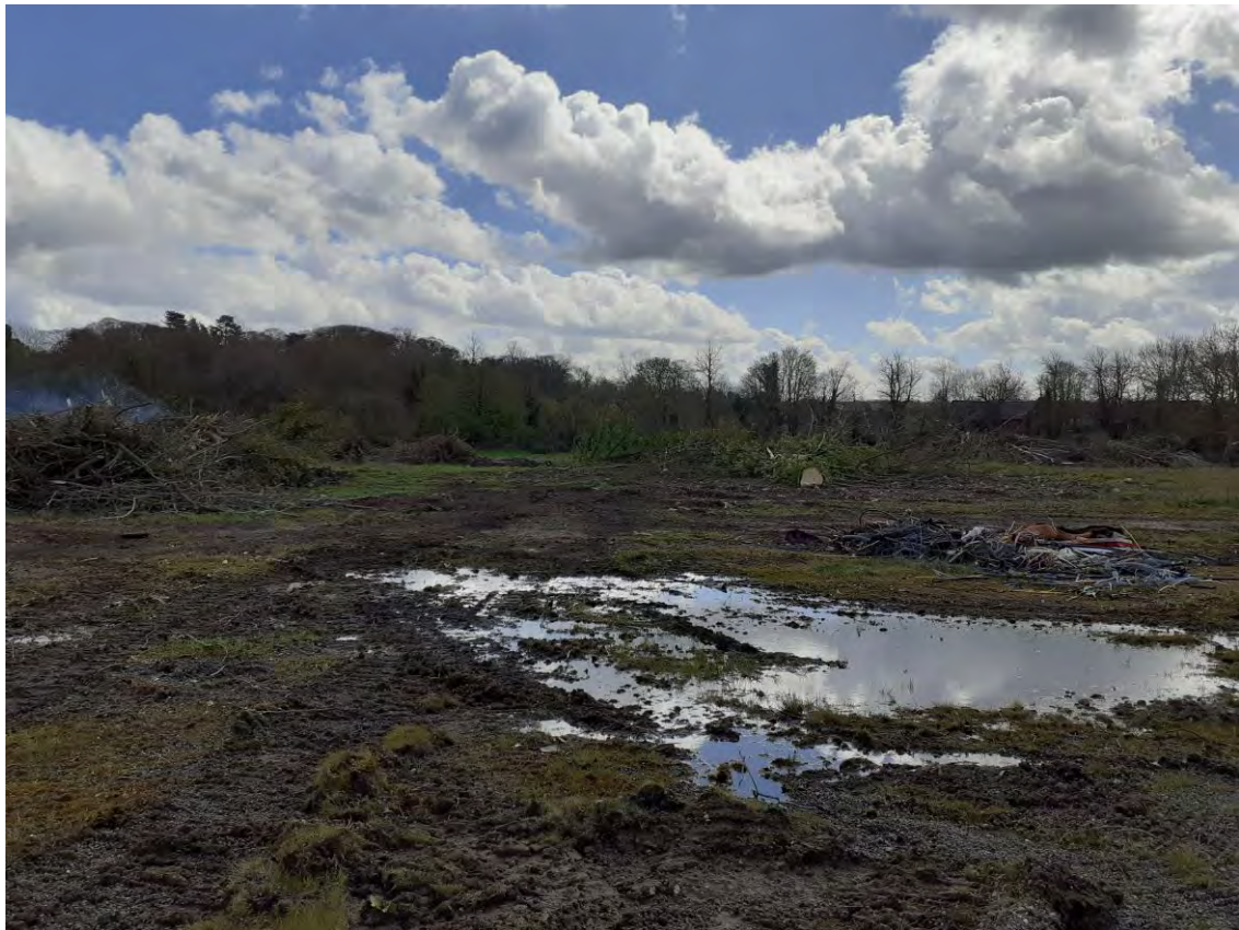
Photograph 29: North eastern portion of the site.