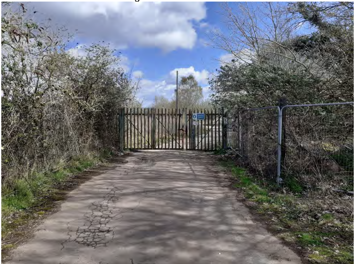
Photograph 4 : Second gated access to the Deal Ground site.