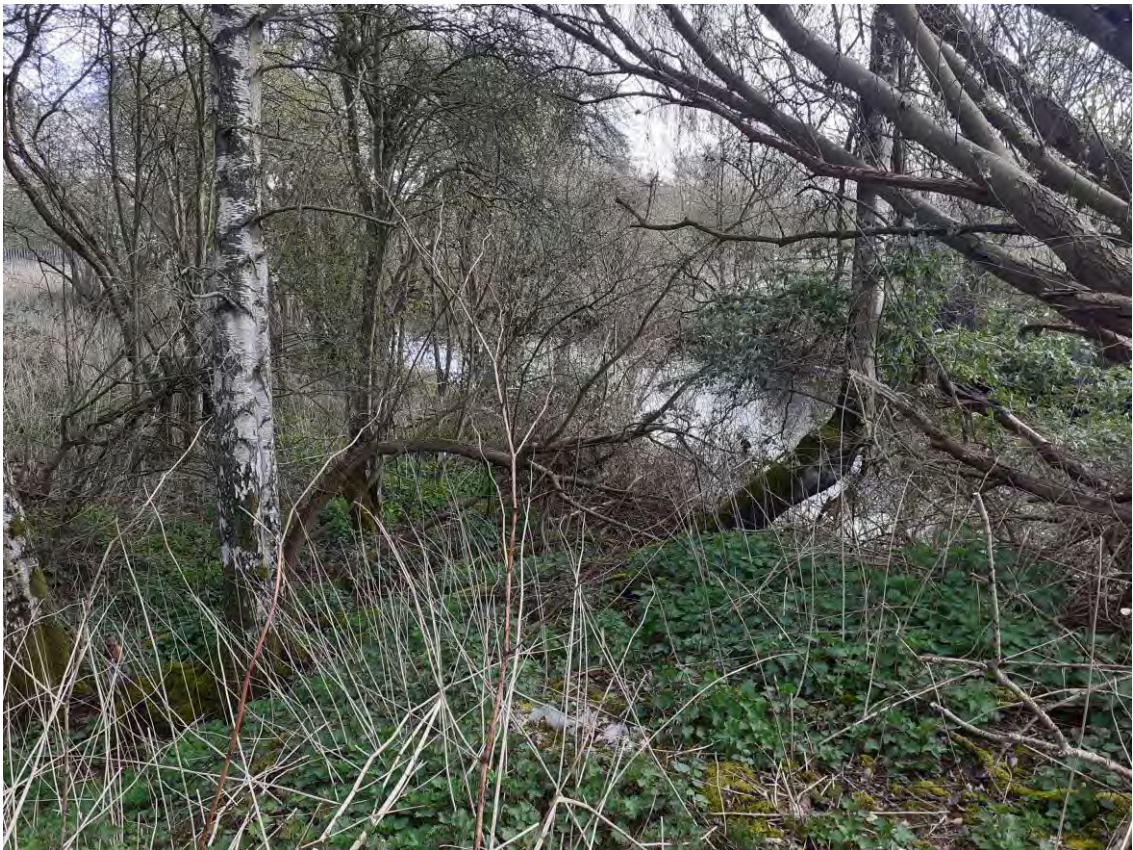
Photograph 16 : Potential made ground strip close to the River Yare.