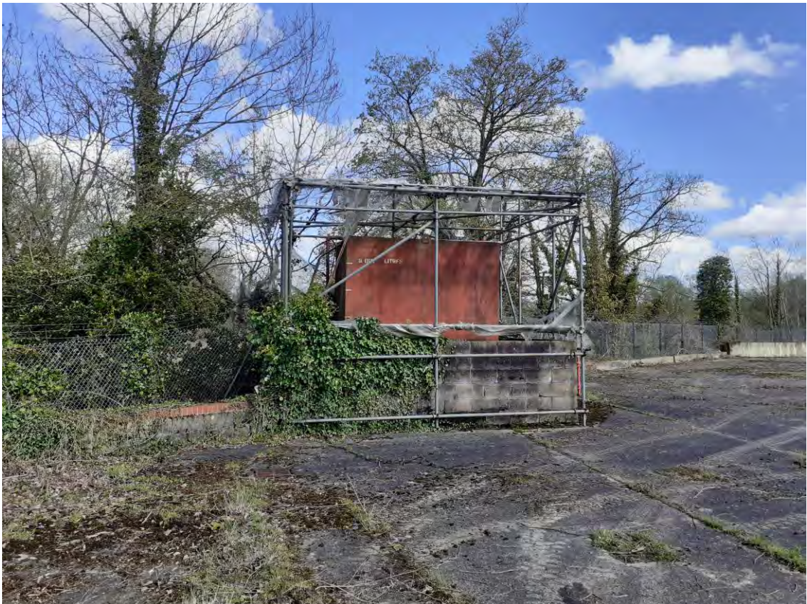
Photograph 27: 9000 litre bunded fuel tank