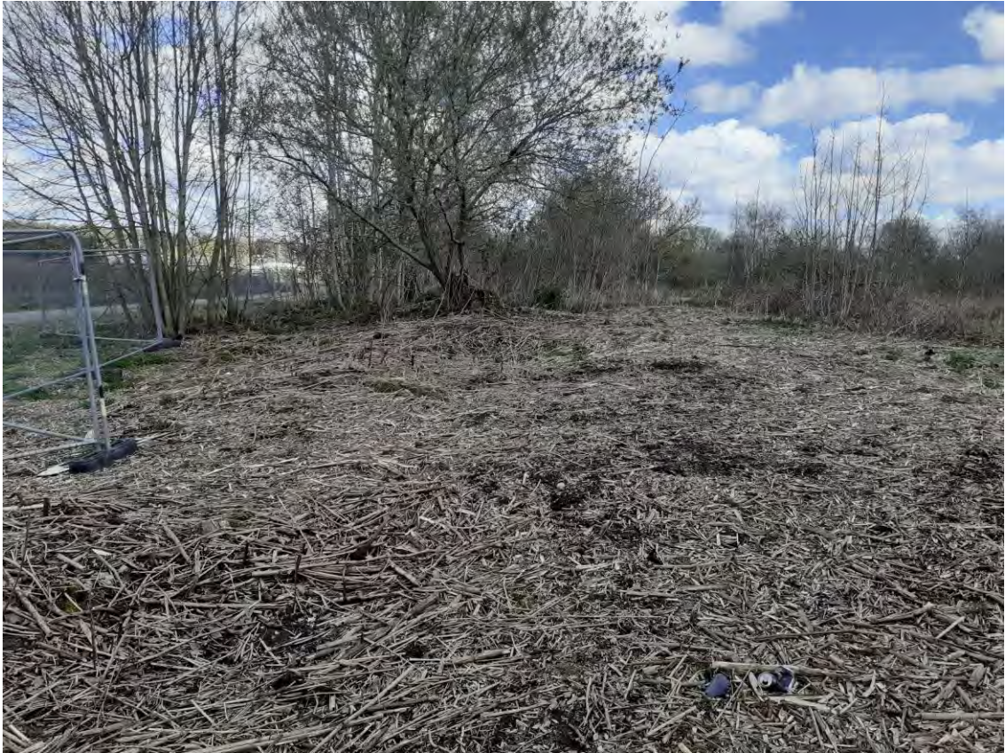
Photograph 7 : Treated area of Japanese Knotweed.