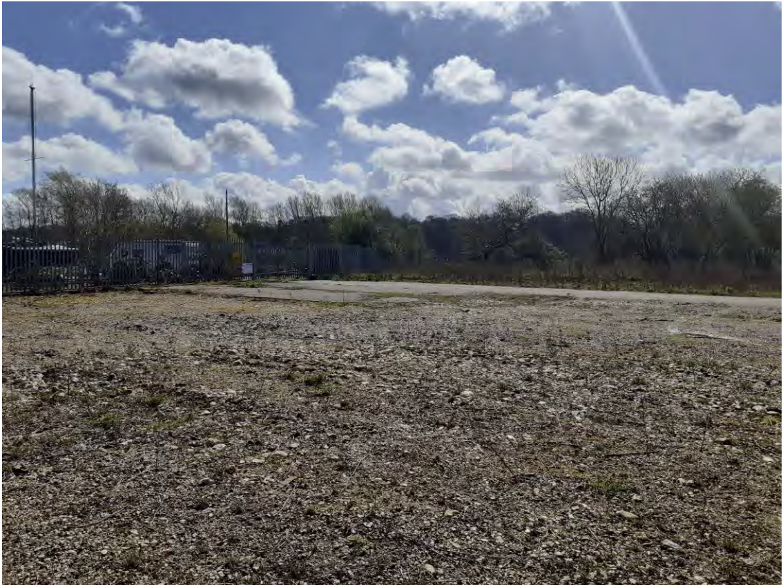
Photograph 14 : North eastern corner and access to Carrow Yacht Club