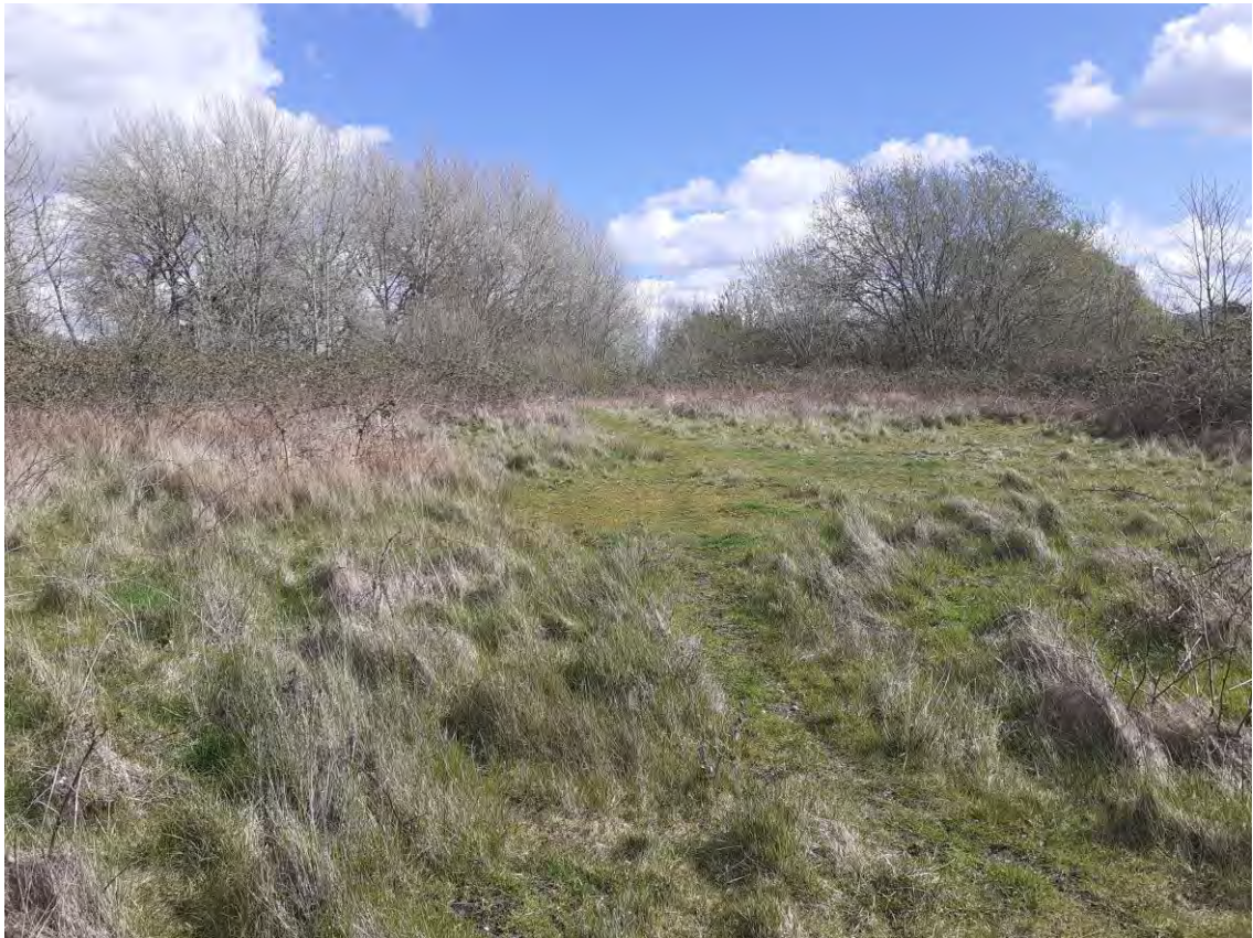
Photograph 3: Grass scrub and brambles between access road and fenland before second gated access.