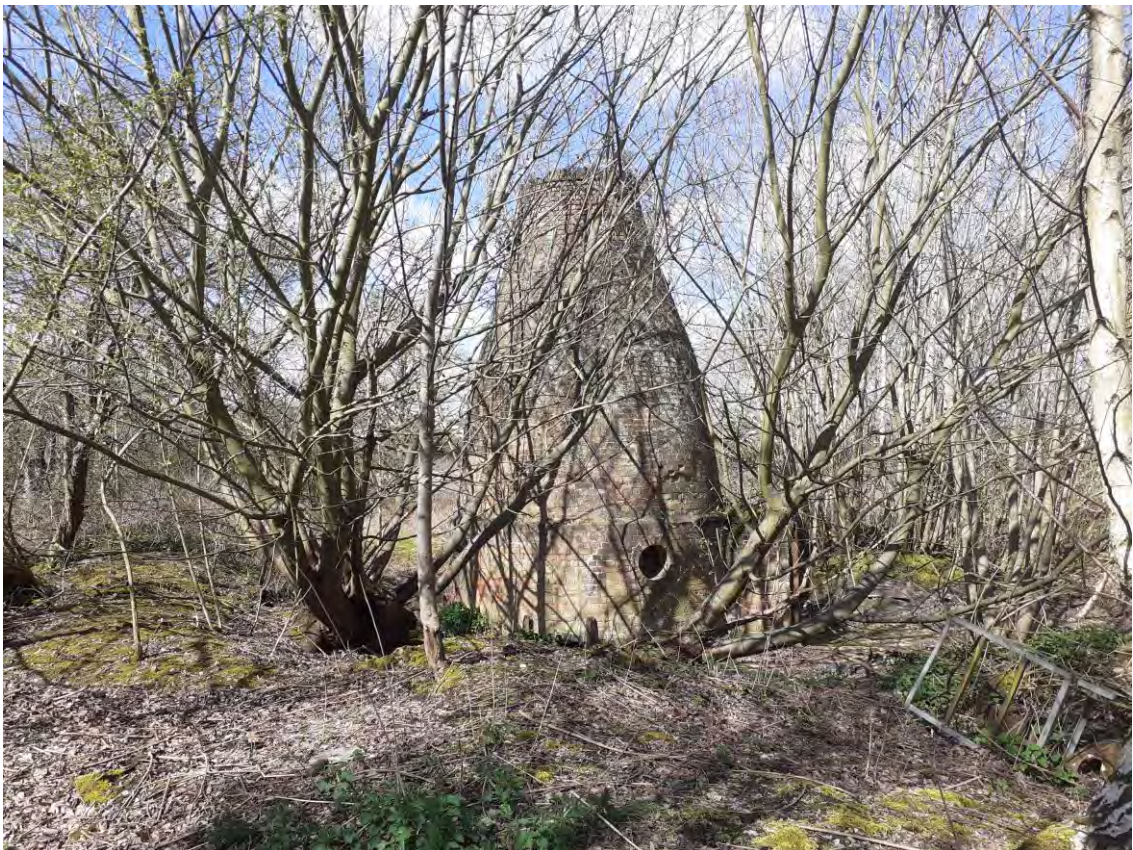
Photograph 18 : Timber drying Bottle Kiln.