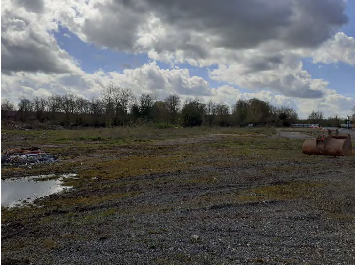
Photograph 30 : View to the south, of the eastern half of the site.