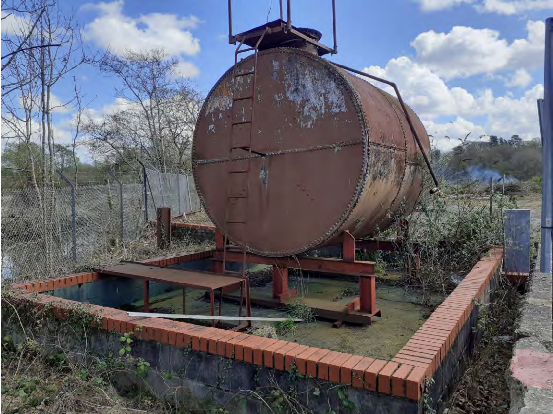
Photograph 28: 10000 litre bunded fuel tank close to northern boundary