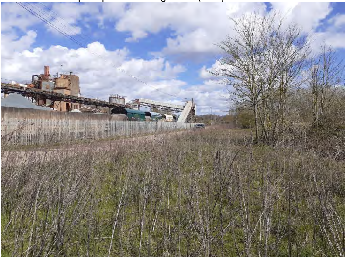
Photograph 2 : Land between access road and fen to the south of the site before second gated access. Asphalt plant to the west.