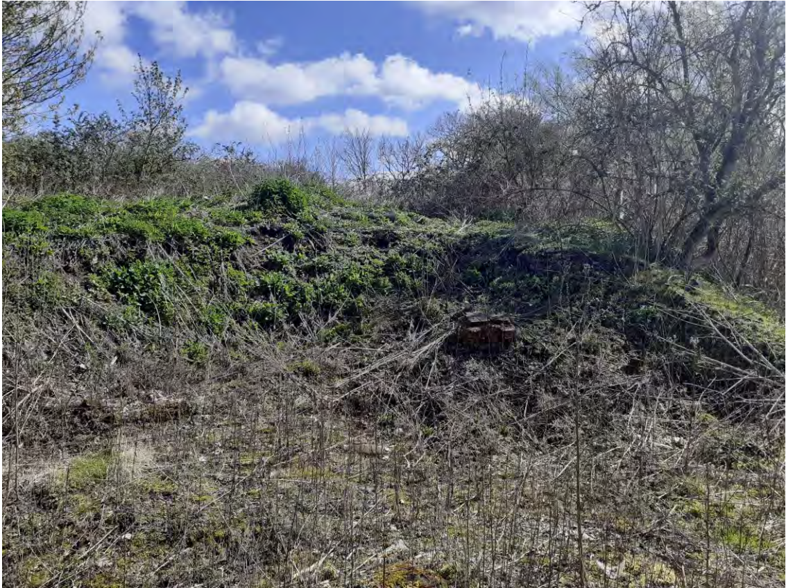
Photograph 17 : Potential made ground strip close to the River Yare.