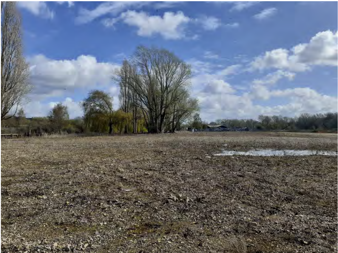
Photograph 12 : View to the north east corner