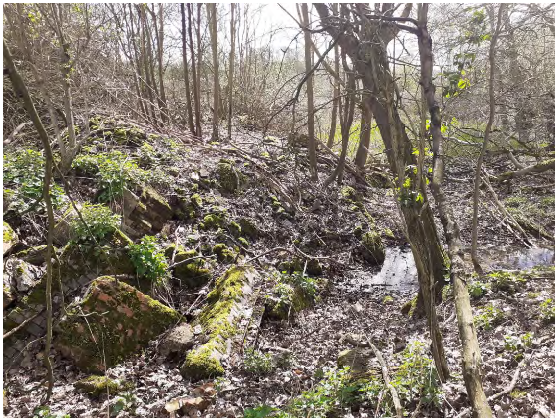
Photograph 6 : Made Ground on land between the access road and the fenland.