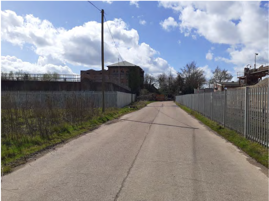
Photograph 1 : Southern end of the site looking to the south towards entrance/exit. Asphalt plant on the right side (west).