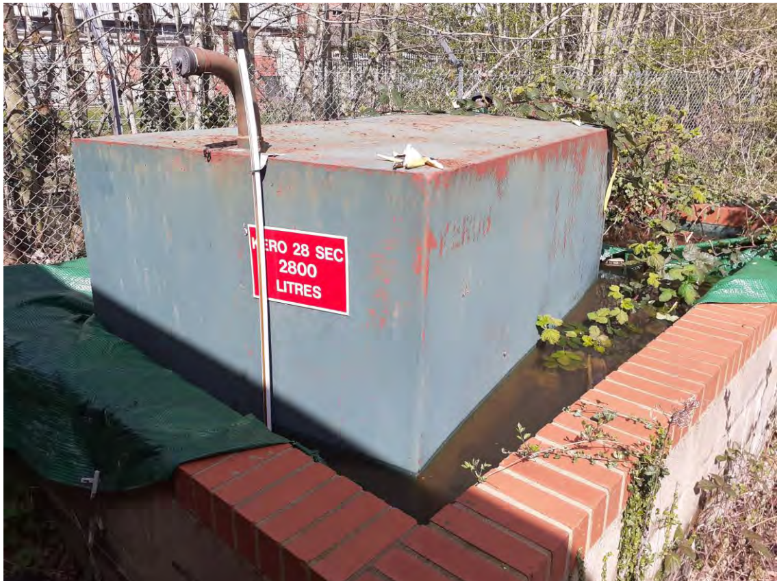
Photograph 21: Heating oil tank with bund full of water.