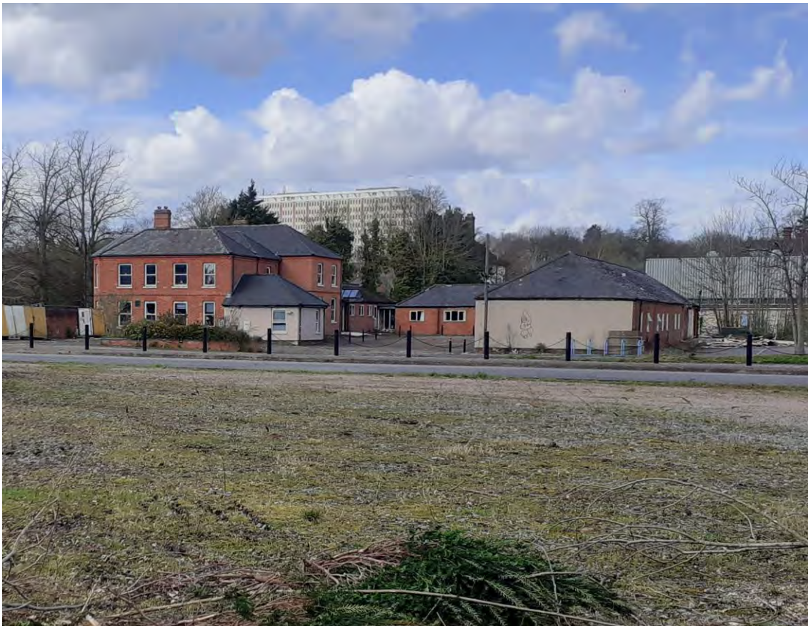
Photograph 19: Office buildings in the south west corner.