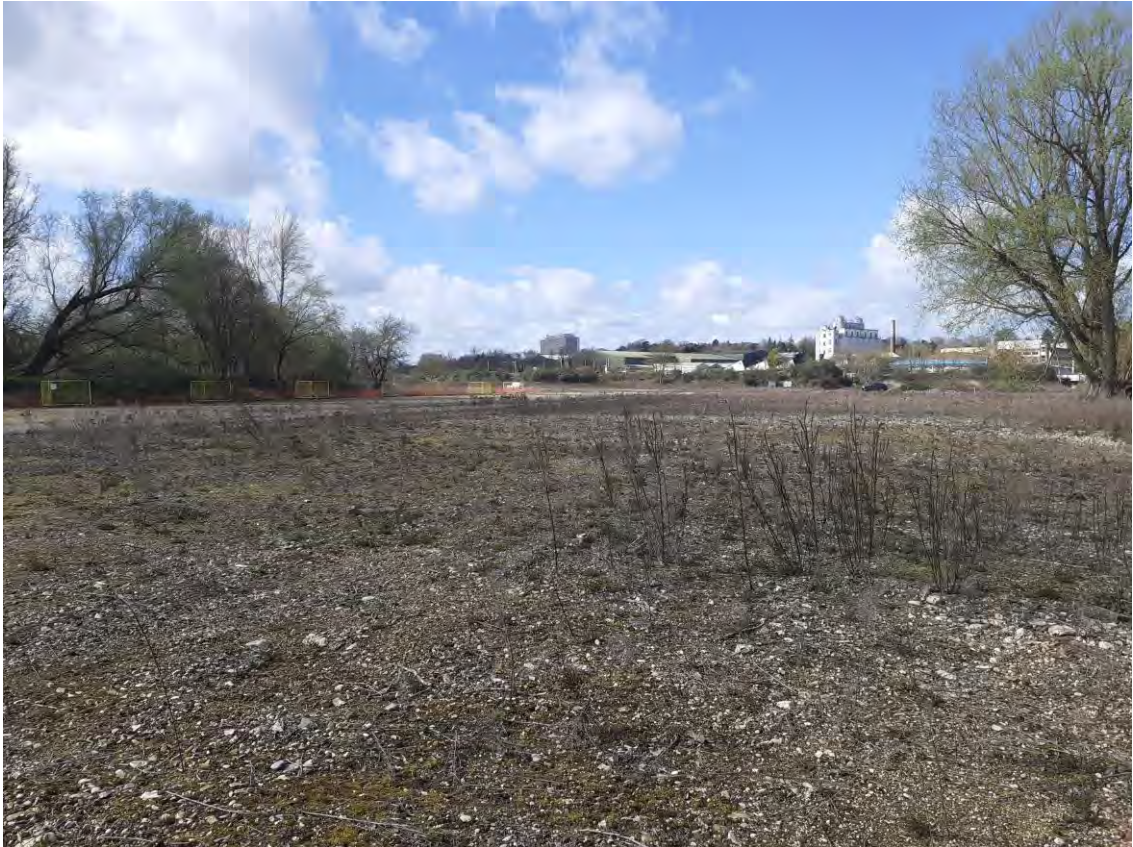
Photograph 15 : View of the northern portion of the site from the east side looking to the west.