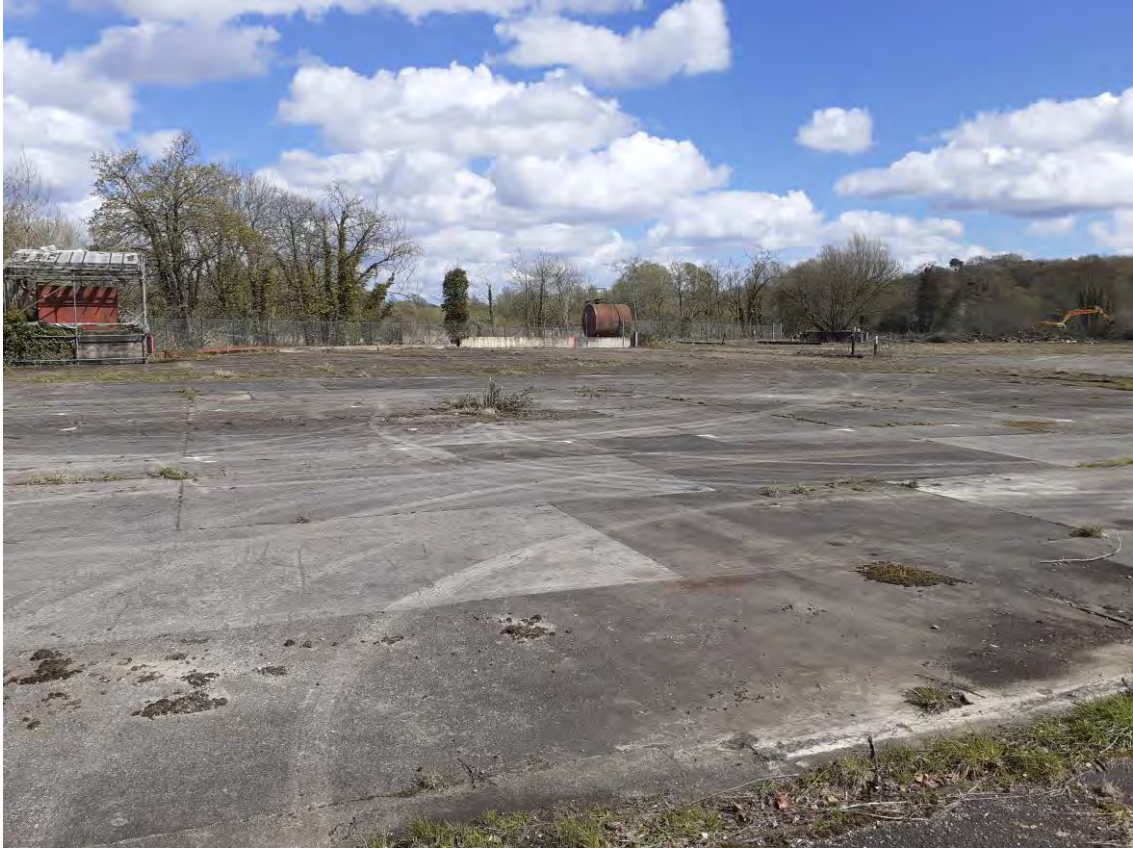
Photograph 25 : Land to the north of the office building. Two large diesel tanks close to the northern boundary.