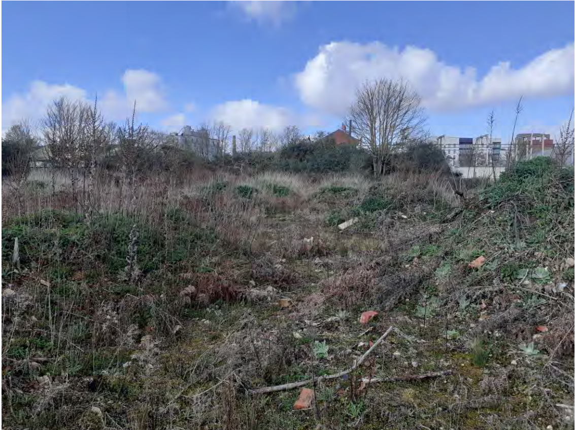
Photograph 11: Spoil heaps on the north west portion of the site.