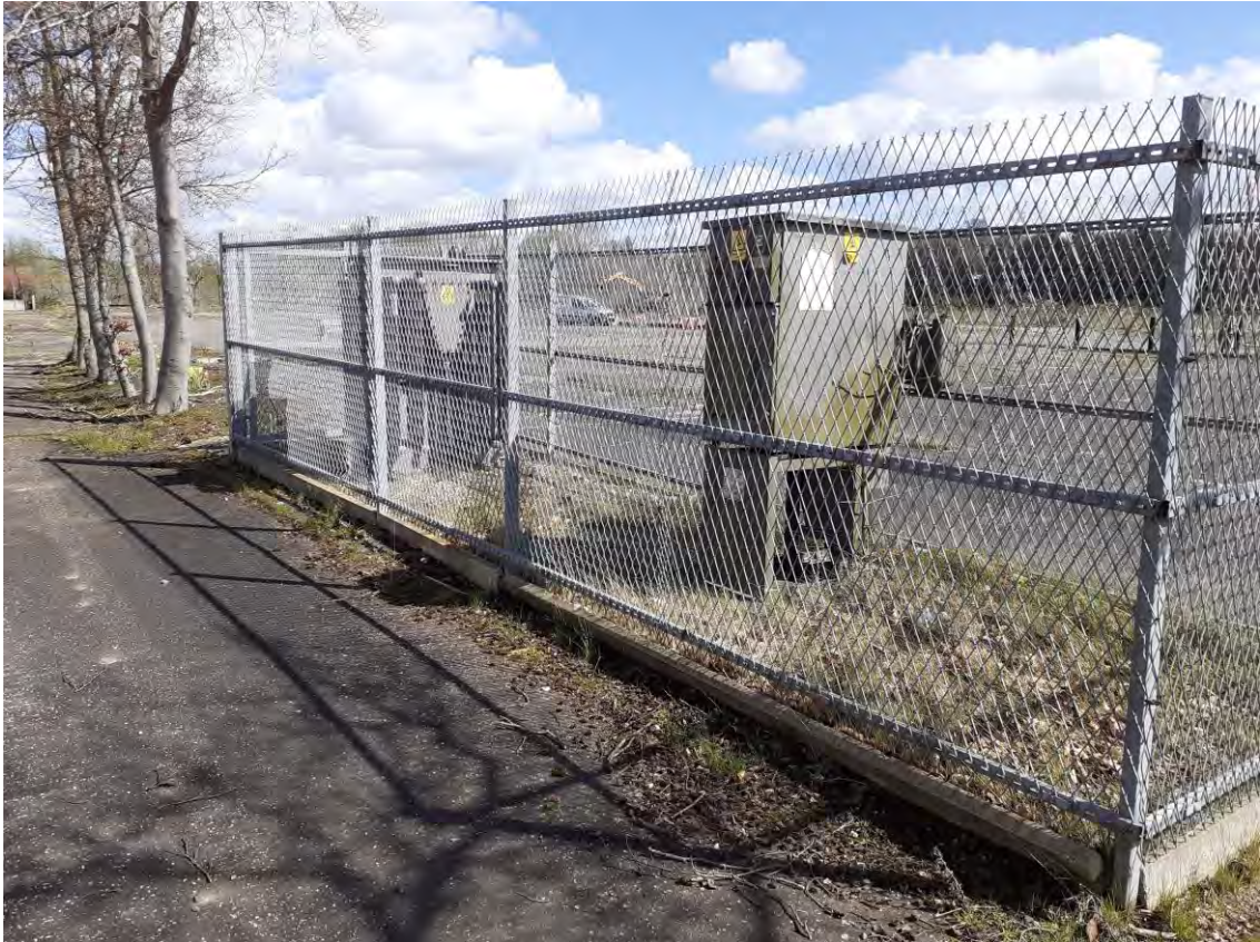
Photograph 24 : Substation to the west of the northerly office building