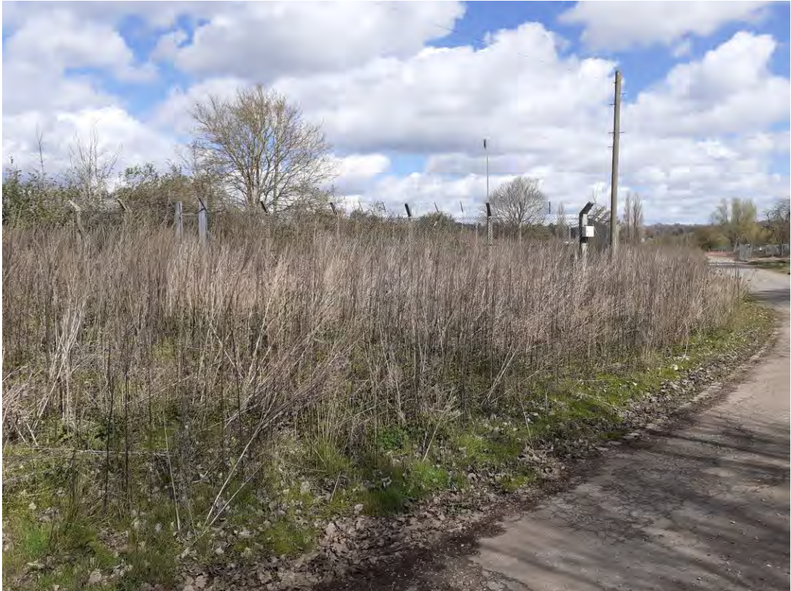
Photograph 5 : Off site fenced gas valve compound.