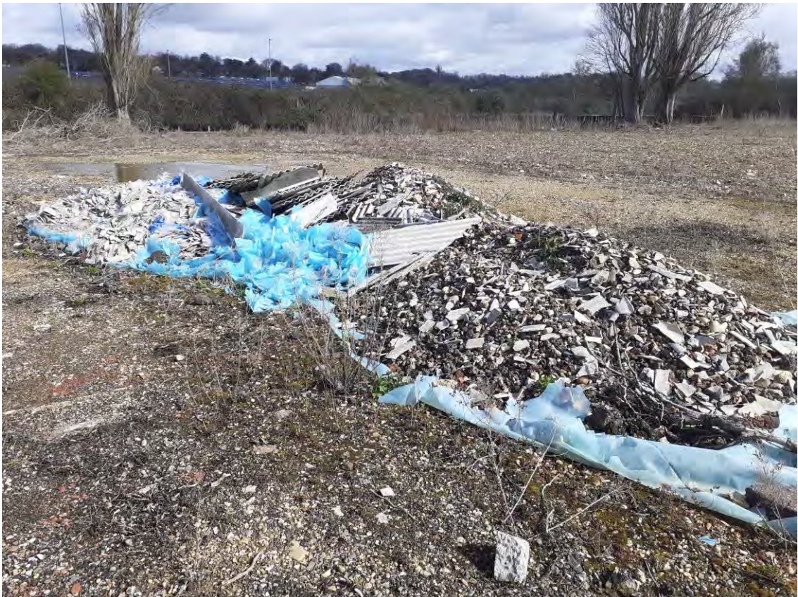
Photograph 10: North western portion of the site with cement board sheets and fragments.