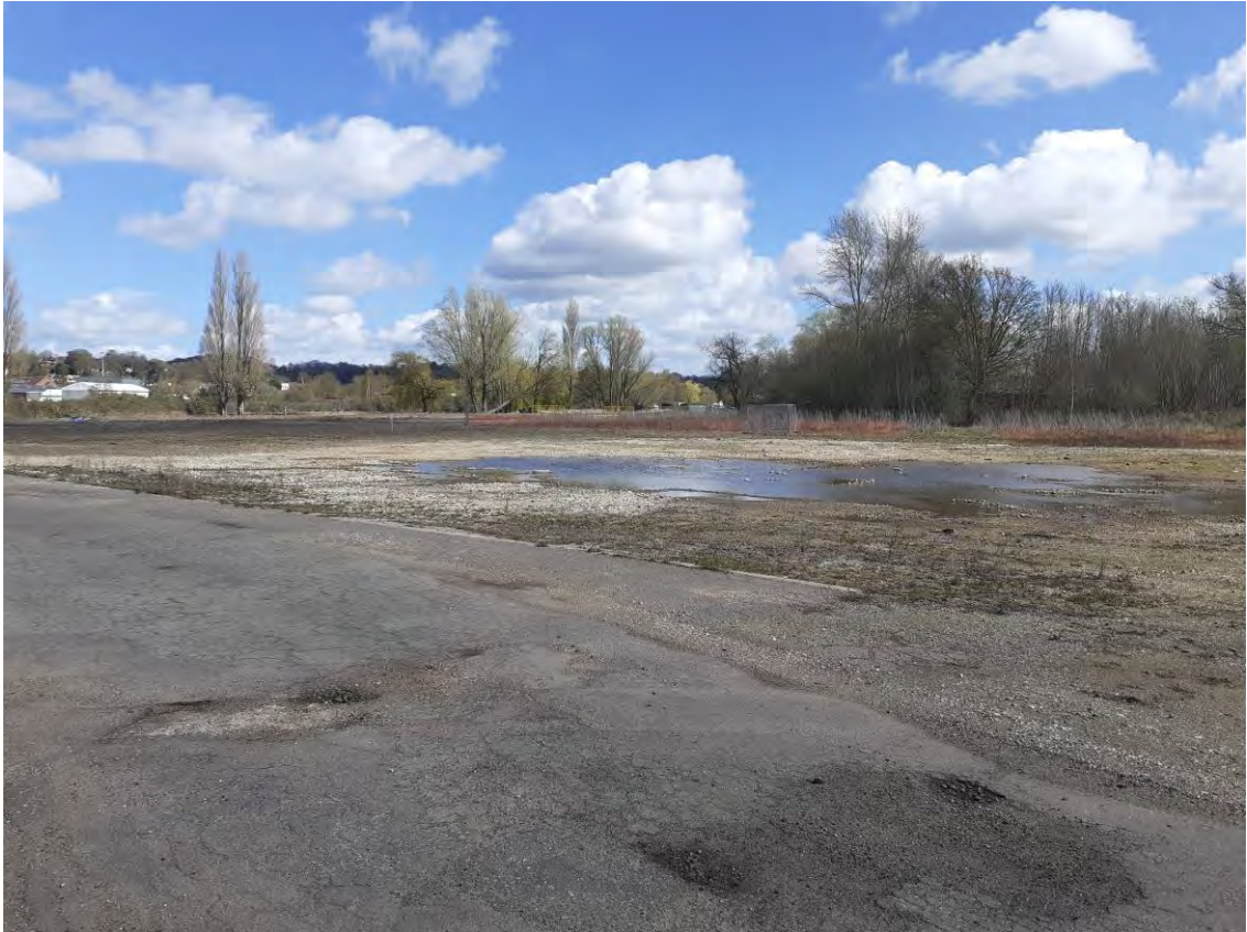
Photograph 9 : Northern area where site widens. Location of the historical industrial works.