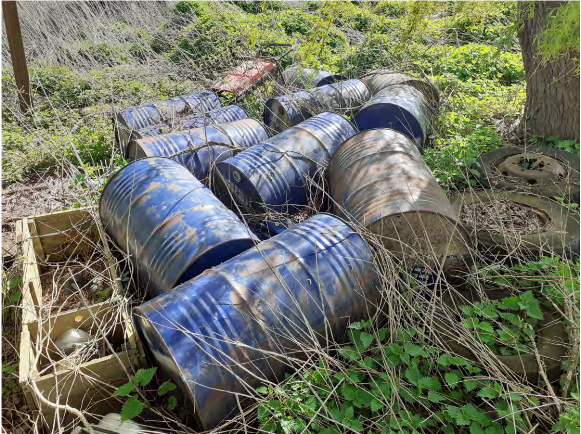
Photograph 13 : Unidentified barrels, and tyres