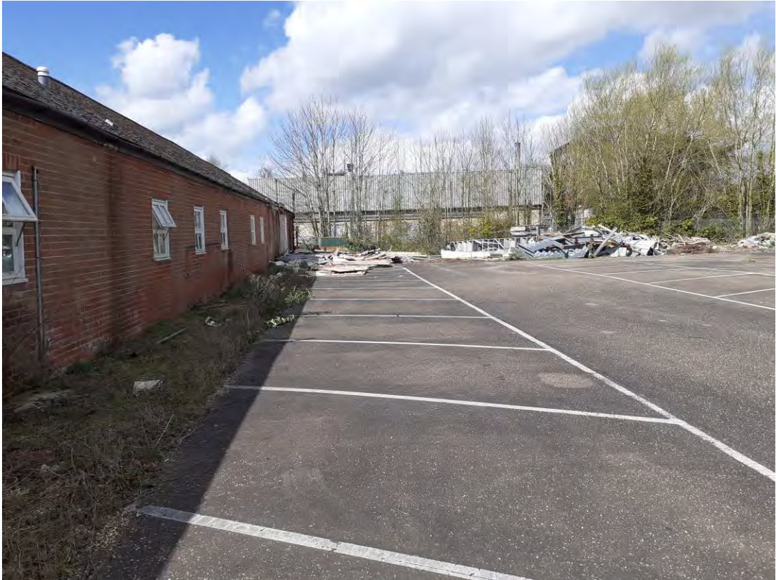
Photograph 20: Heating oil tank and scrap to the north of the buildings in the south west corner.