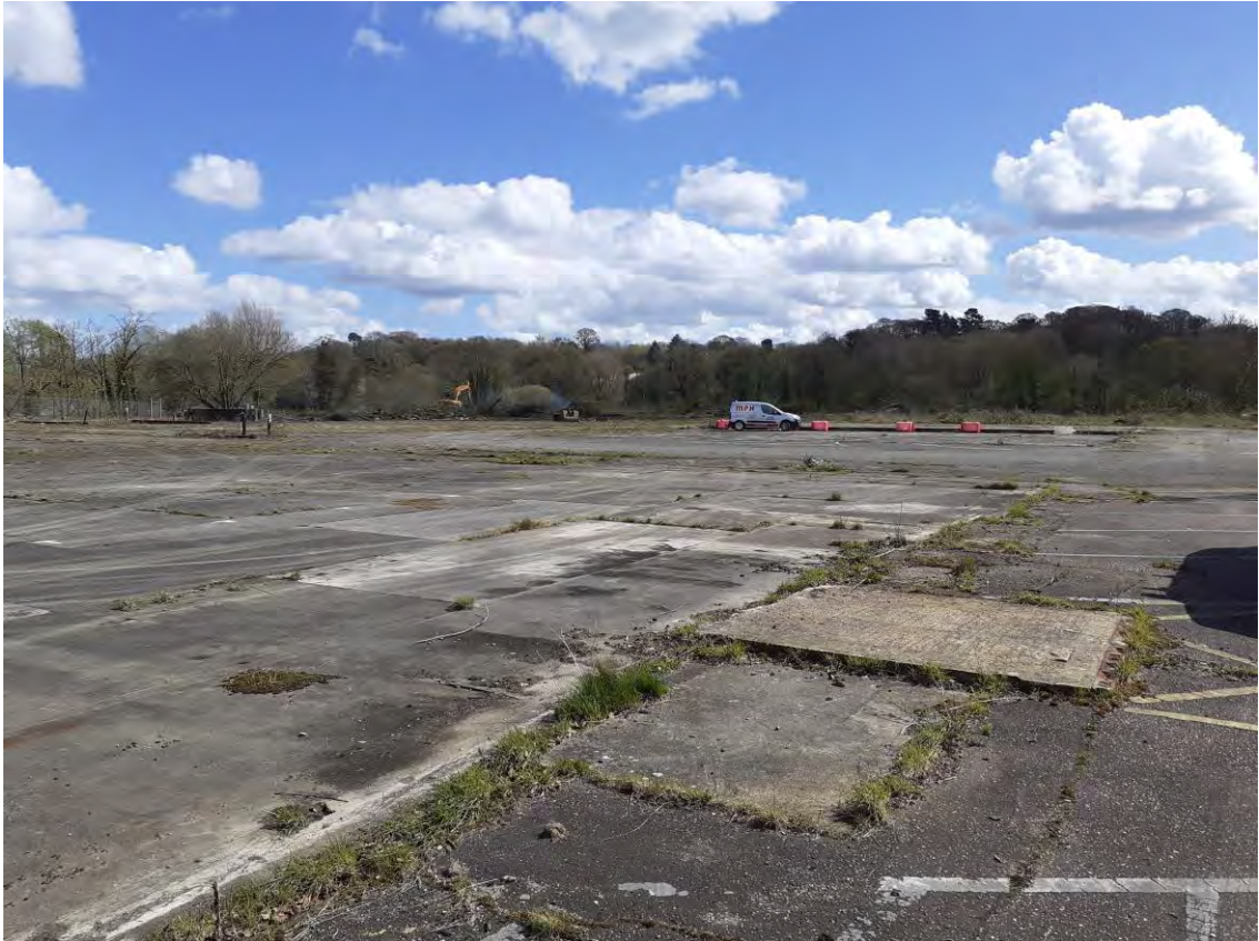
Photograph 26: View to the north east