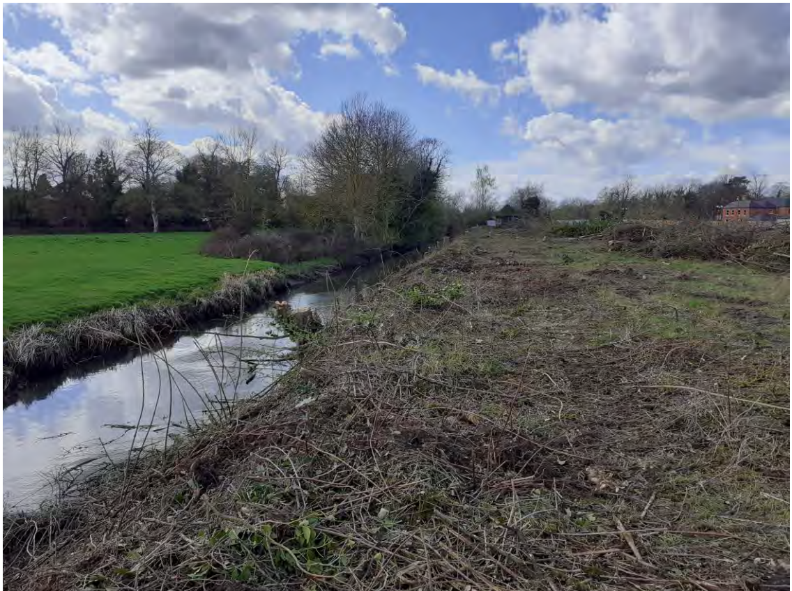
Photograph 31: View along the eastern boundary from the north east corner looking to the south