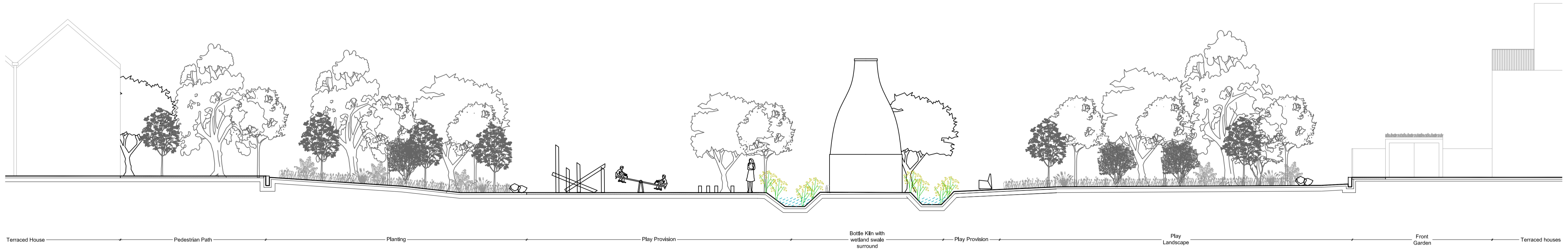
01 Section D-D 201 Wensum Edge: LEAP / LAP Play Area SCALE 1:125@A1

Note: Land profile is indicative only and should be read in conjunction with the levels set out in the FRA and Architects drawings, which take precedence.