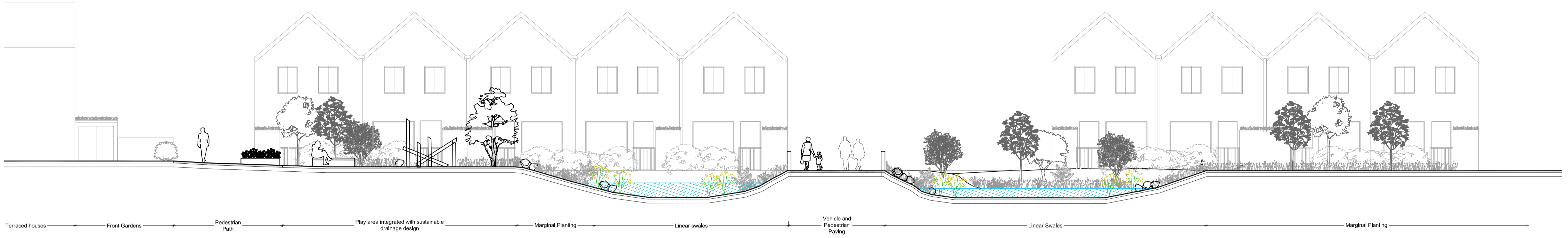
01 Section A-A 201 The Views: Fen Landscape SCALE 1:125@A1

Note: Land profile is indicative only and should be read in conjunction with the levels set out in the FRA and Architects drawings, which take precedence.