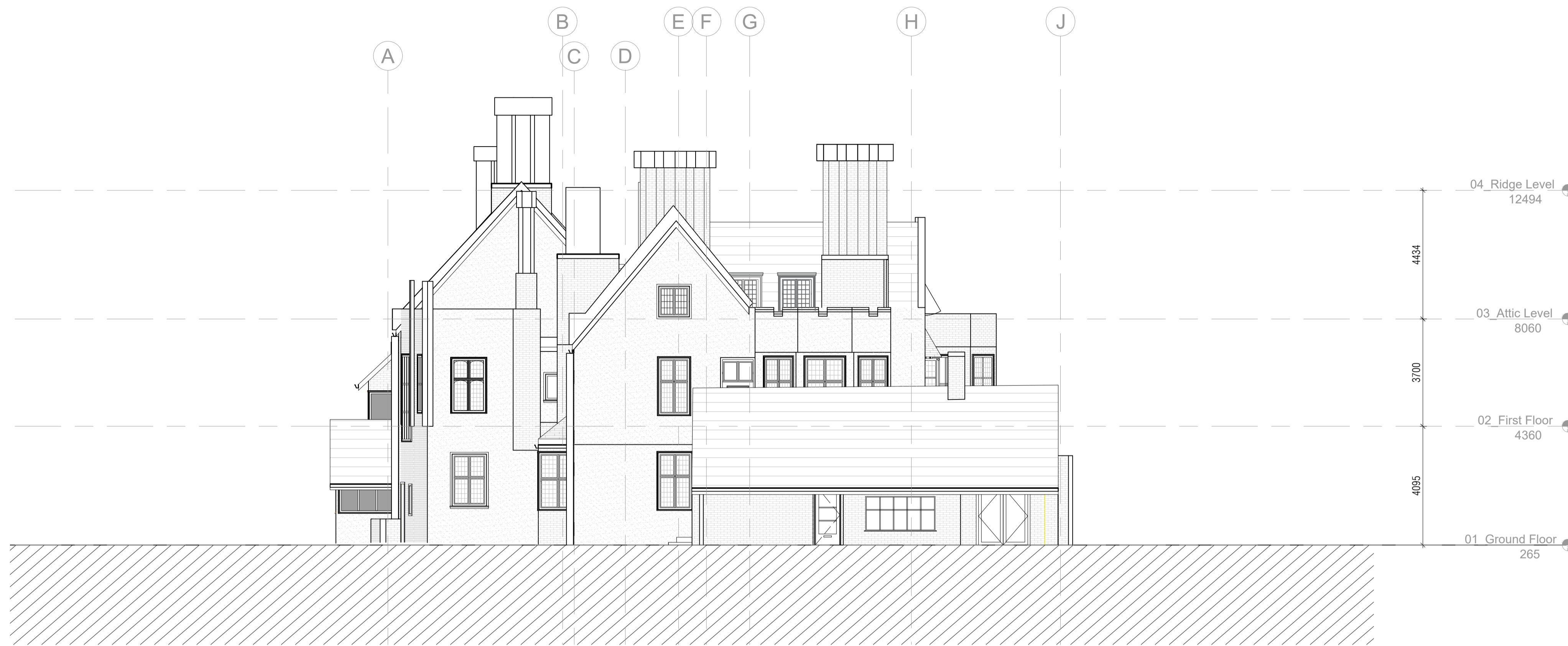
1 South Elevation (To Car Park) 1201 1:100