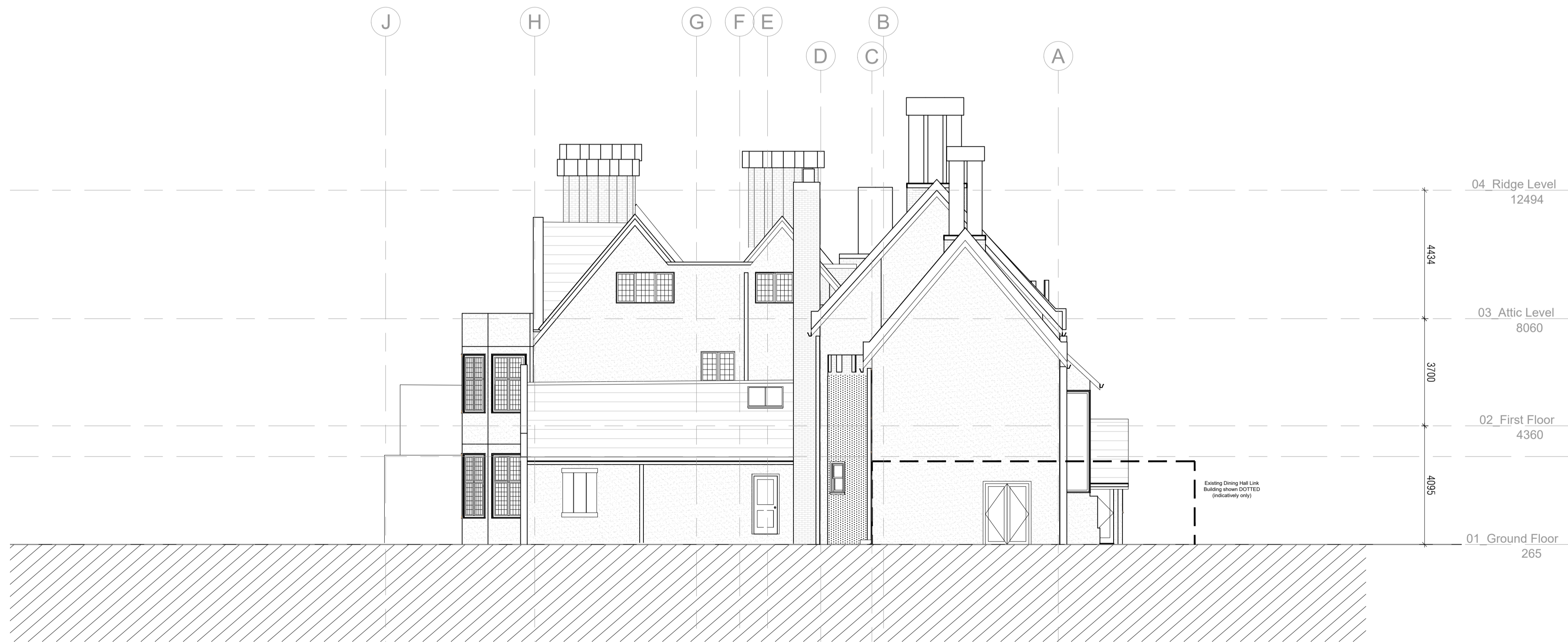
2 North Elevation (to Dining Hall) 1201 1:100