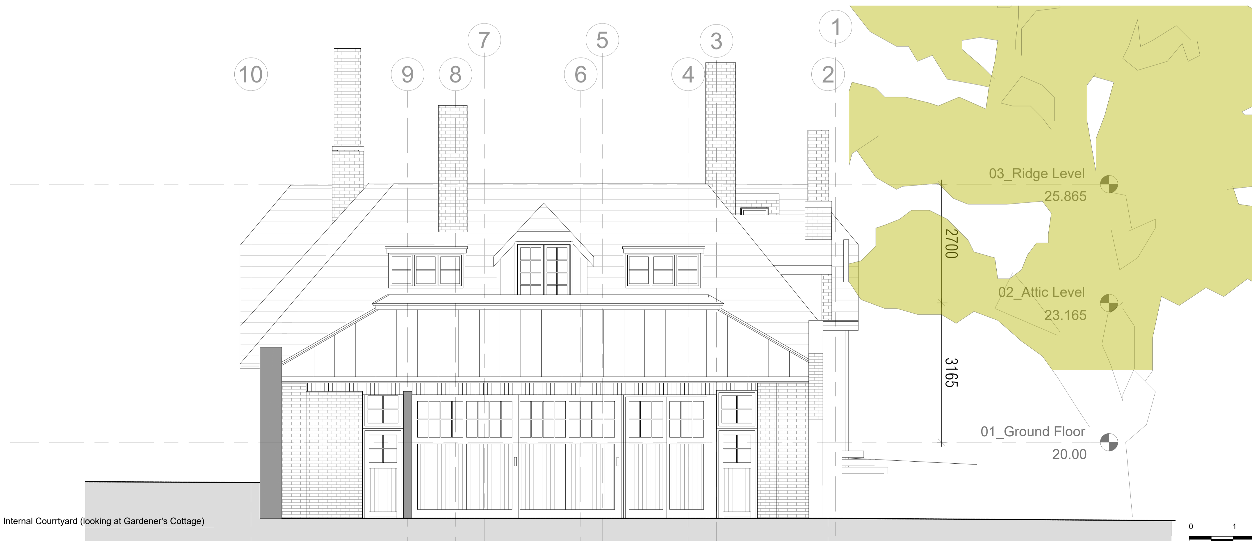
2 East Elevation: Internal Courtyard (looking at Gardener's Cottage) 1253 1:50