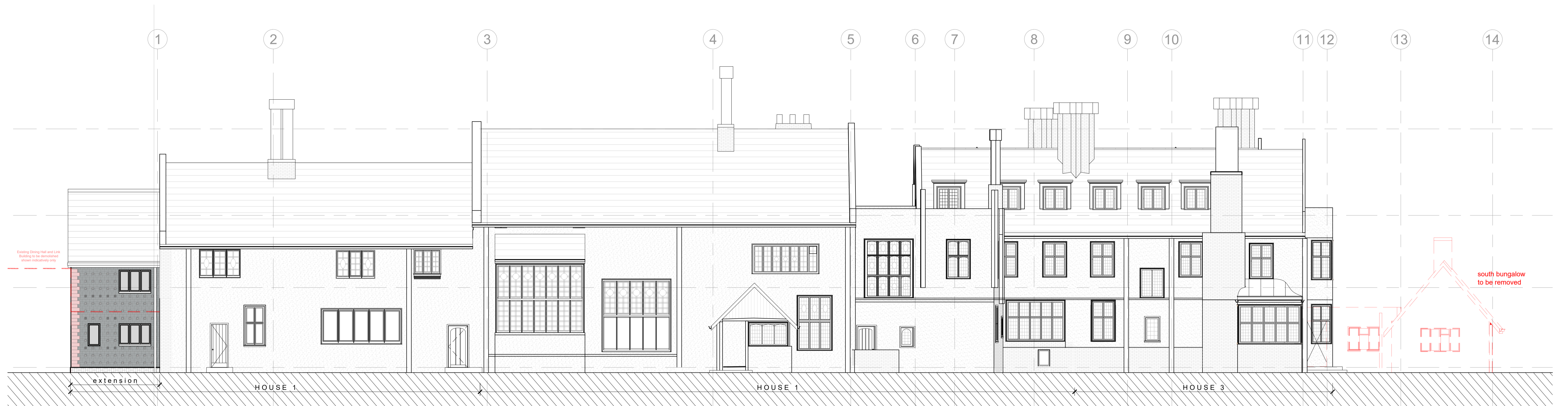
1 West Elevation (Main Entrance) 2200 1:100