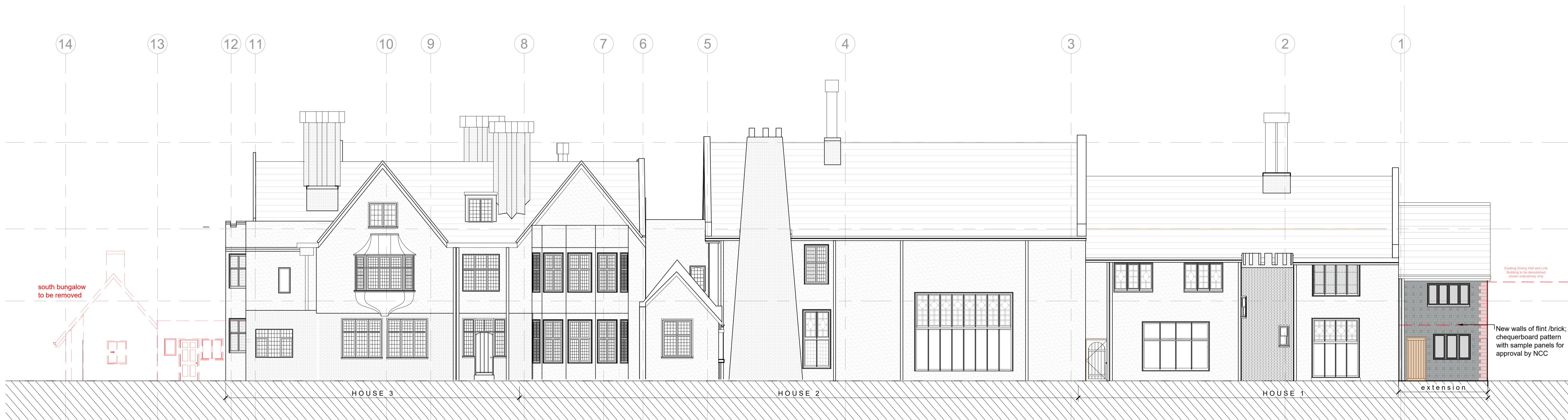
2 East Elevation (Garden/ Schedule Monument) 2200 1:100