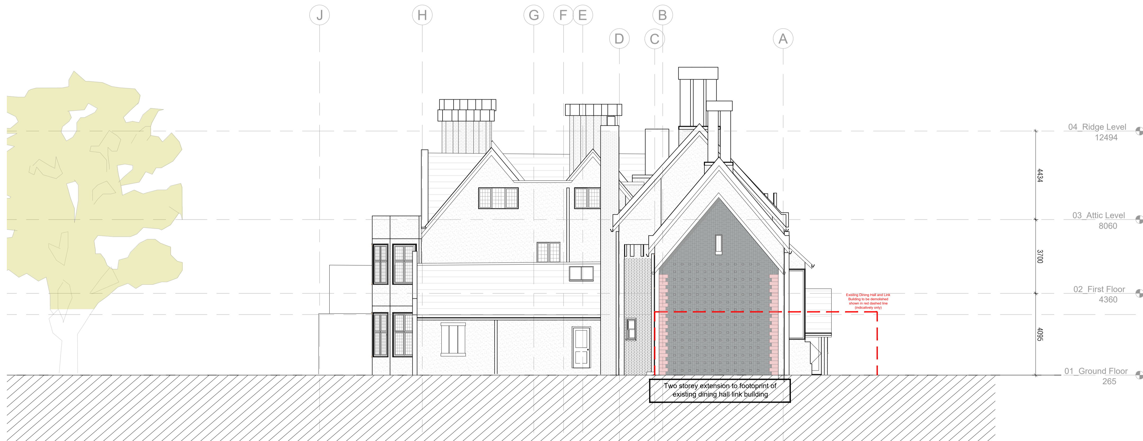
2 North Elevation (to Dining Hall) 2201 1:100