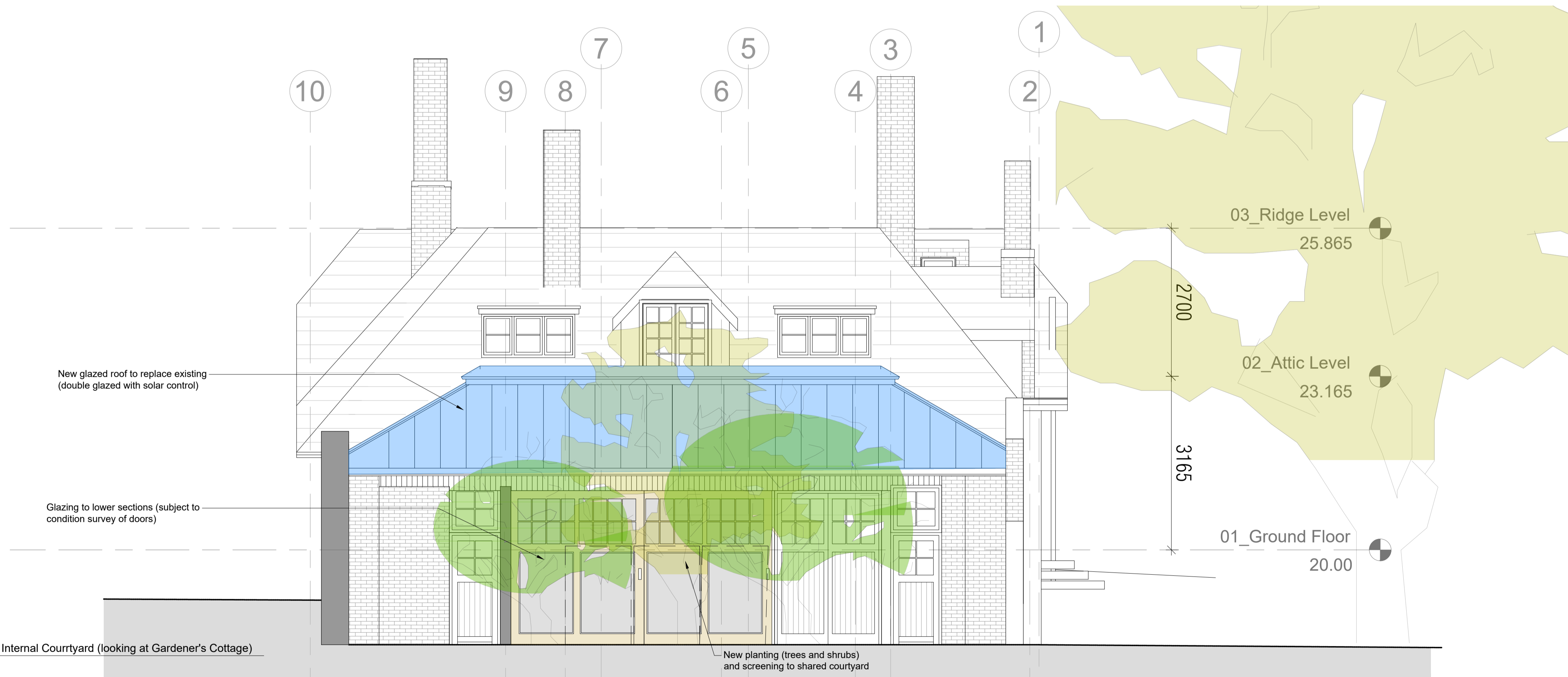
2 East Elevation: Internal Courtyard (looking at Gardener's Cottage) 2253 1:50