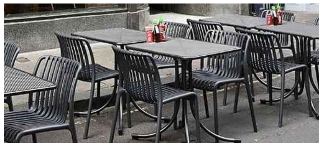
TABLES AND CHAIRS