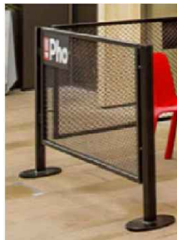
METAL GRILL CAFE BARRIER

A PROPOSED - EXTERNAL SEATING AREA SCALE 1:25@A1 / 1:50@A3