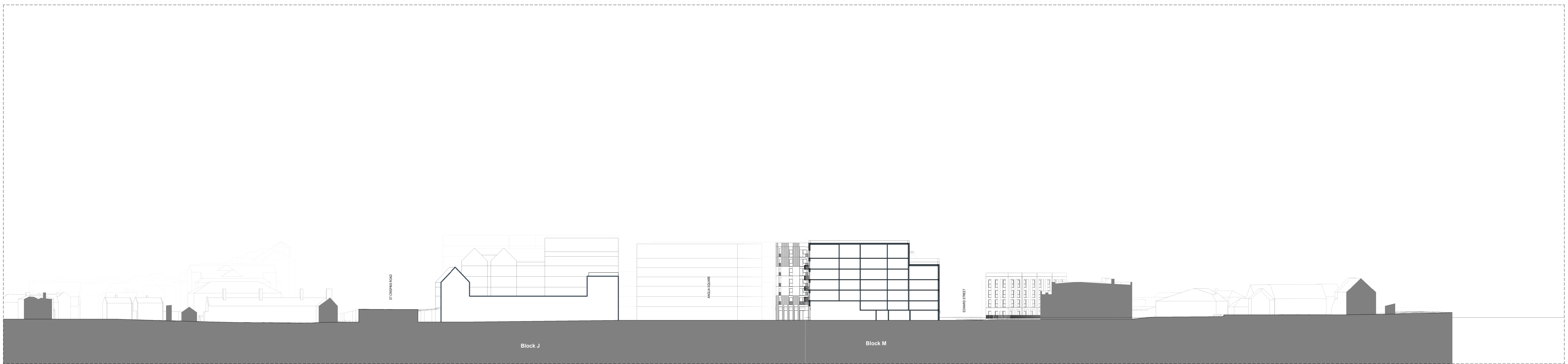
3 Site Section 06 Scale 1 : 500

Contractors and consultants are not to scale dimensions from this drawing