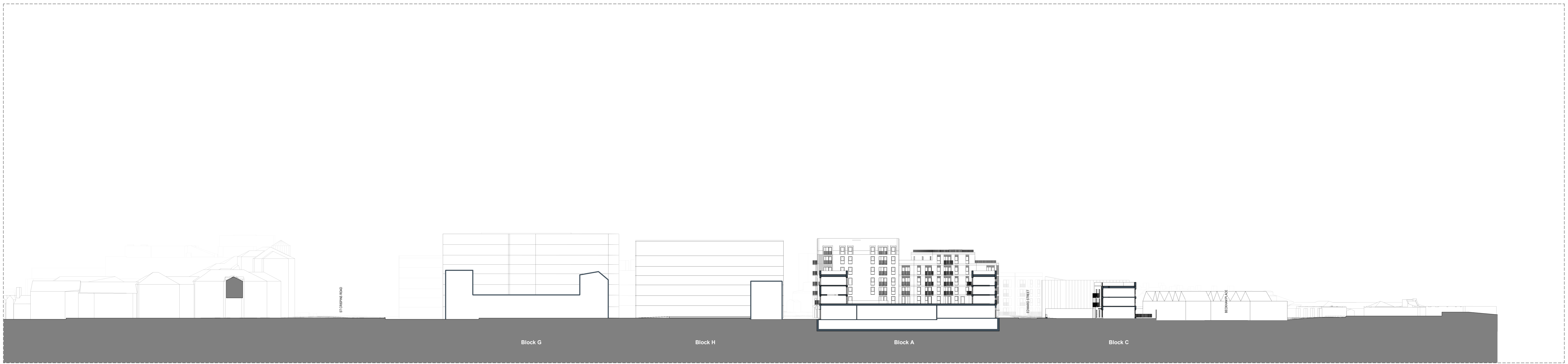
2 Site Section 05 Scale 1 : 500