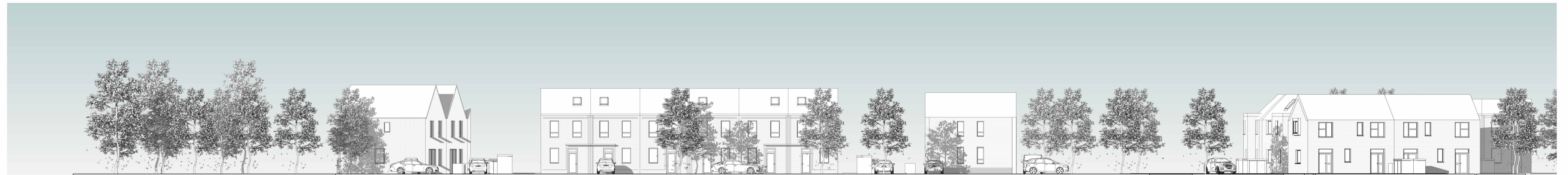
(2) North elevation