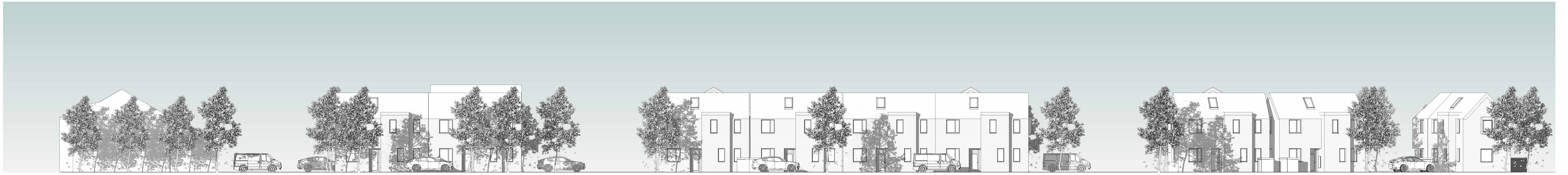
(1) East Elevation