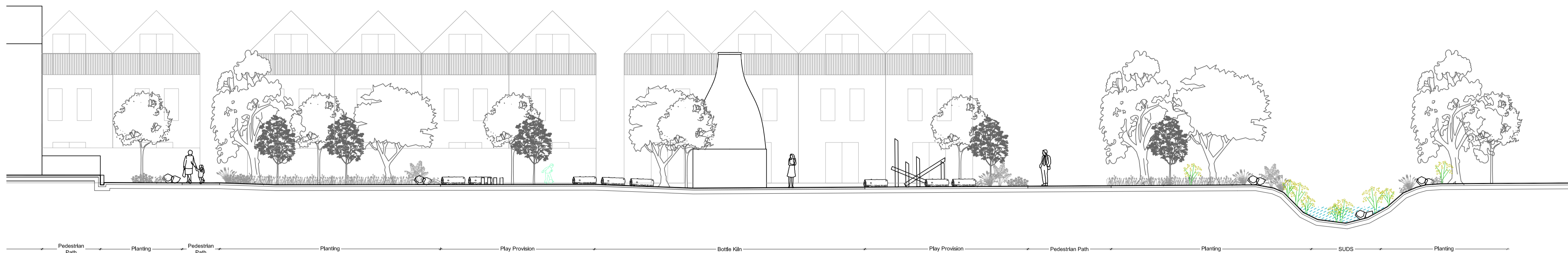
01 Section E-E 202 The Views: Fen Landscape SCALE 1:125@A1

Note: Land profile is indicative only and should be read in conjunction with the levels set out in the FRA and Architects drawings, which take precedence.