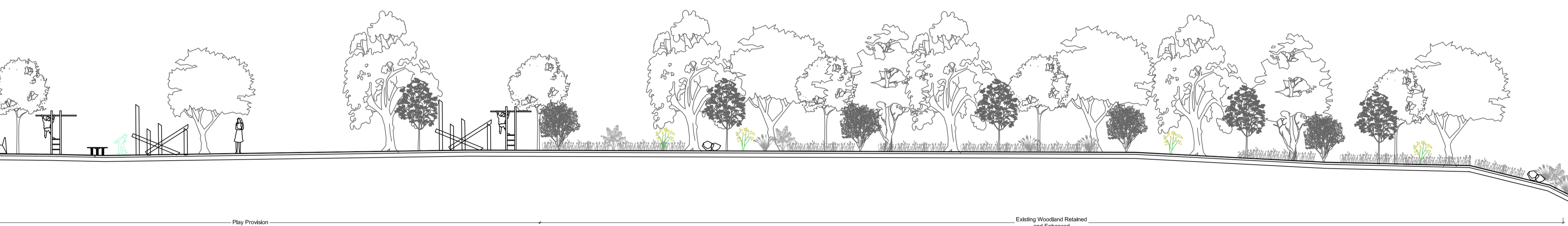
03 Section G-G 202 The Views: Fen Landscape SCALE 1:125@A1

Note: Land profile is indicative only and should be read in conjunction with the levels set out in the FRA and Architects drawings, which take precedence.