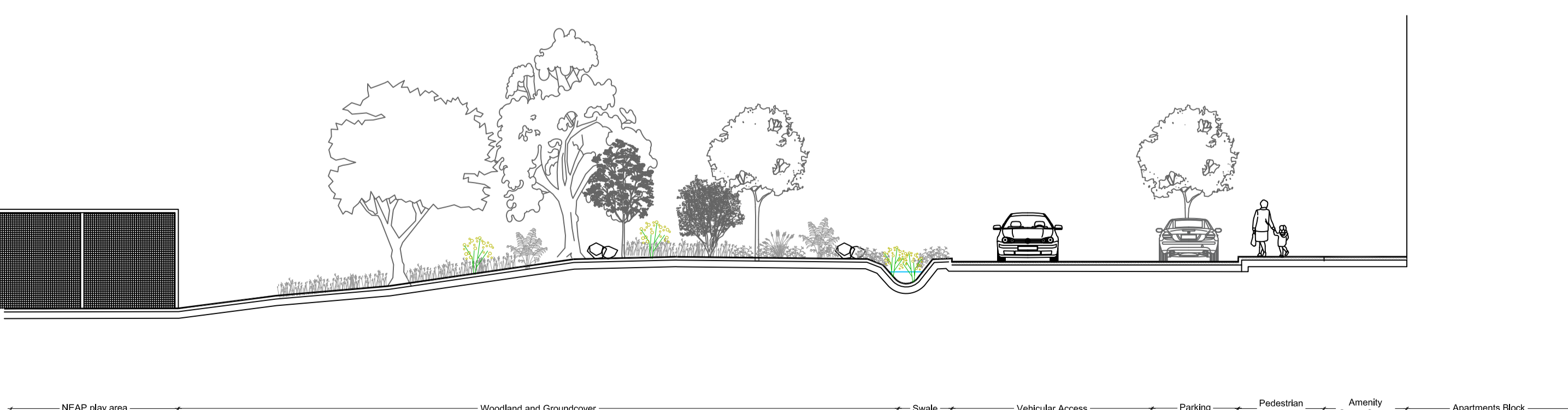
04 Section H-H 202 The Views: Fen Landscape SCALE 1:125@A1

Note: Land profile is indicative only and should be read in conjunction with the levels set out in the FRA and Architects drawings, which take precedence.