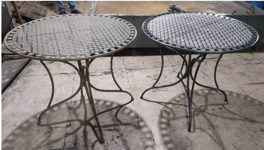
Metal Circular Table Dimensions 650mm diameter and 900mm diameter