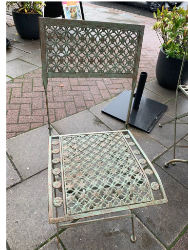
Metal Side Chair Dimensions 450x450x850(h)mm.